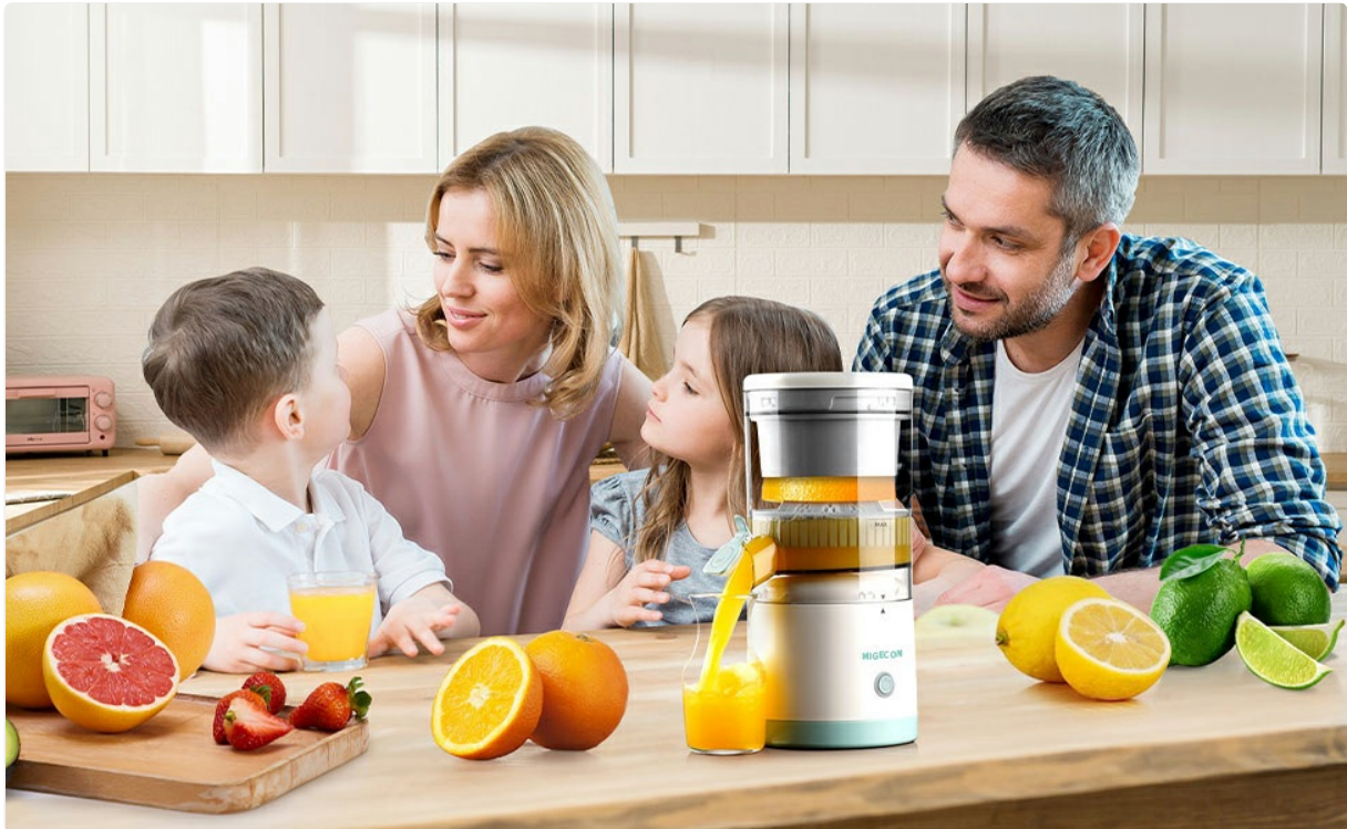
Image: Step-by-step guide for juicing with the MIGECON Electric Citrus Juicer.

Your browser does not support the video tag.