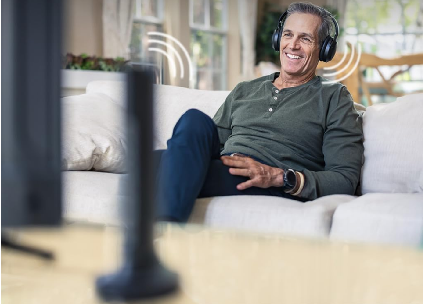
Figure 7: Enjoy perfectly synchronized audio and video with minimal delay.

A latency of less than 30ms provides perfectly synced visual & audio.