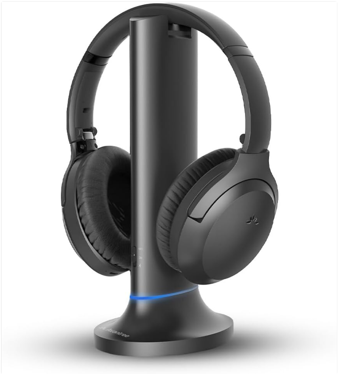
Figure 1: Avantree Opera Plus Headphones on Charging Dock.