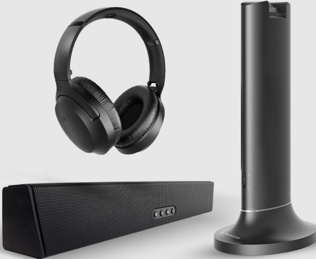
Figure 5: Illustration of the pass-through support feature, enabling simultaneous audio output to headphones and a soundbar.

Listen through both the soundbar/external speaker and your headphones simultaneously.