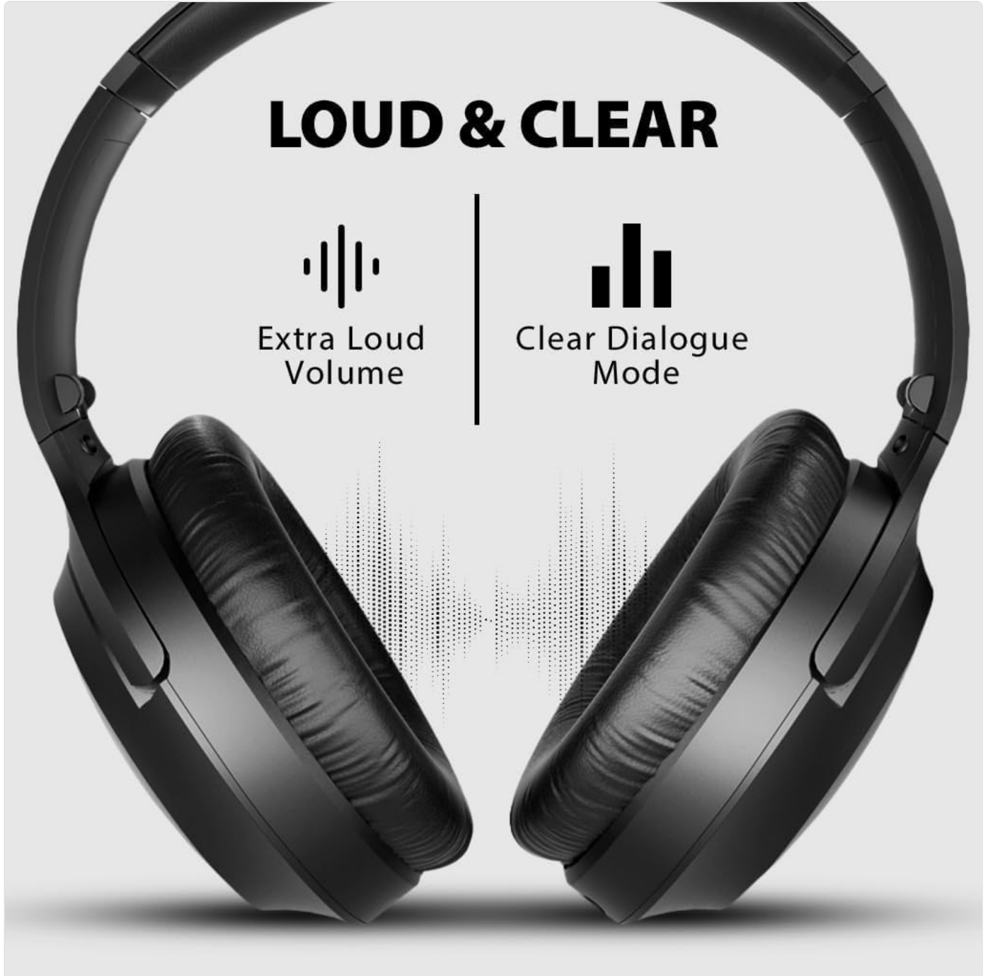
Figure 4: Visual representation of Clear Dialogue and Extra Loud Volume capabilities.