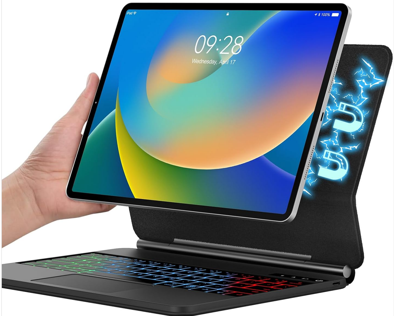
Figure 4: Floating Cantilever Stand. The image shows the keyboard case with an iPad attached, illustrating the stable, adjustable stand that elevates the iPad for comfortable viewing and typing.

Easy to set up from a powerful magnetic network, which will hold onto the iPad tightly and won't fall off.