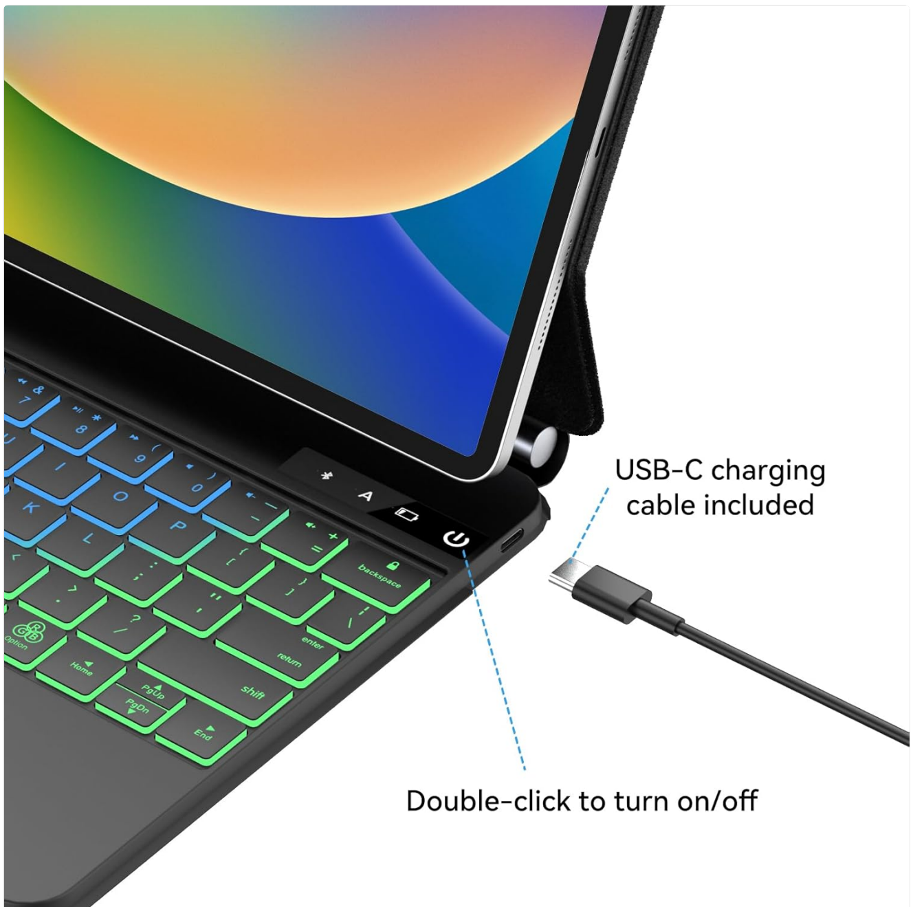
Figure 2: USB-C Charging Port. The image highlights the USB-C port on the keyboard and indicates the power button, which should be double-clicked to turn the keyboard on or off.