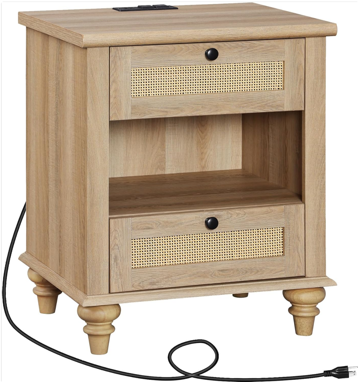
Image: The assembled WAMPAT Rattan Nightstand, showing the power cord extending from the back, ready for use.