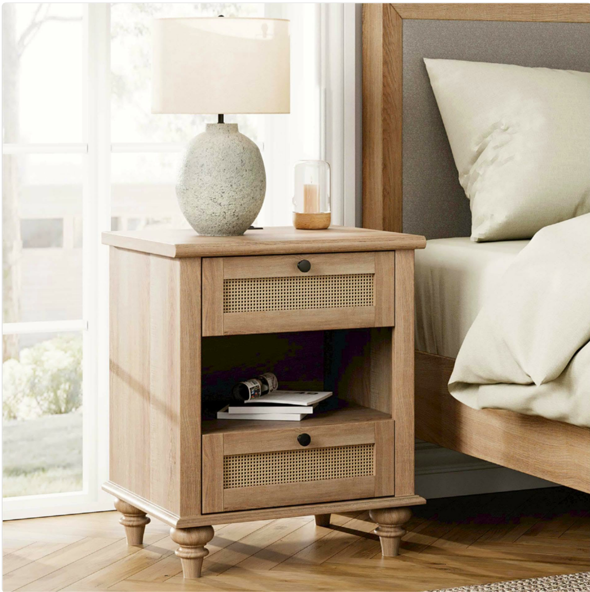
Image: Front view of the WAMPAT Rattan Nightstand with Charging Station, showcasing its light oak finish and rattan drawers.