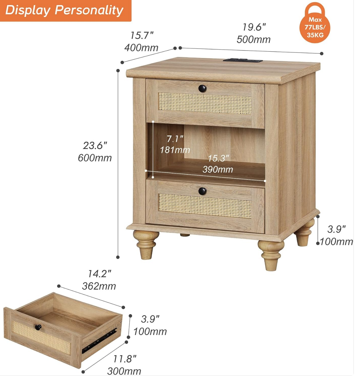
Image: Detailed dimensions of the nightstand, showing its height, width, and depth, along with drawer measurements.