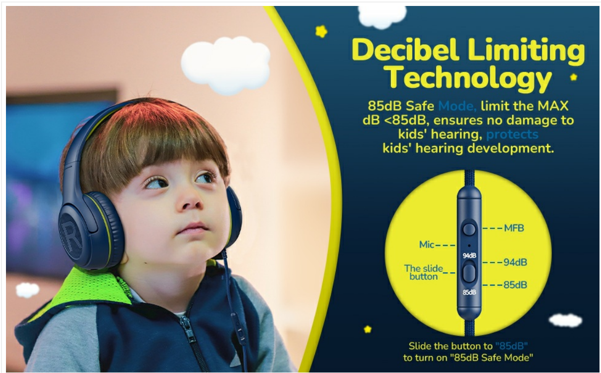
Figure 4: 3.5mm Jack Compatibility