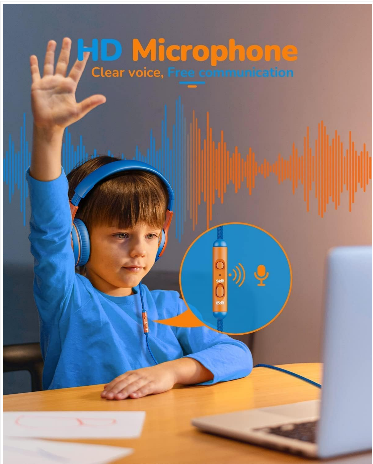
Figure 6: HD Microphone for Clear Communication