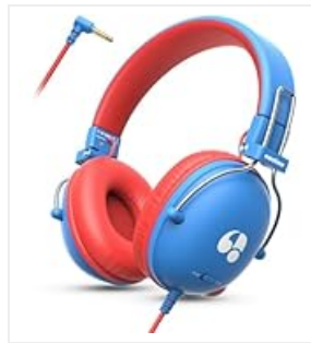
Figure 9: Headphone Size Comparison for Various Ages