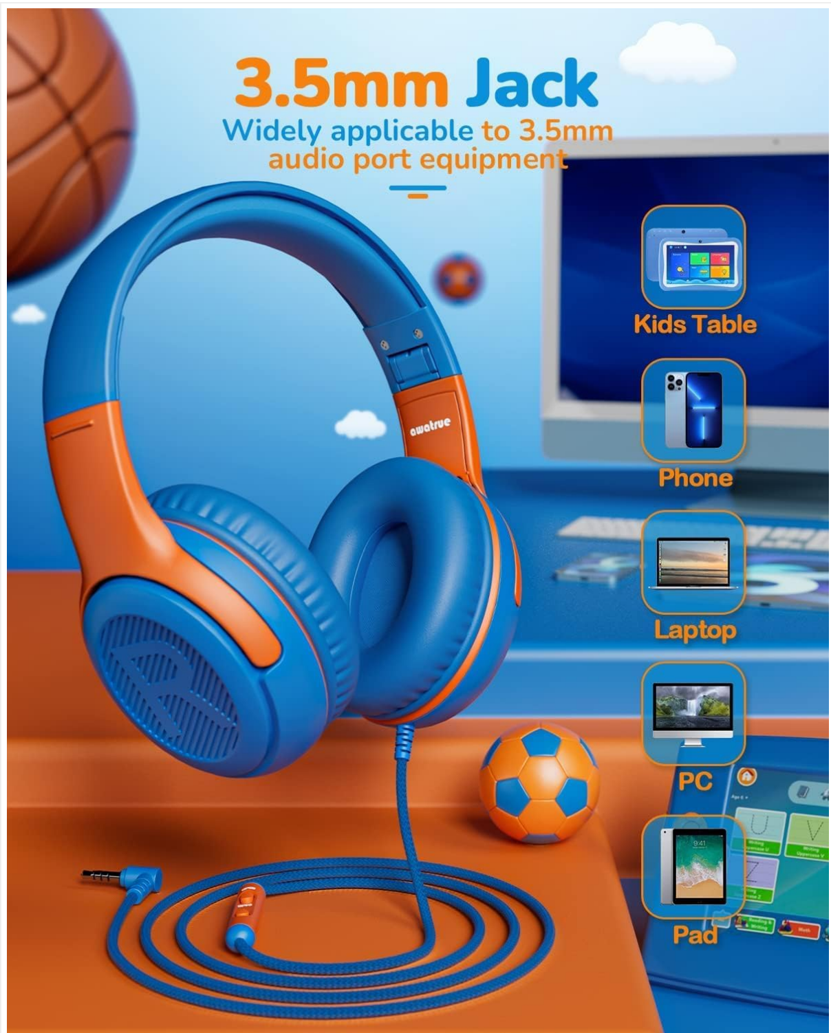
Figure 3: Foldable Design for Easy Storage