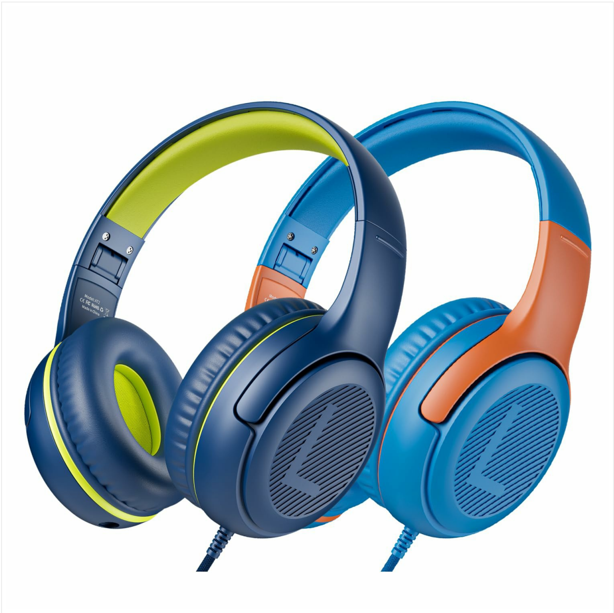
Figure 1: awatrue AT2 Kids Wired Headphones