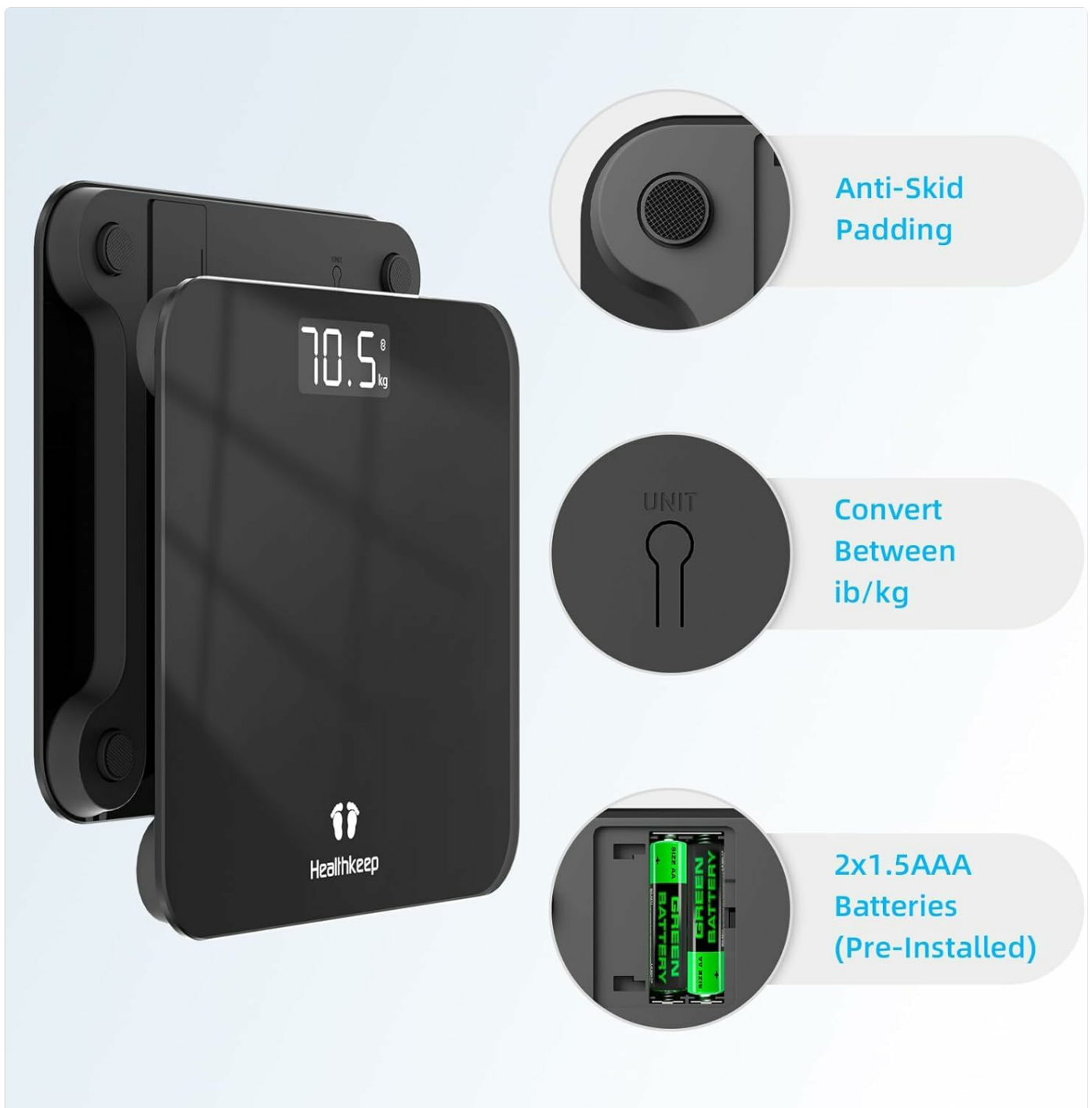
Image: A detailed view of the underside of the scale, specifically pointing out the "UNIT" button used for switching between pounds and kilograms.