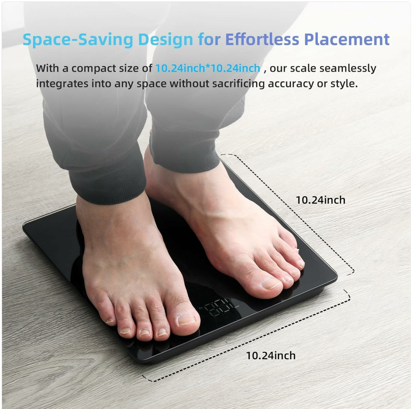
Image: A person's feet on the Healthkeep T107 scale, visually representing its compact dimensions of 10.24 inches by 10.24 inches, highlighting its space-saving design.

With a compact size of 10.24inch*10.24inch , our scale seamlessly integrates into any space without sacrificing accuracy or style.