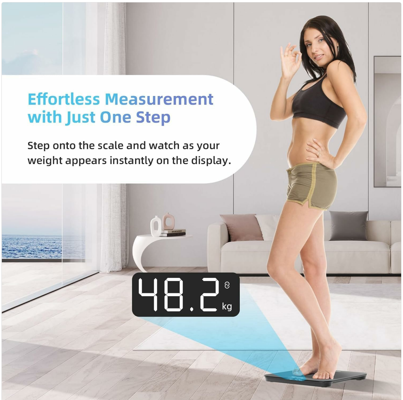
Image: A woman stepping onto the Healthkeep T107 scale, demonstrating the instant weight measurement feature with the weight displayed on the screen.