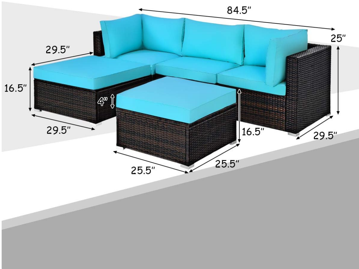
Image: Detailed dimension references for the corner sofa, armless sofa, and ottomans, including cushion thickness.