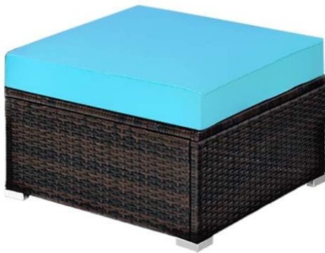
1. Ottoman with Soft Cushion Spacious space for sitting