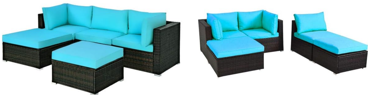
Image: Examples of free and flexible combinations, demonstrating how the modular pieces can be arranged into different sofa and seating configurations.

Allow for different configurations according to your preference & needs