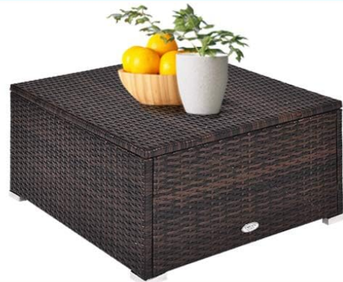
2. Rattan Side Table Ample tabletop for placing magazines and drinks

Image: Illustration of the 2-in-1 design, showing an ottoman used as a comfortable seat with a cushion and as a rattan side table without the cushion.