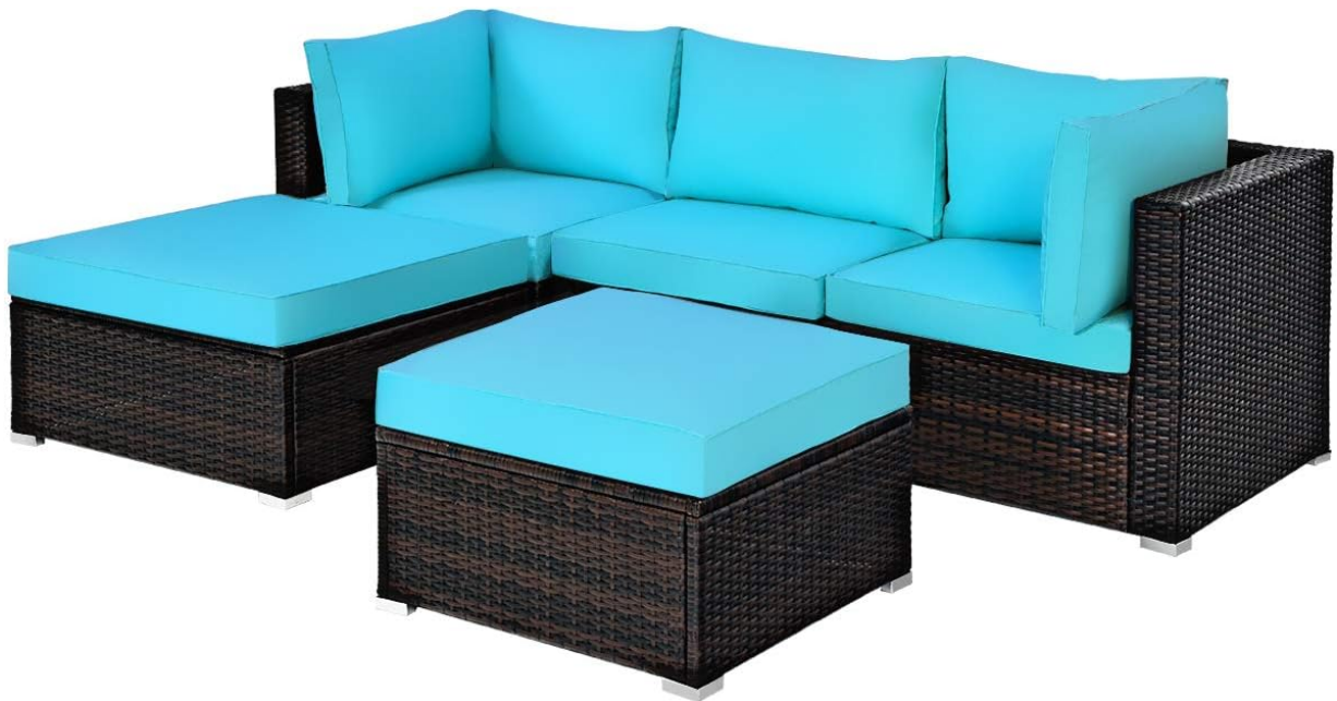
Image: The complete 5-piece outdoor patio furniture set featuring a sectional sofa and two ottomans with turquoise cushions.

This user manual provides detailed instructions for the assembly, operation, and maintenance of your COSTWAY 5-Piece Outdoor Patio Furniture Set. Please read this manual thoroughly before assembly and use to ensure proper function and longevity of your furniture.