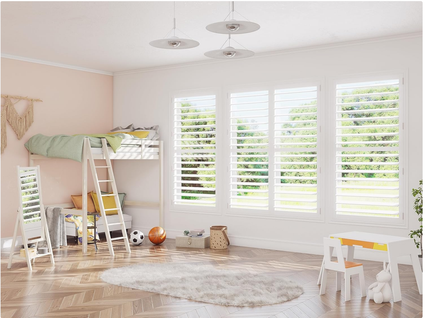
Image: SHUTTER WORKS Plantation Shutters installed in a room, showcasing their ability to control light and enhance interior decor.