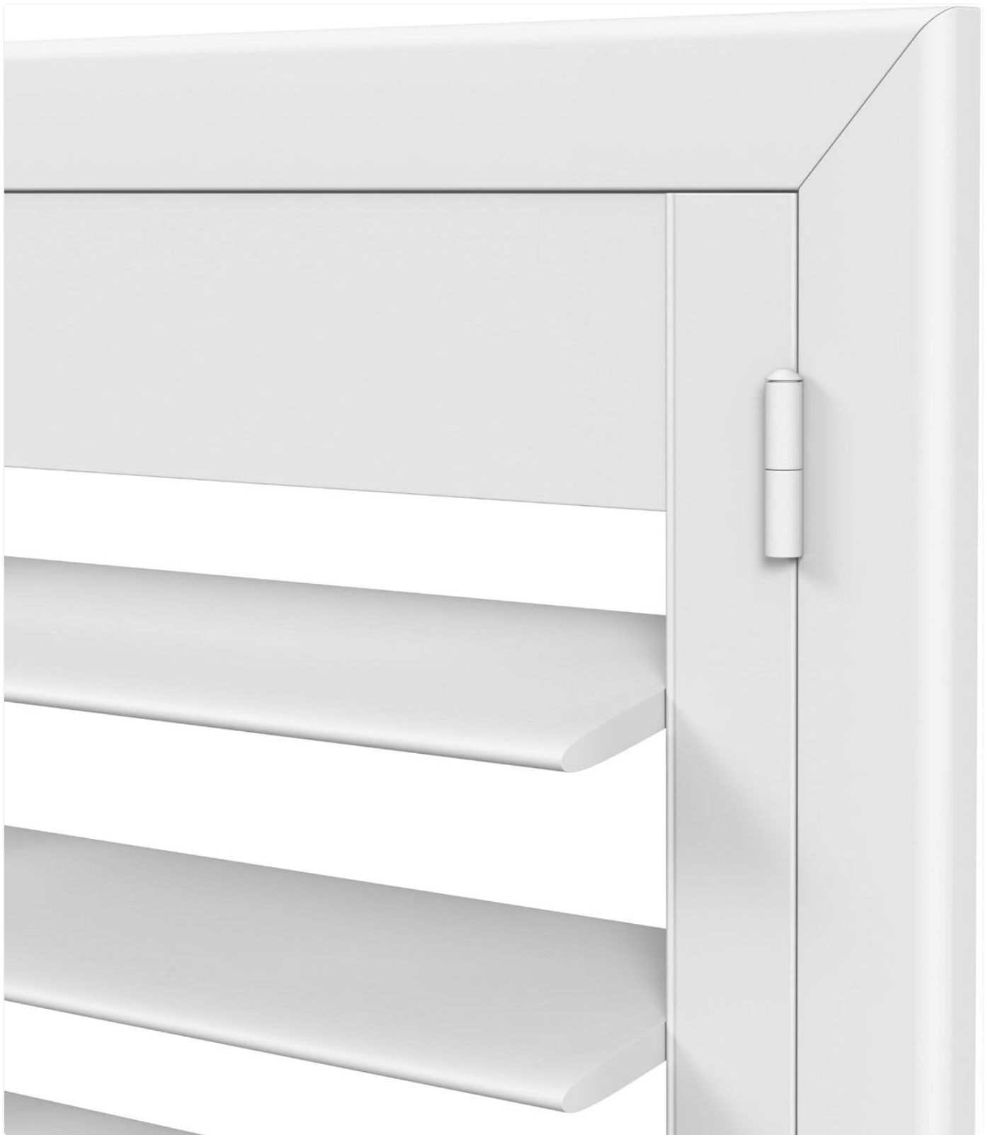
Image: Detail of a shutter hinge, illustrating the hardware used for panel attachment.