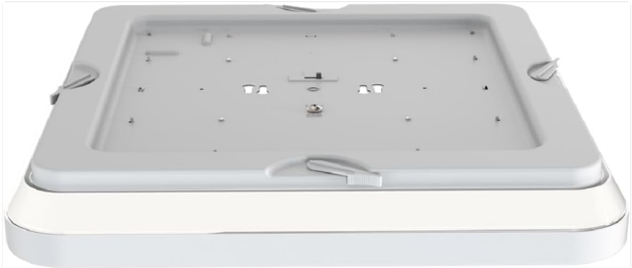
Image: Underside of the fixture with clips in the open position, ready for diffuser removal.