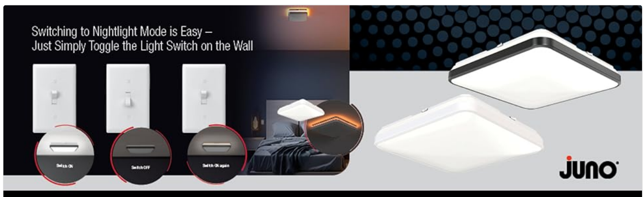
Image: Illustration of the wall switch sequence to activate and deactivate the nightlight mode.

Repeat this sequence to return to normal lighting mode.