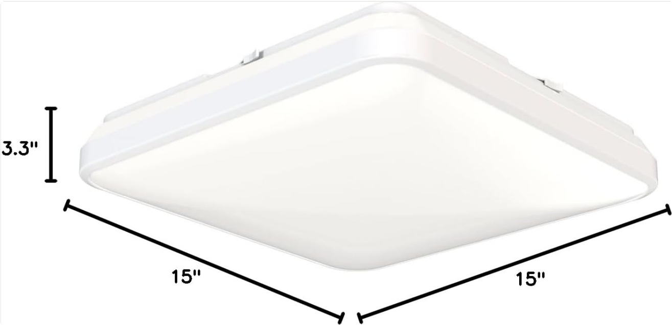
Image: Dimensional drawing of the Juno FMLSQ fixture, indicating its 15-inch length and width, and 3.3-inch height.