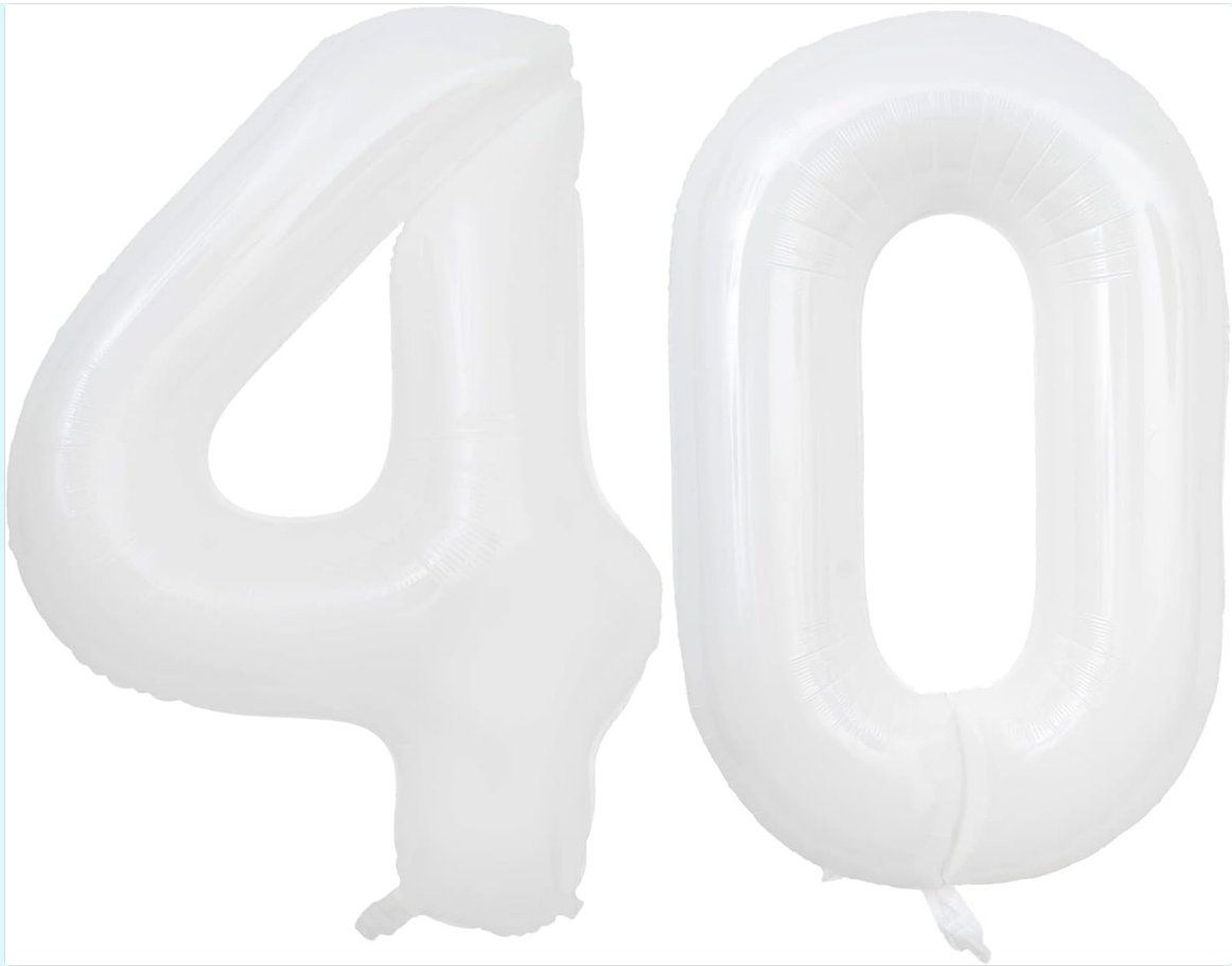
Figure 2: Fully inflated 40-inch white number 40 balloons, ready for display.