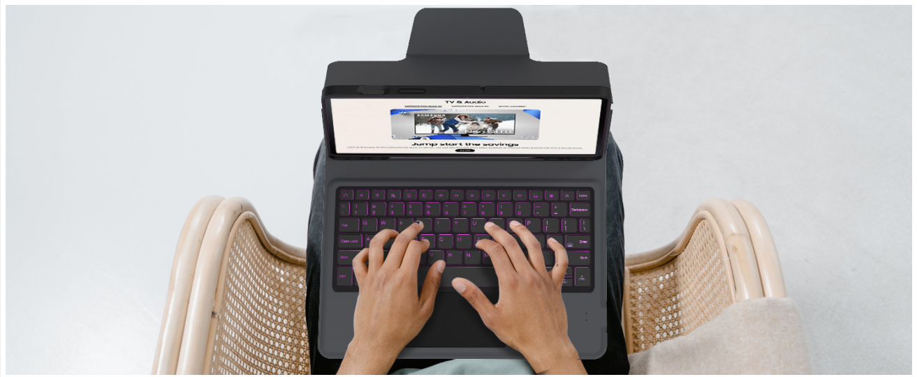
Image: A close-up view of the keyboard and S Pen holder, with text indicating the keyboard's battery capacity and charging details.