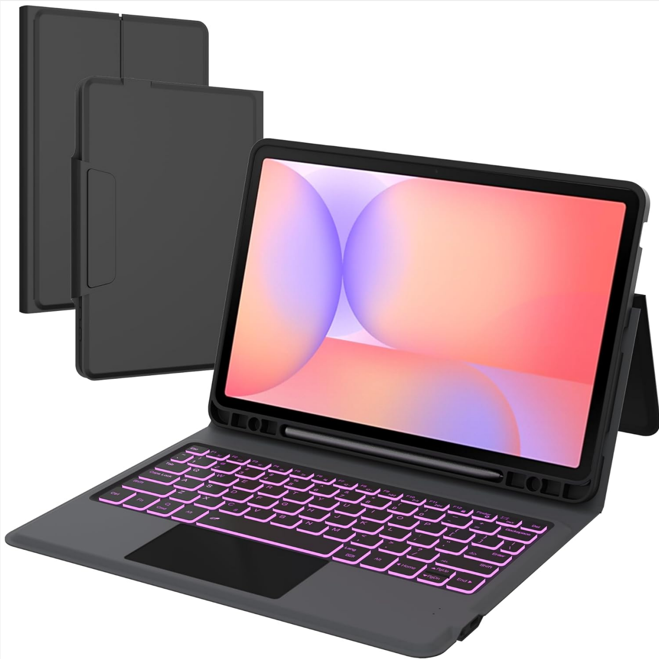
Image: The SNOODU Keyboard Case with a tablet securely placed, demonstrating the overall design and backlit keyboard.