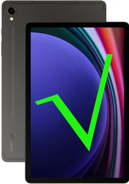
Galaxy Tab S8 11"