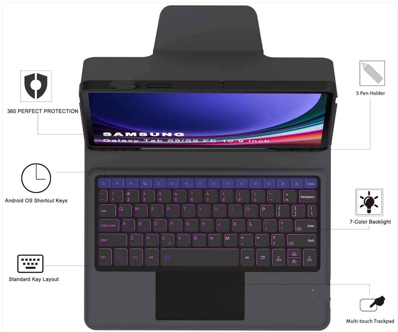
Image: An overhead view of the keyboard case with labels pointing to its various features, including the S Pen holder, 360-degree protection, Android OS shortcut keys, 7-color backlight, standard key layout, and multi-touch trackpad.