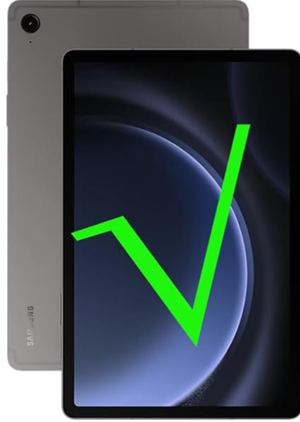
Galaxy Tab S7 11"