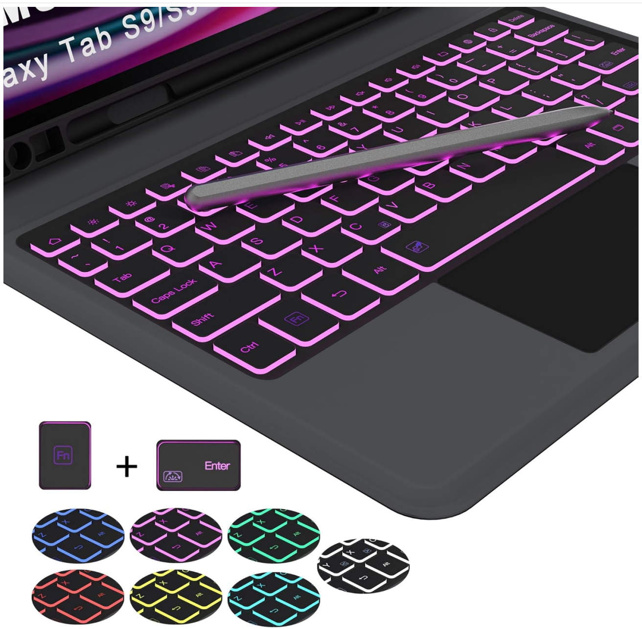
Image: A detailed view of the keyboard highlighting the backlit keys and the 'Fn' and 'Enter' keys used for changing backlight colors.