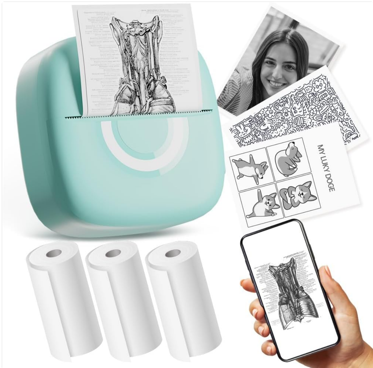
Image 2.1: The cabaro Mini Thermal Printer shown with three rolls of thermal paper and various printed examples, including a photo, a diagram, and cartoon images.