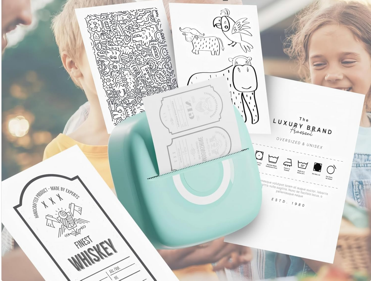
Image 4.3: A family engaging in printing activities with the mini printer, showcasing various printed designs like coloring pages and decorative labels.