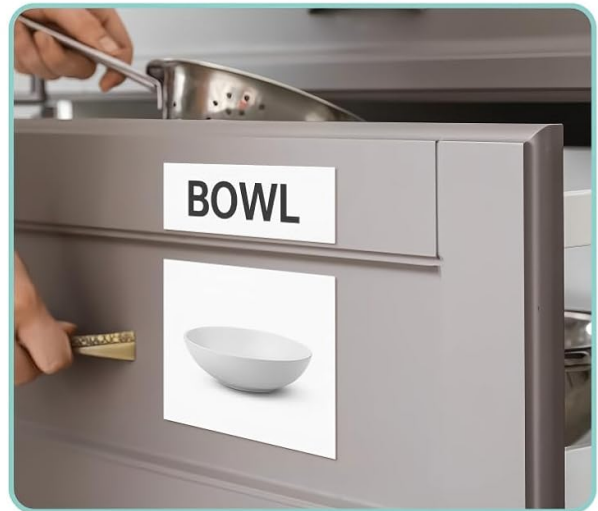
Image 4.1: Examples of the printer's versatility, showing prints used for self-made greeting cards, customized to-do lists, study notes extraction, and daily necessities organization.