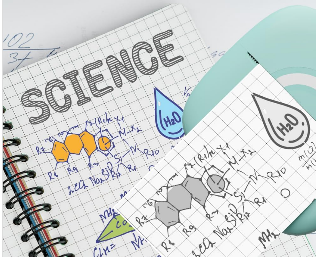
Image 4.4: The mini printer being used to print science-related notes and diagrams, demonstrating its utility for educational purposes.