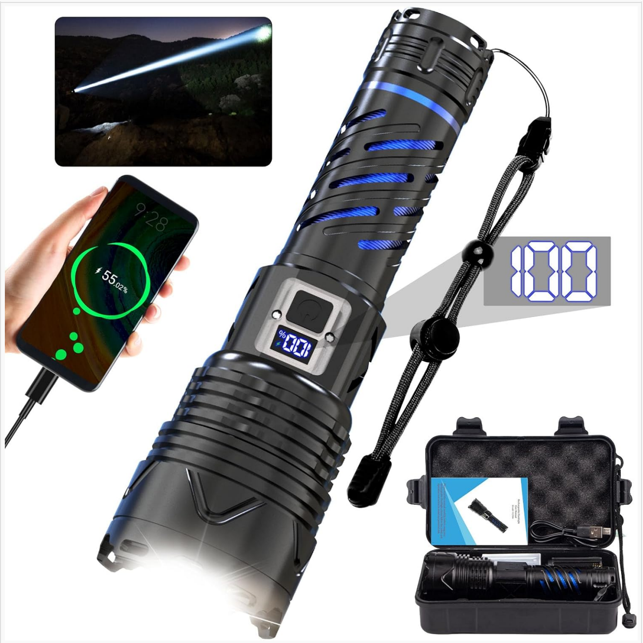
Image: The Karrong Rechargeable Flashlight, its included battery, USB Type-C charging cable, and user manual, all neatly arranged within a protective carrying case.