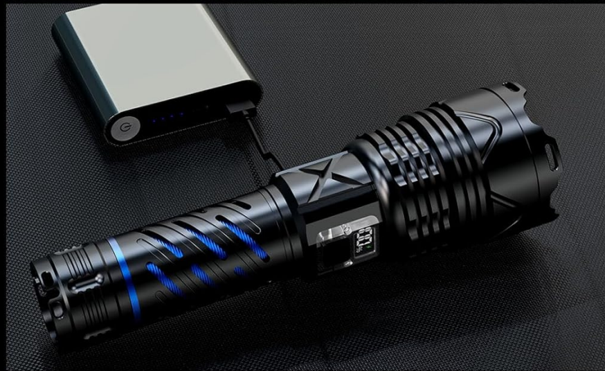
Image: A detailed view of the Karrong flashlight, highlighting the digital power display showing "100%" and the USB Type-C input/output port for charging and power bank functionality.