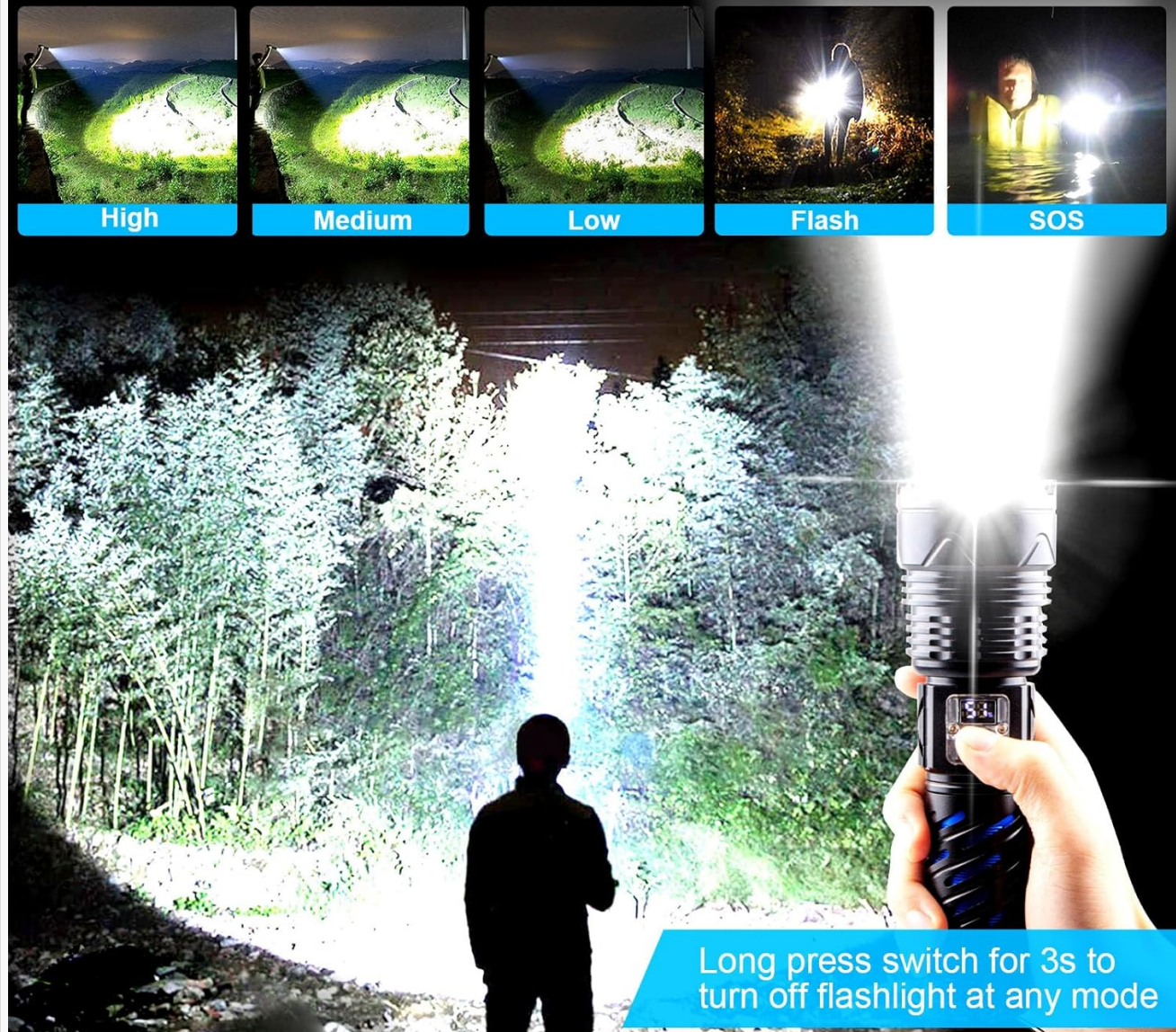
Image: A visual representation of the five lighting modes: High, Medium, Low, Flash (Strobe), and SOS, with a hand holding the flashlight and text indicating to long-press the switch to turn it off.