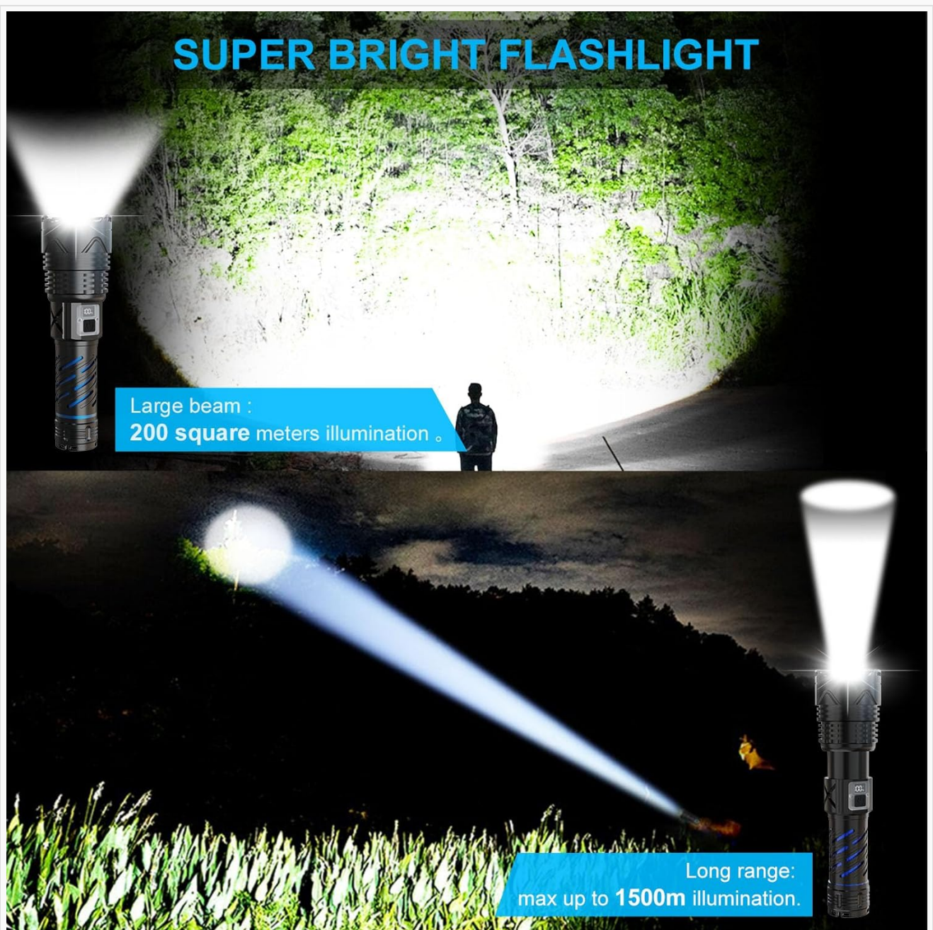
Image: Two scenarios illustrating the flashlight's beam capabilities. The top image shows a wide floodlight illuminating a large area (200 square meters). The bottom image shows a focused long beam reaching up to 1500 meters.