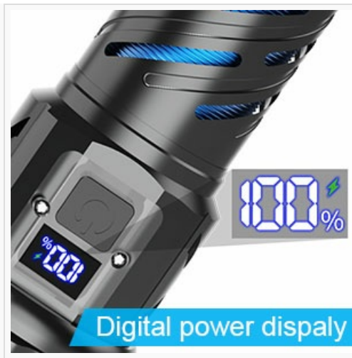
Image: A close-up of the flashlight's body, showing the digital display indicating battery percentage and a charging icon.