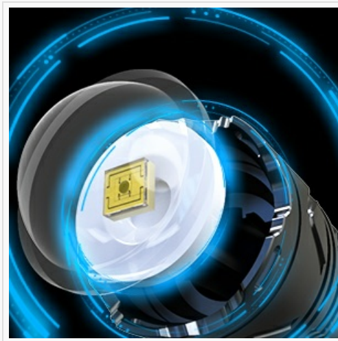
Image: A magnified view of the high-brightness LED chip and focusing lens located within the flashlight head.