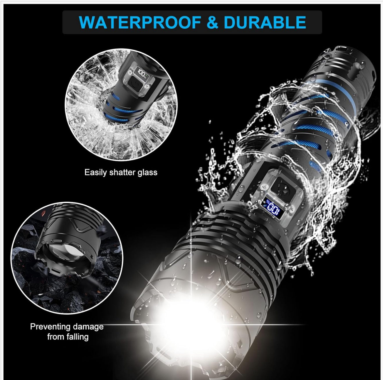
Image: Illustrations showing the Karrong flashlight's durability. One image depicts water splashing over the flashlight, indicating its waterproof nature. Another shows the flashlight on a rocky surface, highlighting its drop-proof design.