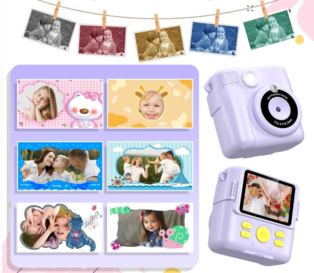
Image: Examples of fun frames and filters available on the camera.