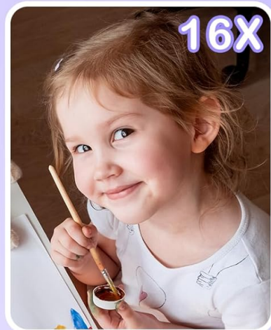
Image: Demonstrating 1080P HD video recording and 16x digital zoom capabilities.