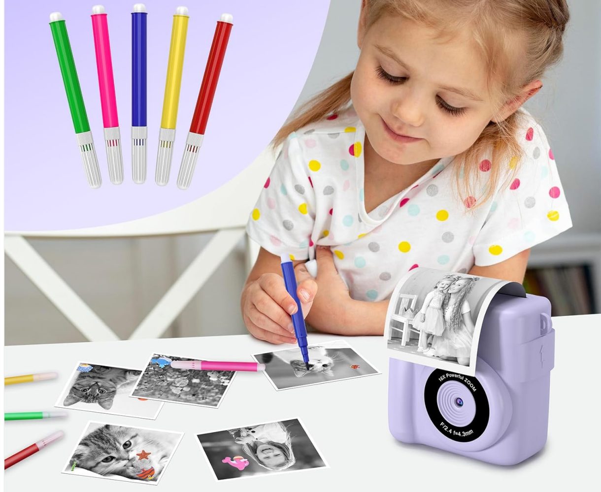
Image: DIY coloring of instant prints using the provided color pencils.

DIY Your Instant Photos (Black & White Photos)