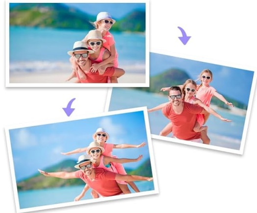
Image: Demonstrating time-lapse and continuous shooting functions.