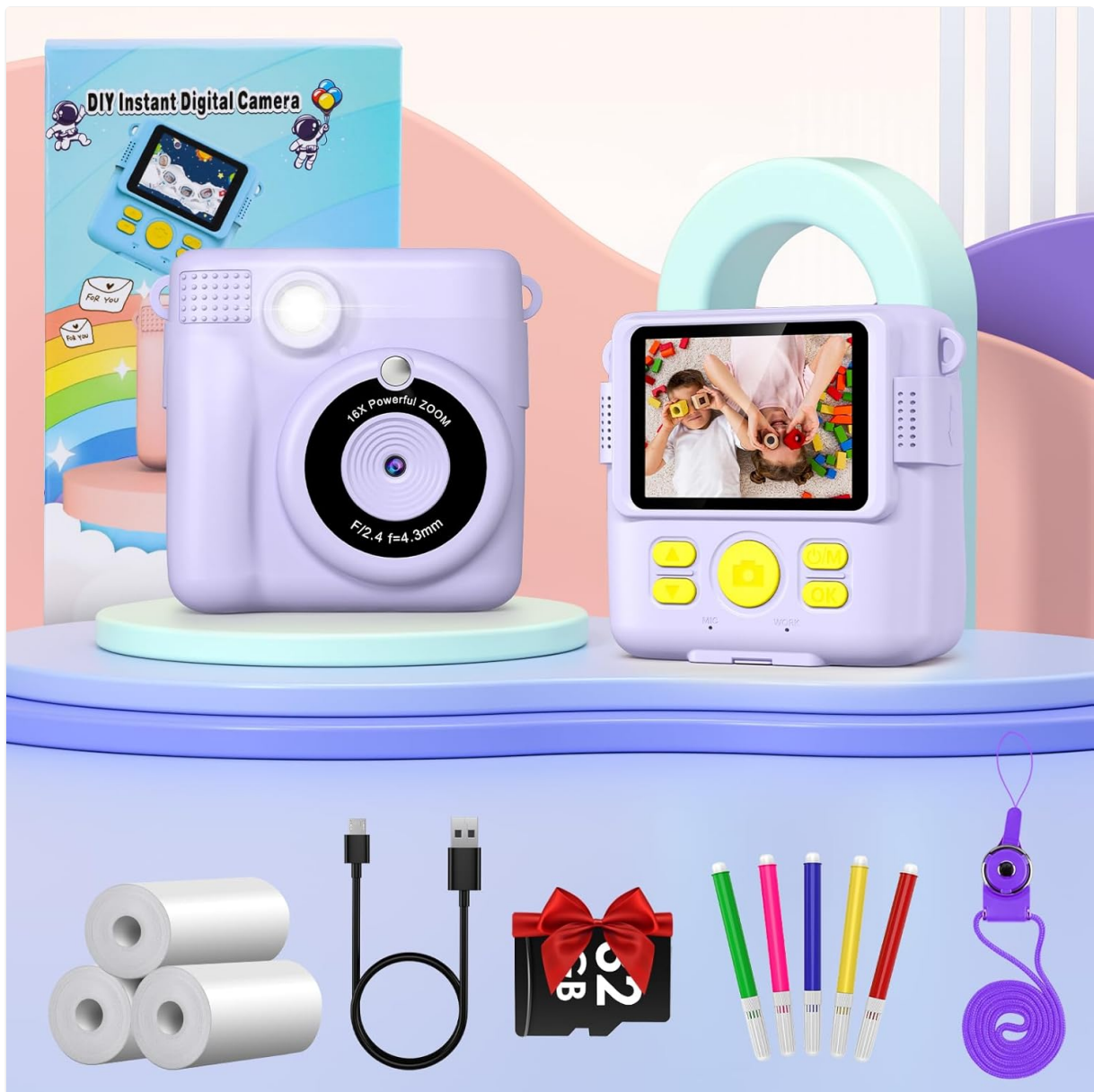
Image: Contents of the Gofunly Instant Kids Camera X6 package.