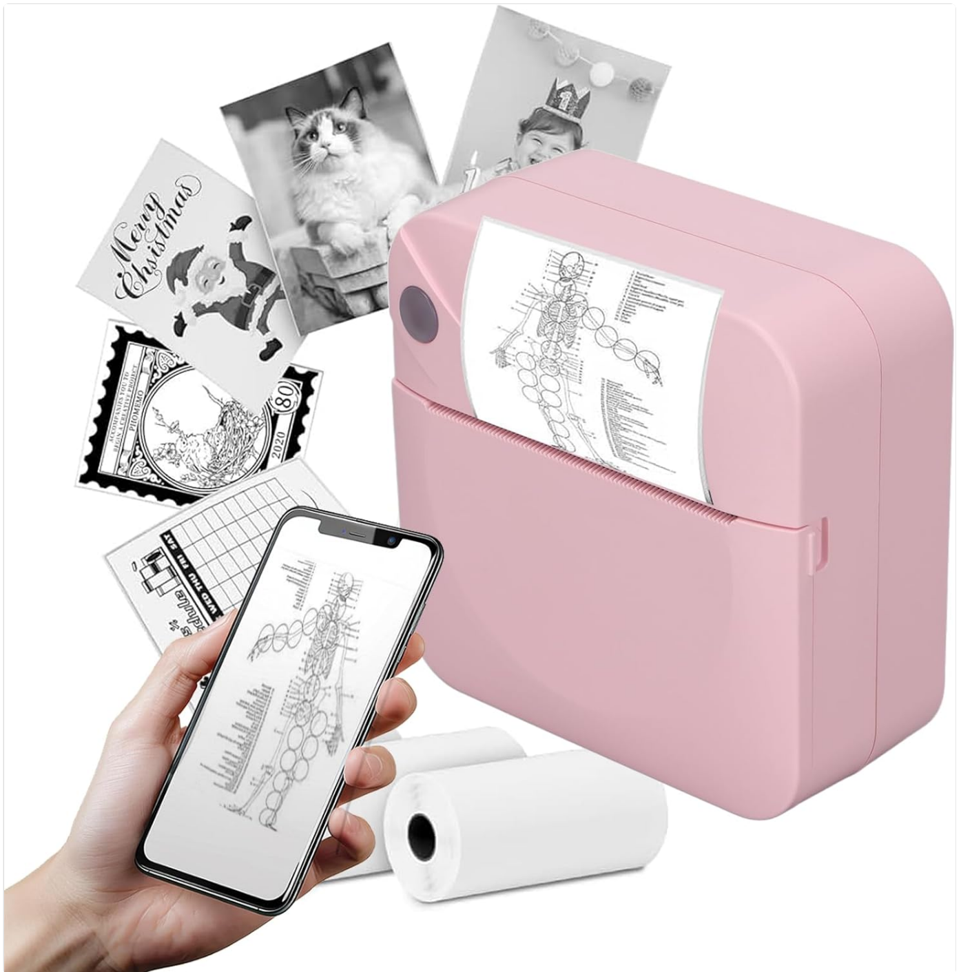
Figure 1: Annadue C17 Mini Portable Thermal Printer in use, showing its compact size and wireless printing capabilities.