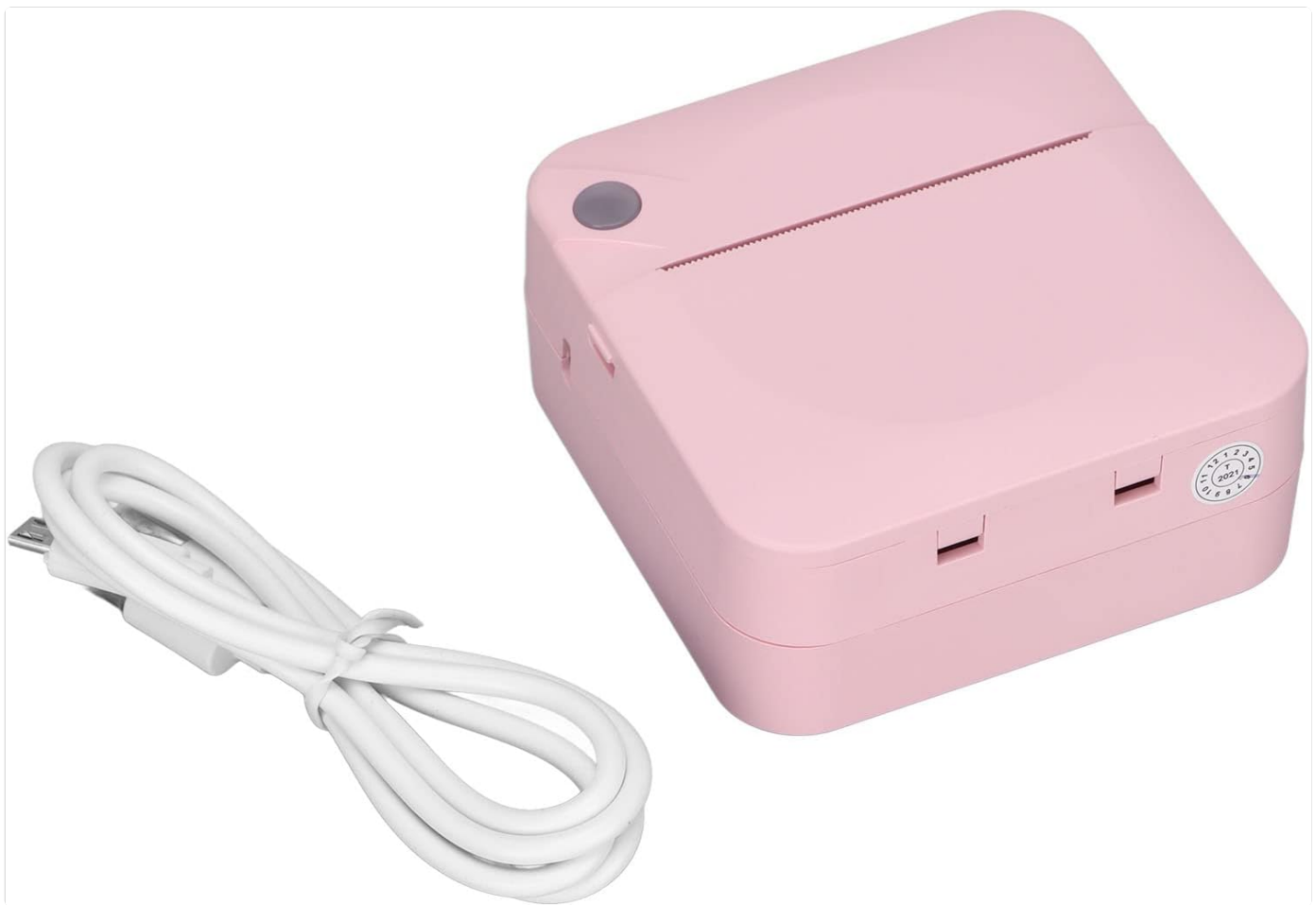
Figure 2: Printer and included USB charging cable.