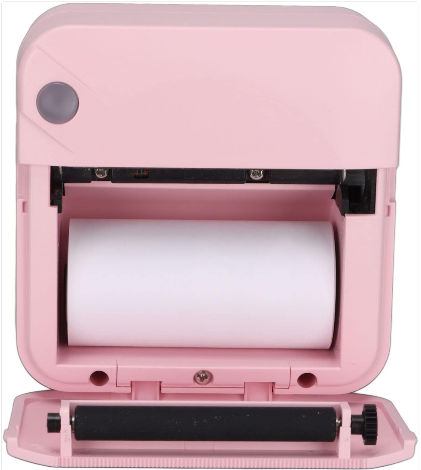
Figure 3: Steps for loading thermal paper into the printer.