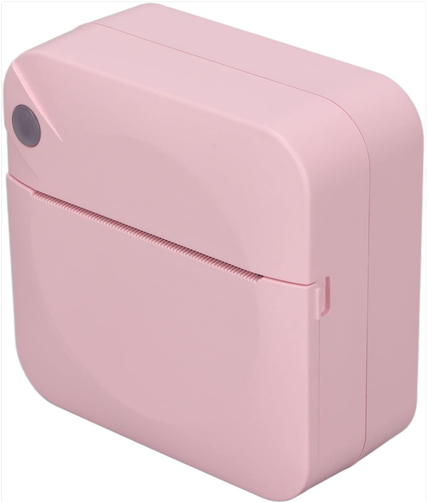
Figure 5: Various views of the Annadue C17 printer.