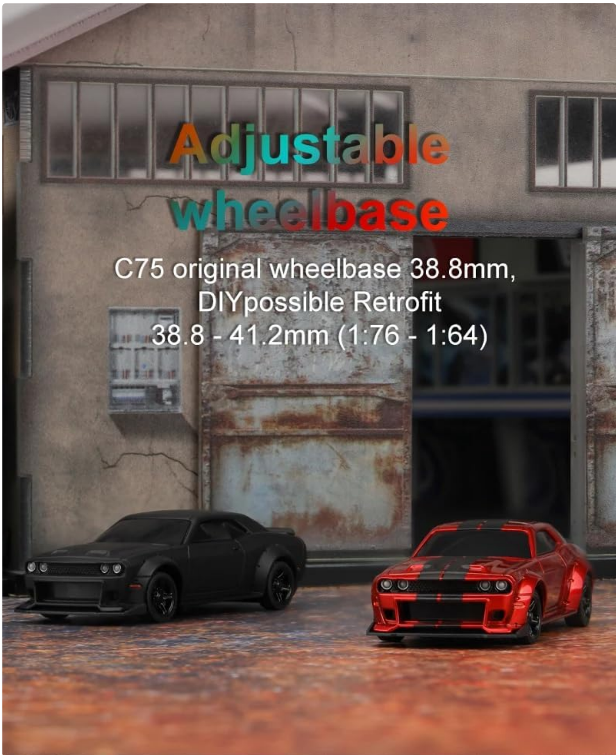
An image illustrating the adjustable wheelbase feature of the C75 RC car, showing two cars with different wheelbase settings.