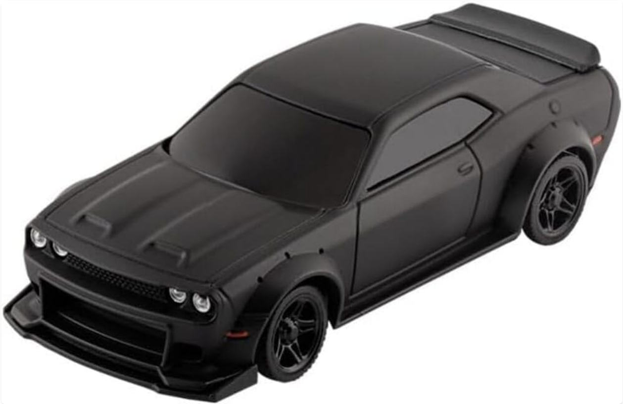
A top-down view of the sleek black CALLPHA Turbo Racing 1:76 Scale Sport RC Car C75.