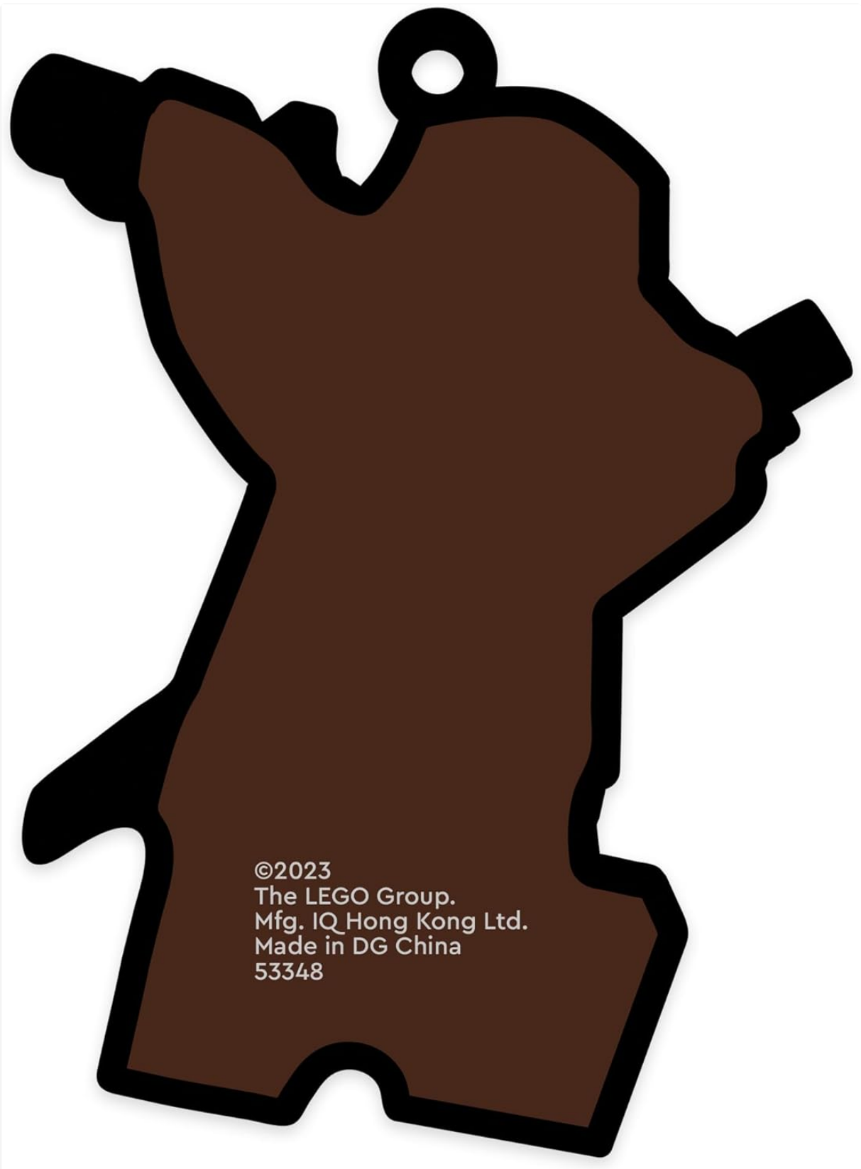
Image: Rear view of the magnet, displaying the embedded magnetic surface and manufacturing details.