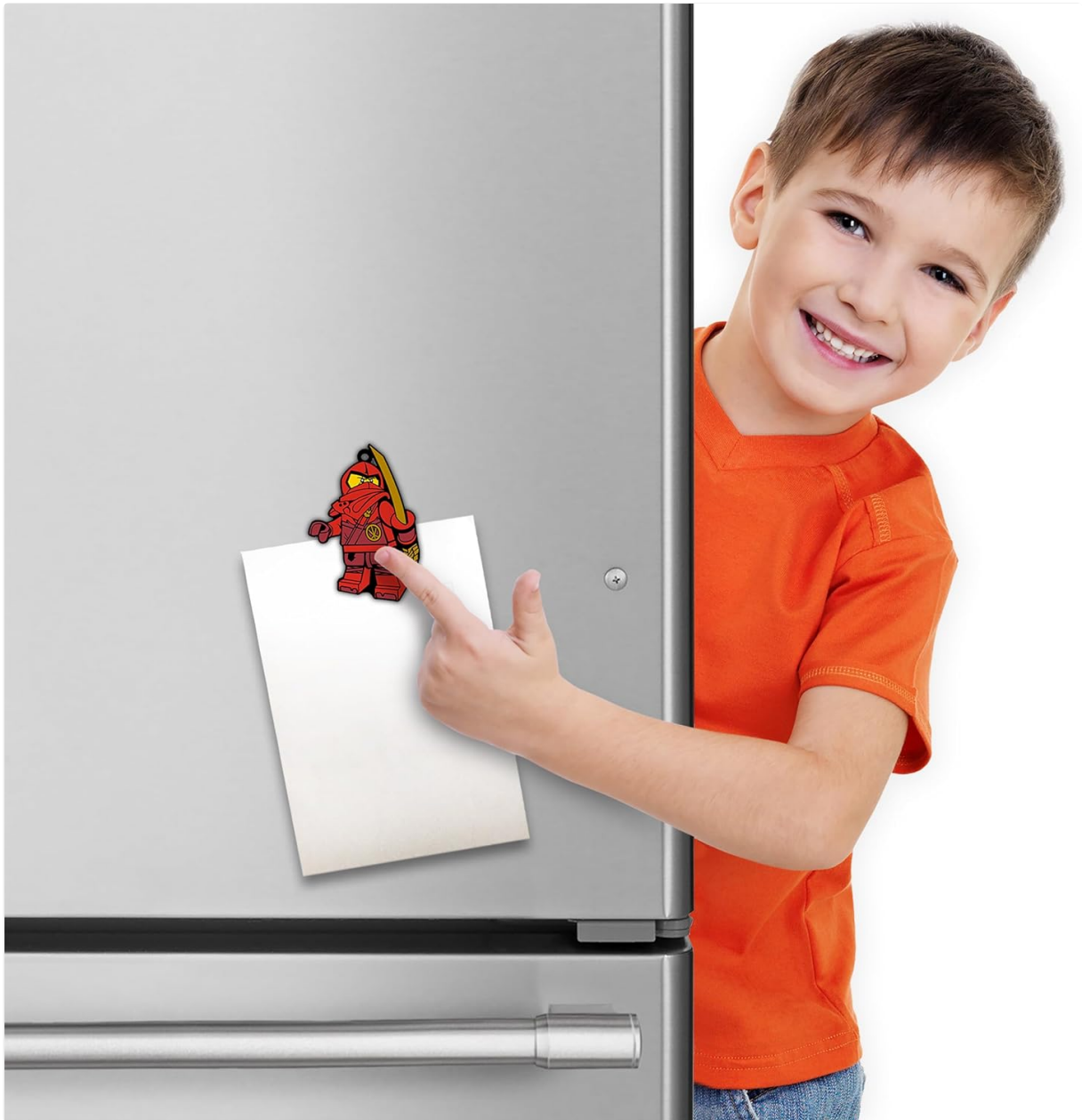
Image: The magnet attached to a refrigerator, demonstrating its intended use for holding notes or as decoration.