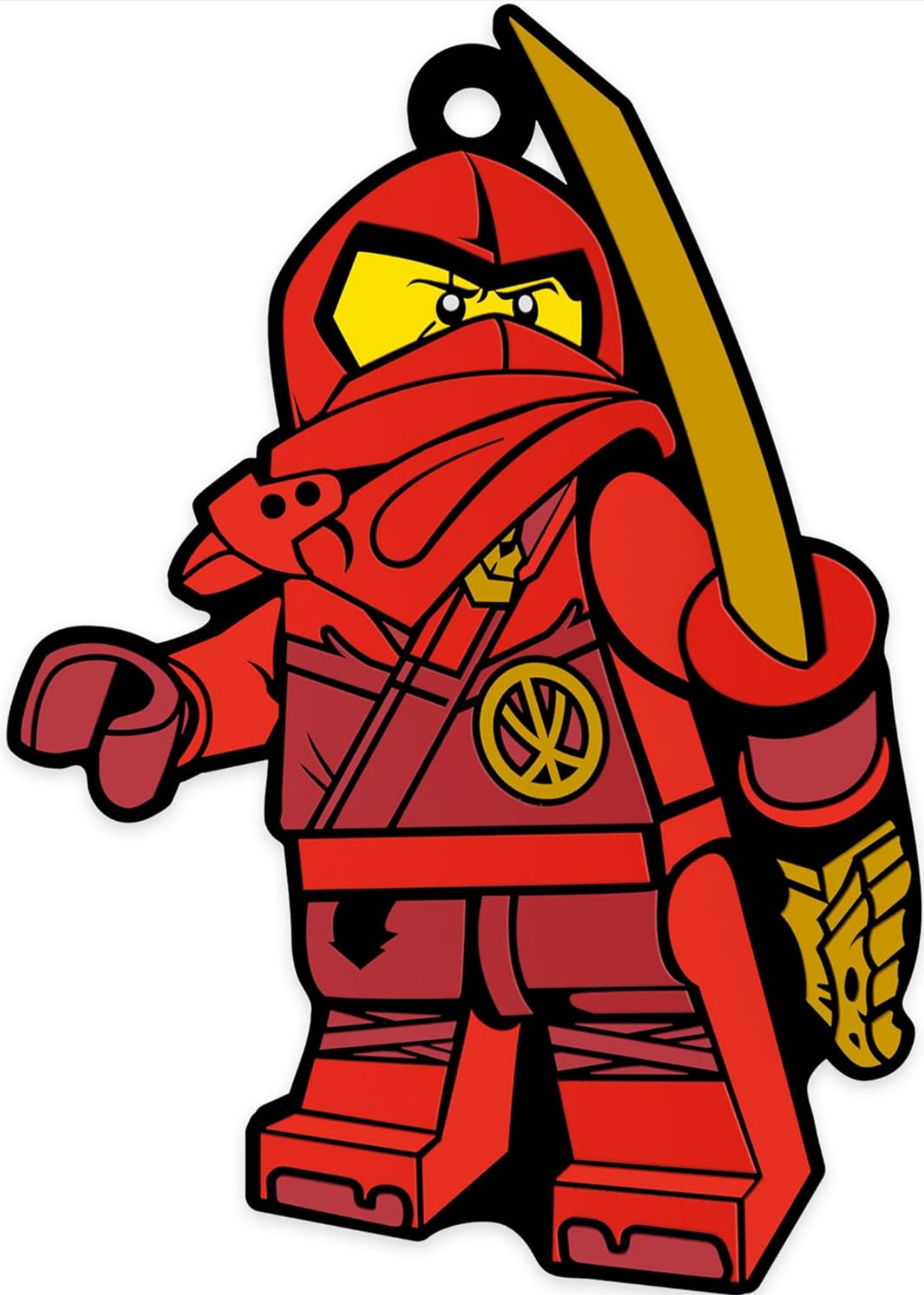
Image: Front view of the IQ LEGO Ninjago Kai magnet, depicting the red ninja character with a golden sword. This magnet is made from flexible silicone.