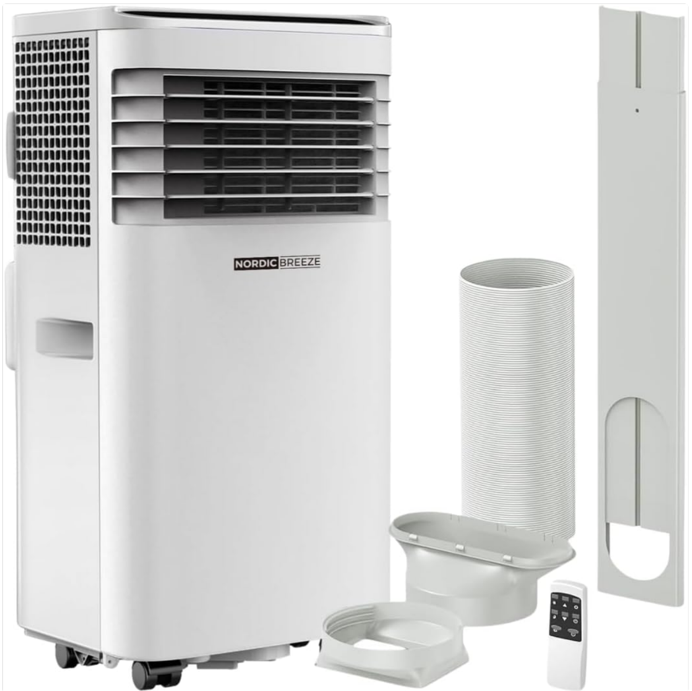
Image: The Nordic Breeze portable air conditioner unit shown with its complete set of accessories, including the exhaust hose, window venting kit, and remote control, ready for setup.