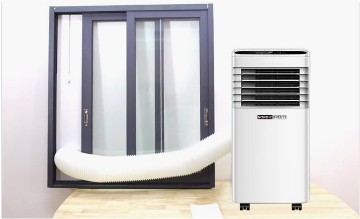
Image: The portable air conditioner unit positioned next to a window, demonstrating the correct installation of the exhaust hose and adjustable window venting kit for efficient operation.

5. Power Connection: Plug the power cord into a grounded 230V/50Hz electrical outlet.