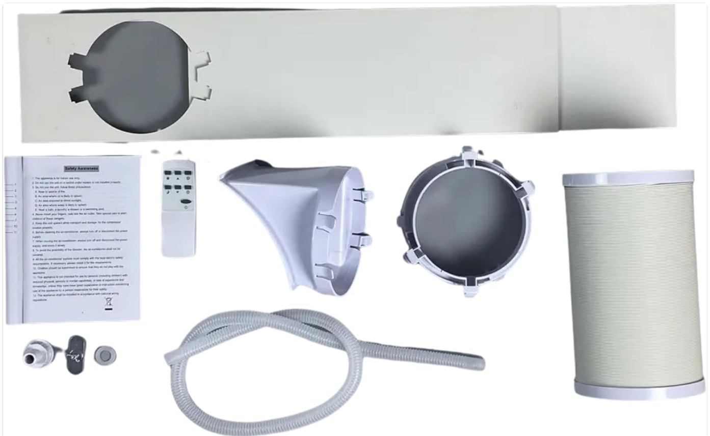
Image: A comprehensive view of all included components: the main air conditioner unit, exhaust hose, window kit pieces, remote control, and the printed user manual.