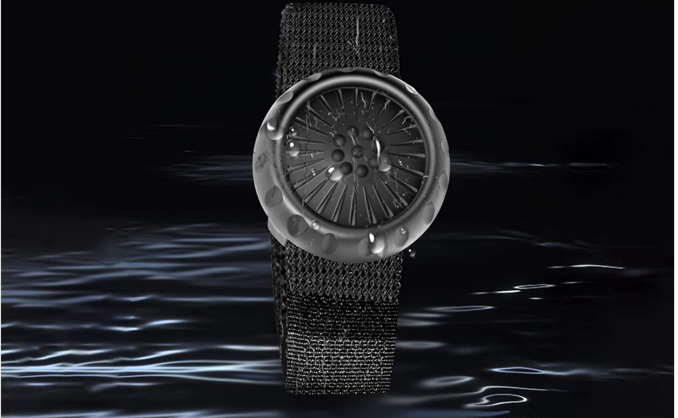
Image: The PTT button in water, illustrating its IP67 waterproof grade for normal outdoor use in rainy conditions.

Waterproof grade: IP67, for normal outdoor use in rainy days