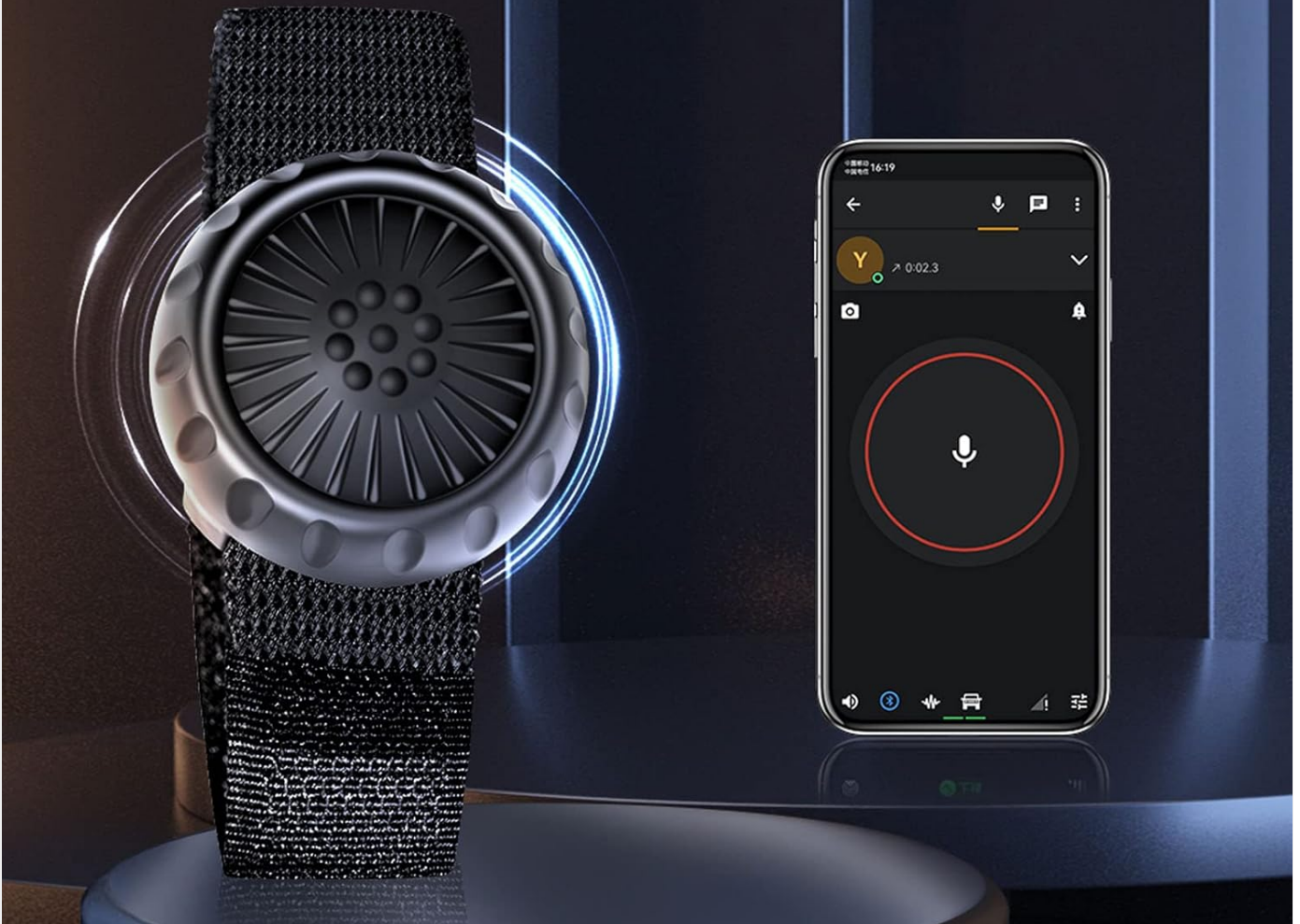
Image: The Zello PTT button, designed to be paired with the Zello application for hidden push-to-talk functionality.