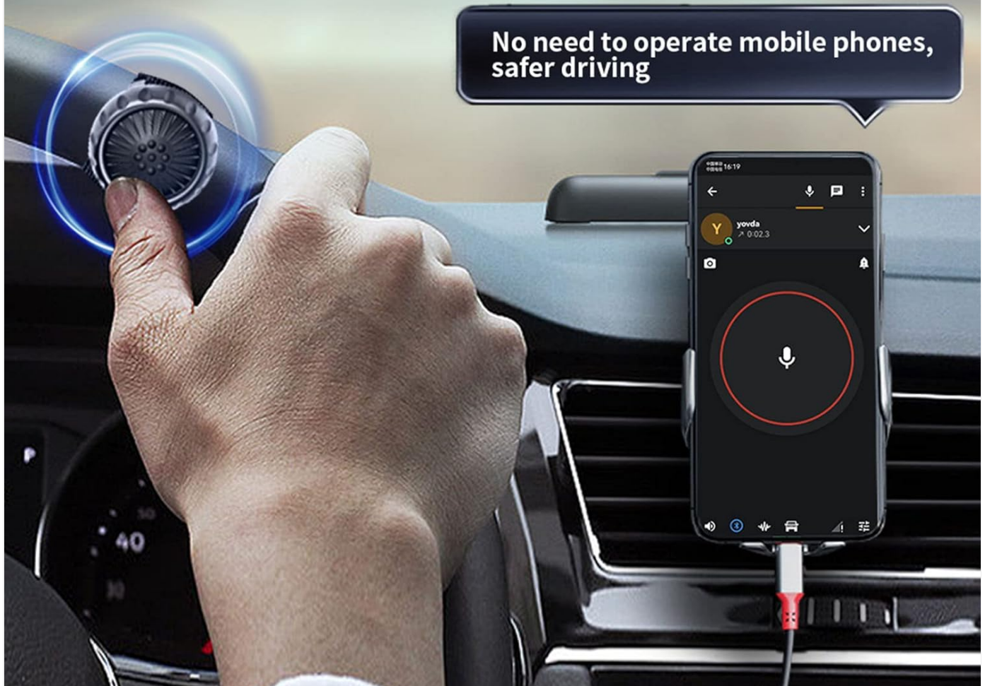
Image: The PTT button mounted on a car dashboard, enabling easy push-to-talk while driving without operating the mobile phone.