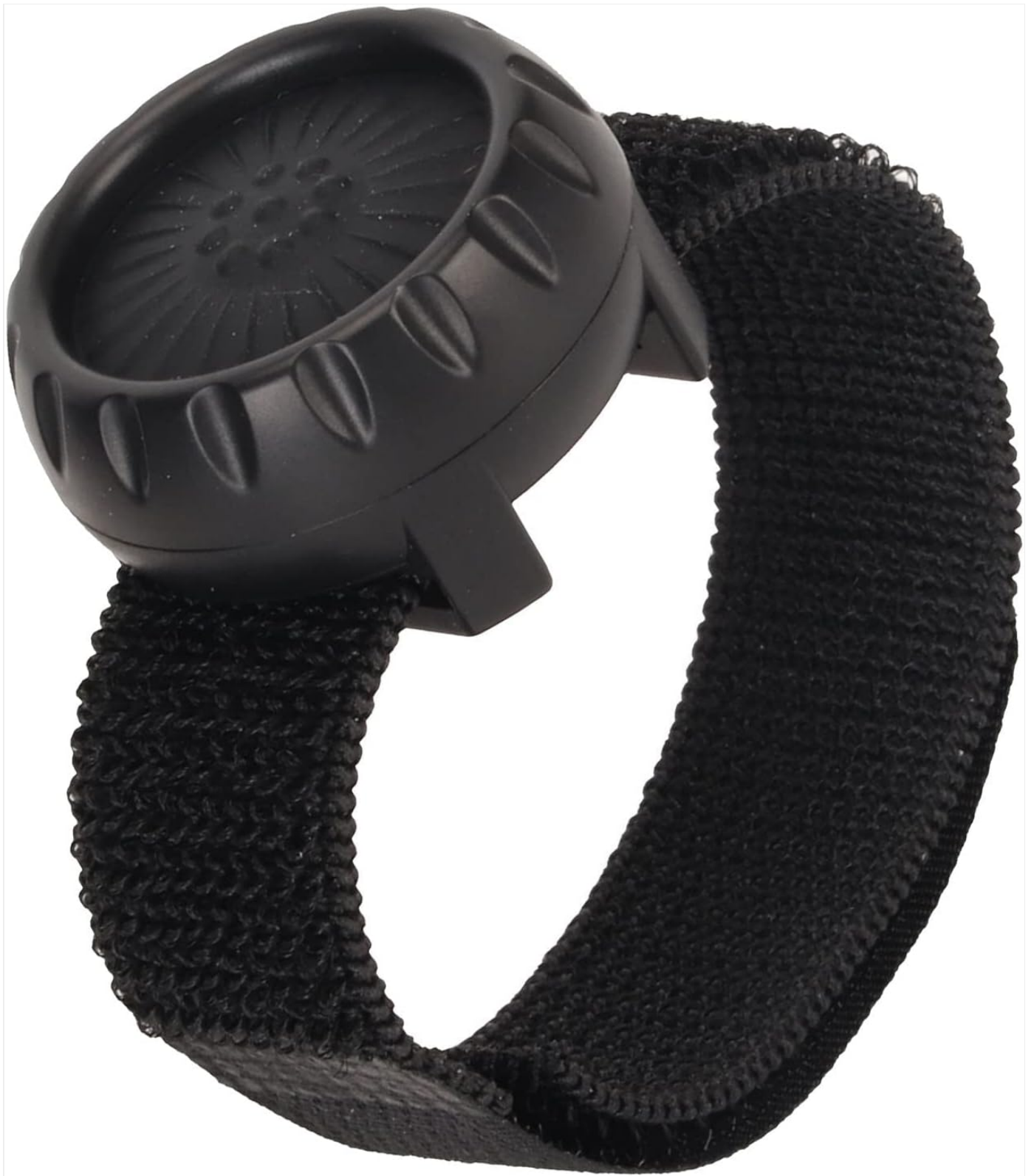
Image: The Dpofirs Zello Wireless PTT Button with its adjustable strap.