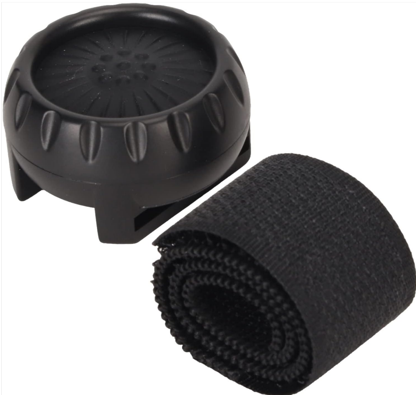
Image: The PTT button unit detached from its strap.