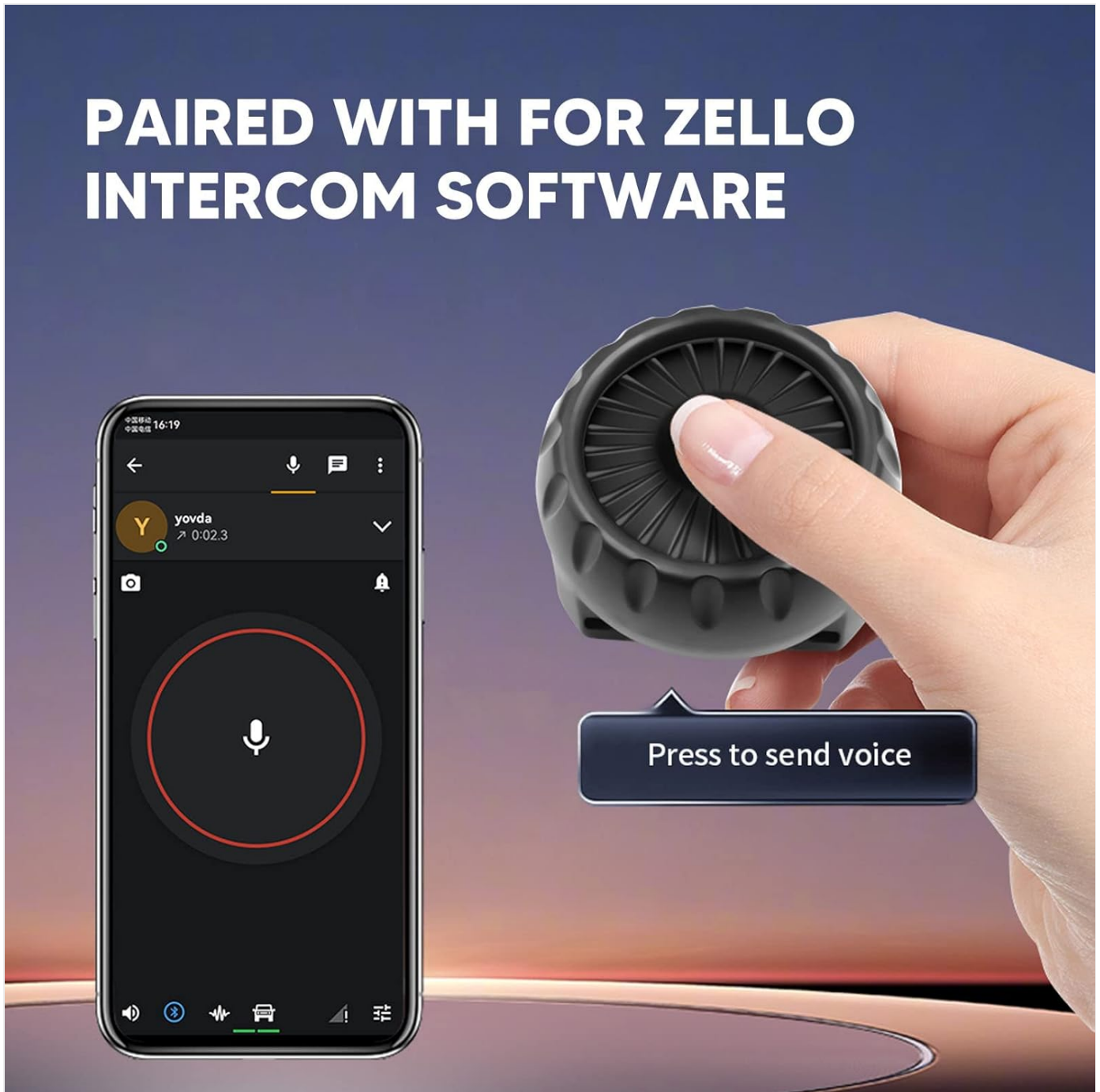
Image: The Zello PTT button being pressed, demonstrating its pairing with the Zello intercom software on a smartphone.