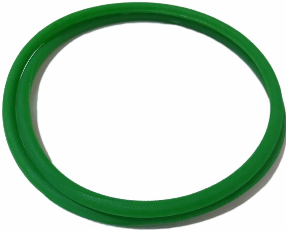
Image 1.1: The SHEJIO seamless green dryer belt, designed for durability and smooth operation.