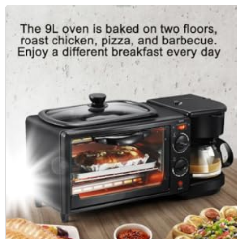
Figure 3: Toaster Oven Control Panel. The top knob controls temperature from 100°C to 230°C. The bottom knob is the timer, with a 'Stay On' position and a power indicator light.

The toaster oven features temperature and timer controls for various cooking needs.