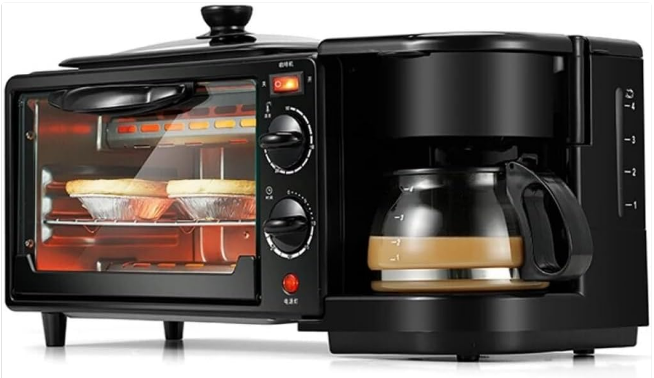
Figure 1: The Sokany 3-in-1 Breakfast Maker, a compact appliance featuring a toaster oven, a top-mounted frying pan, and a coffee maker with a glass carafe.

Thank you for purchasing the Sokany 3-in-1 Breakfast Maker. This versatile appliance is designed to simplify your morning routine by combining a toaster oven, frying pan, and coffee maker into one compact unit. Please read this manual thoroughly before first use to ensure safe operation and optimal performance.