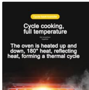
Figure 5: The oven utilizes a cycle heat transfer system, heating from both top and bottom elements to create a thermal cycle for even cooking.