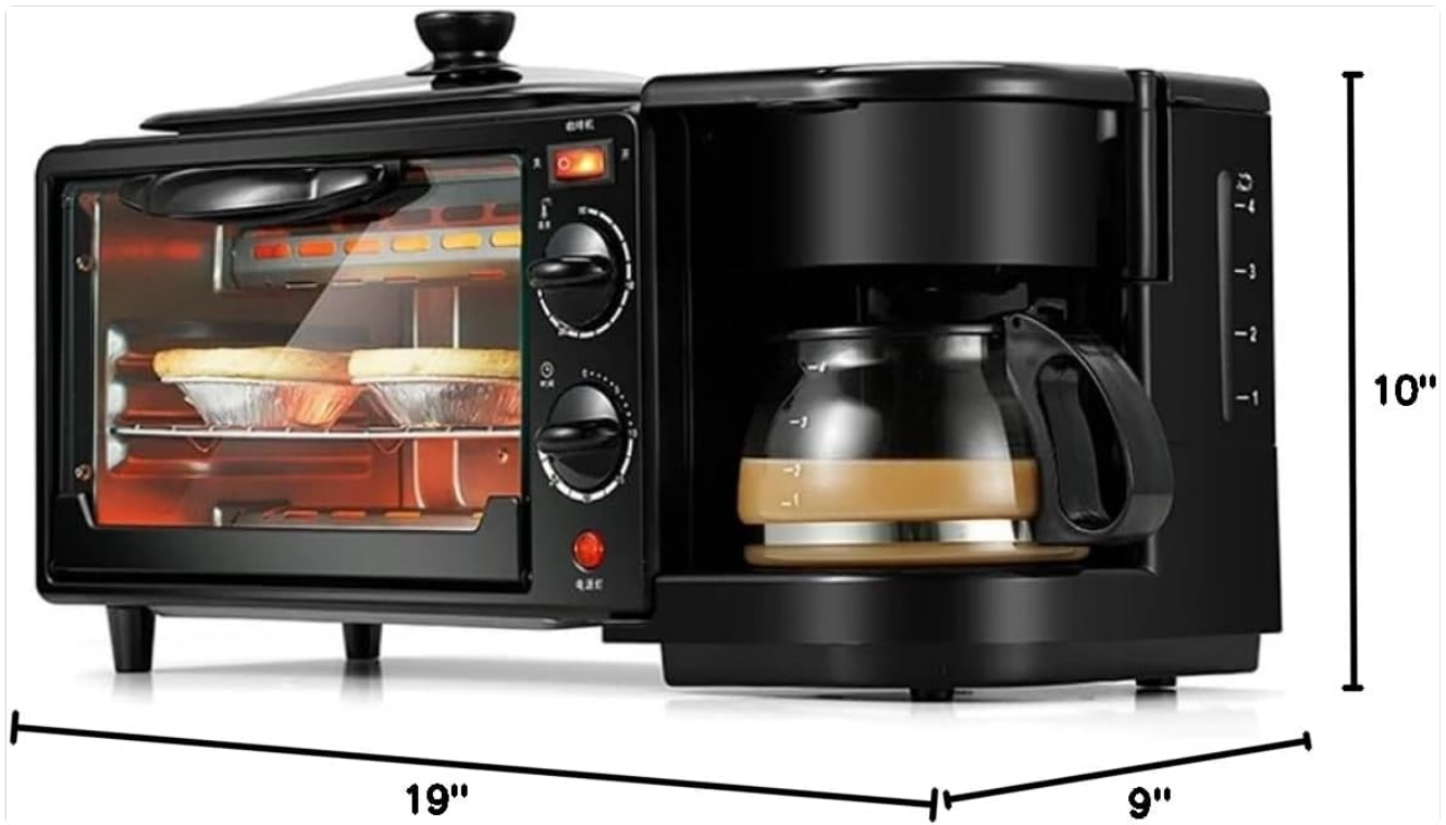
Figure 9: Product dimensions for the Sokany 3-in-1 Breakfast Maker.