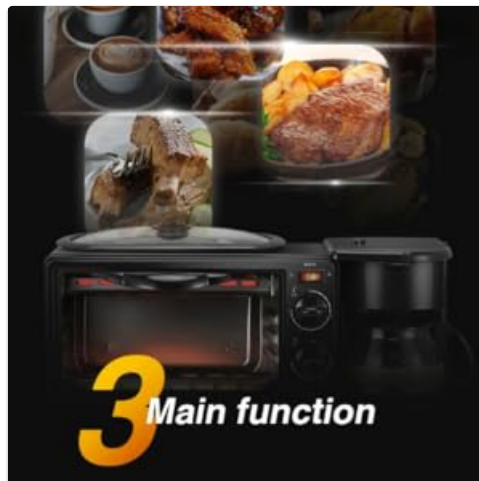
Figure 8: Coffee Maker Components. Includes a water tank, a removable coffee filter, and a 400ml glass carafe.

The coffee maker brews up to 4 cups of coffee.