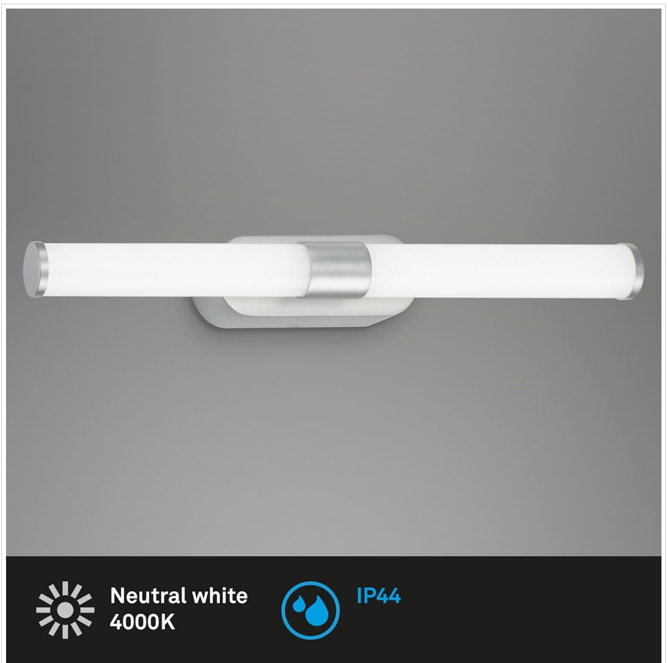
Image 2: Key features highlighting 4000K neutral white light and IP44 splash protection.