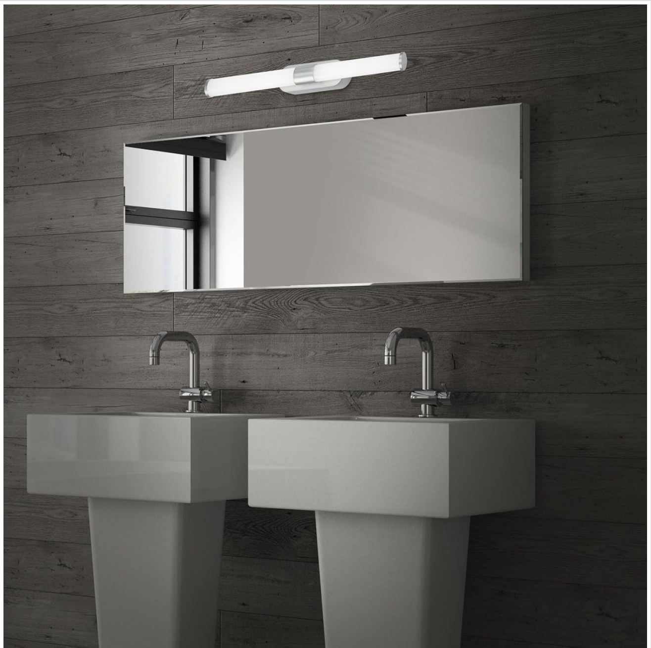
Image 6: Example installation with one light mounted horizontally above a mirror.