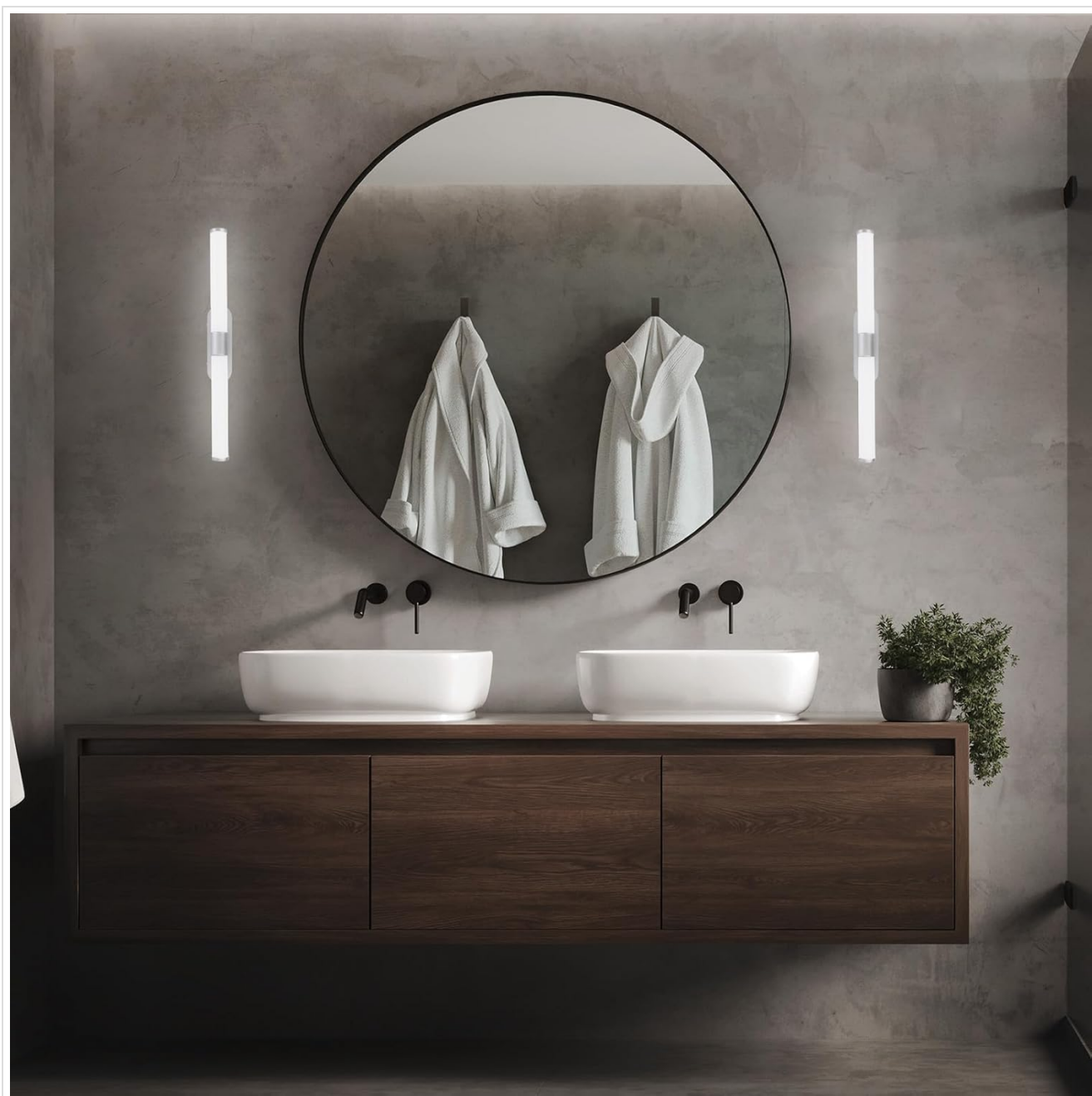
Image 5: Example installation with two lights mounted vertically beside a mirror.