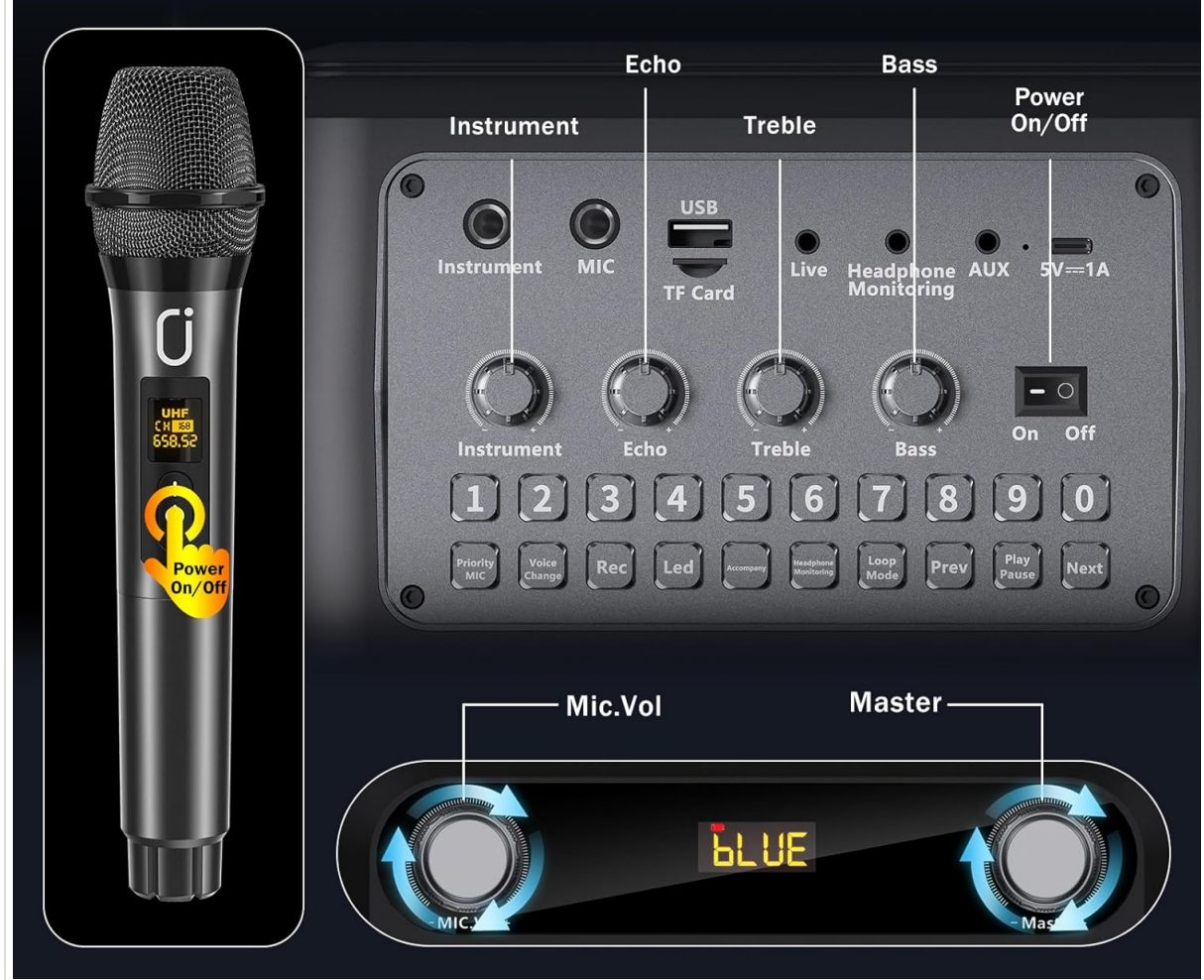
Figure 4: Control panel layout.