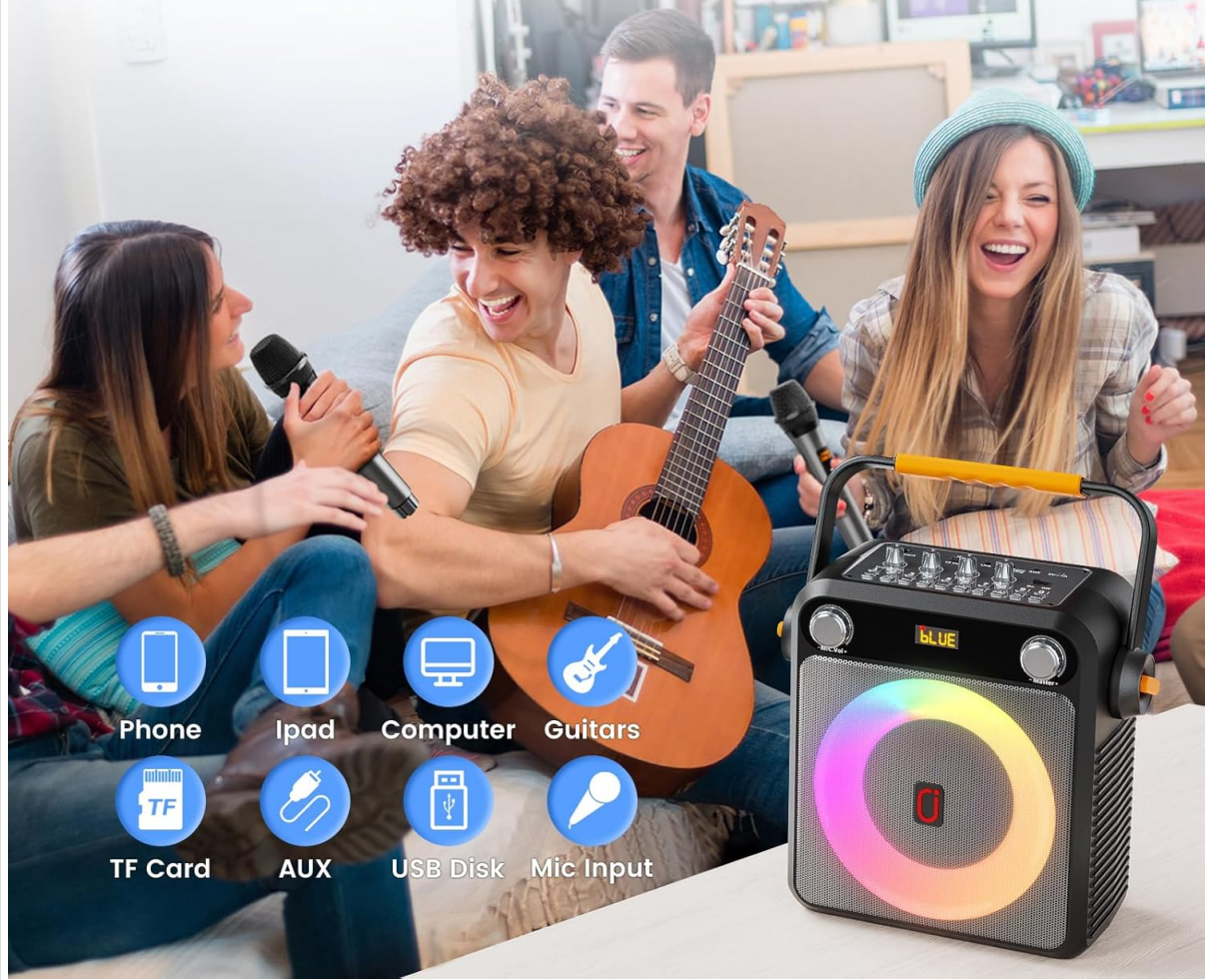
Figure 1: Included components of the JAUYXIAN T23-T Karaoke Machine.