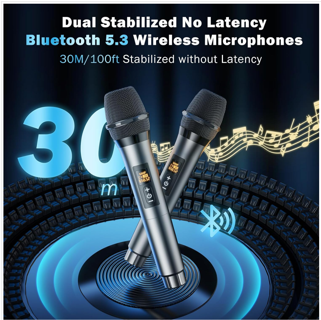
Figure 5: Wireless microphones.