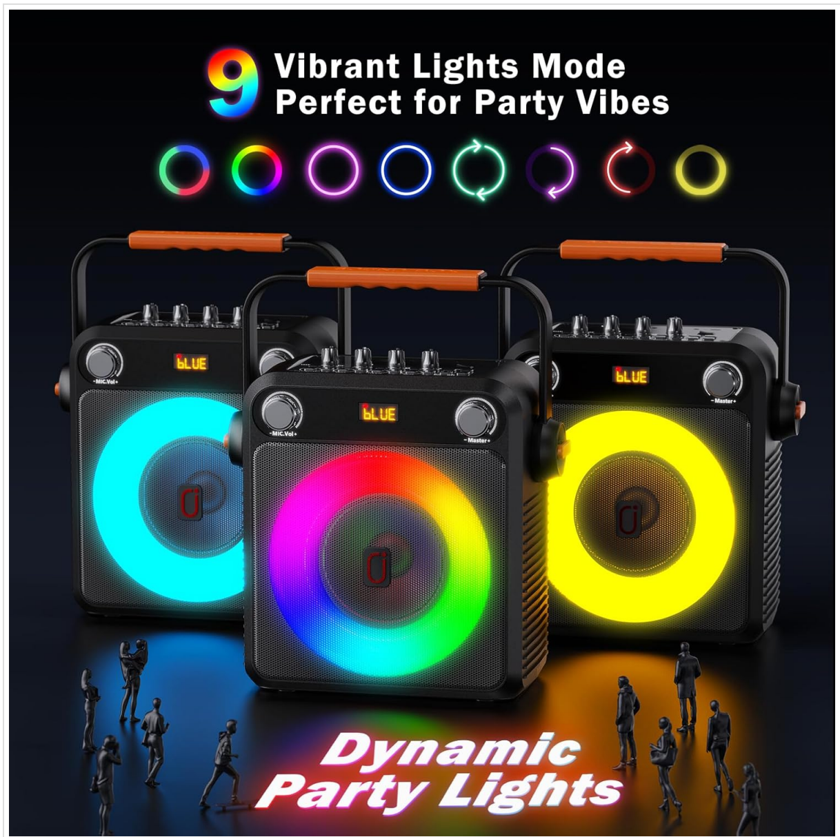
Figure 6: Dynamic LED light modes.