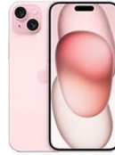
iPhone 12/13/14/15 Series