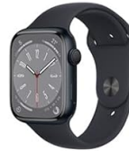
Apple Watch Series2 - 8 /Ultra /SE