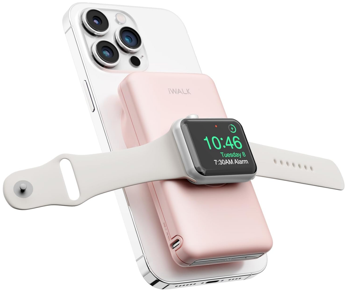
The iWALK MAG-X Magnetic Wireless Power Bank securely attached to an iPhone, with an Apple Watch positioned on its dedicated charging pad.