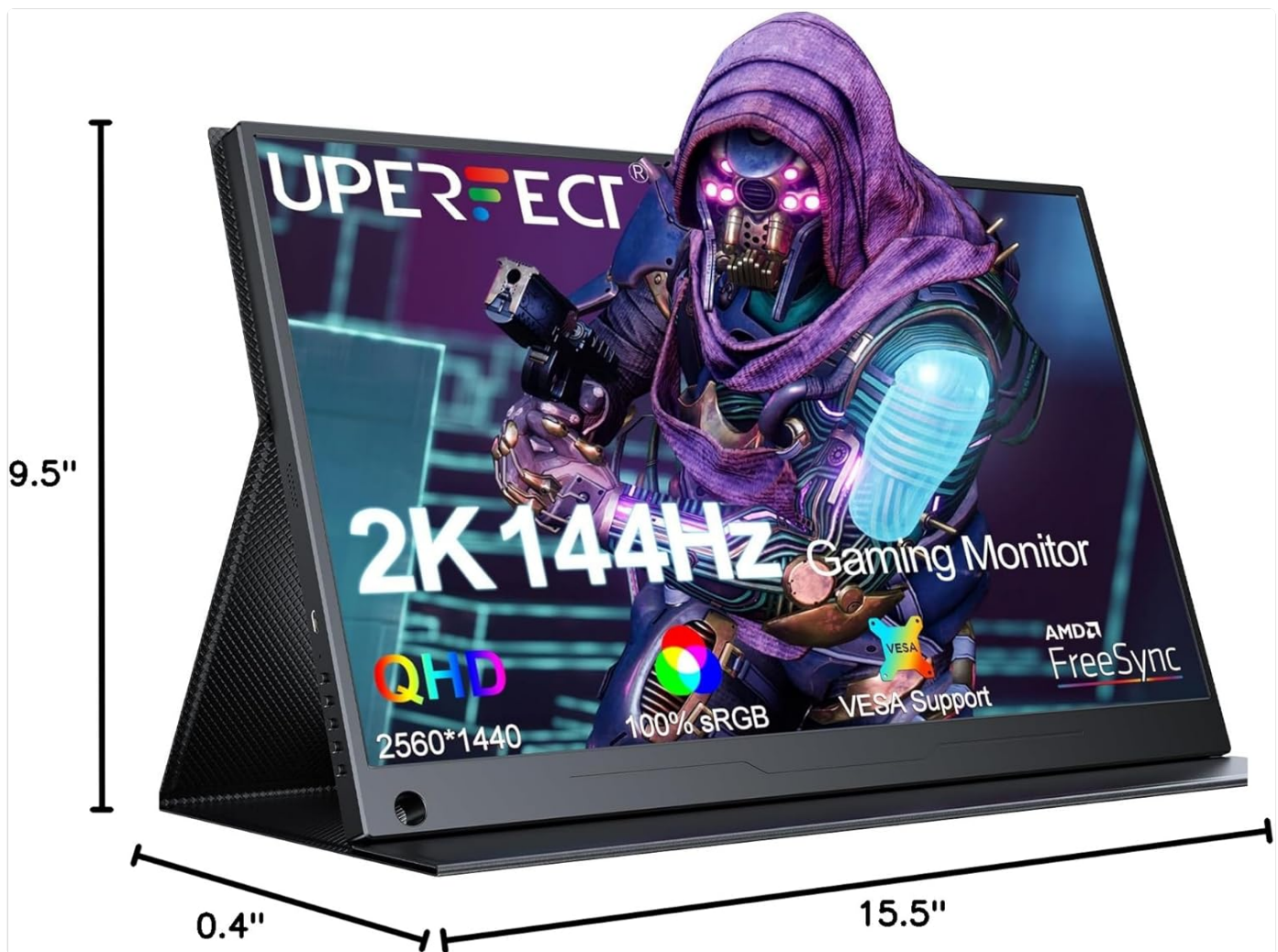
Figure 3.2.3: Monitor dimensions.

This image displays the physical dimensions of the portable monitor, indicating its slim profile and compact size for easy portability.