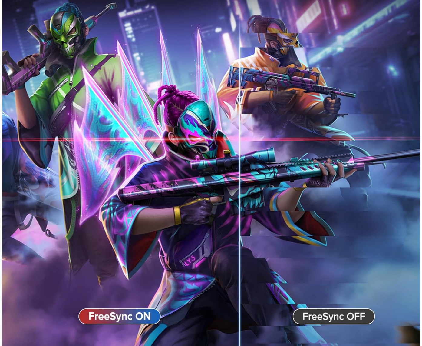
Figure 3.1.4: FreeSync in action, eliminating screen tearing.

Delivers smoother, more fluid motion & enhances overall visual performance