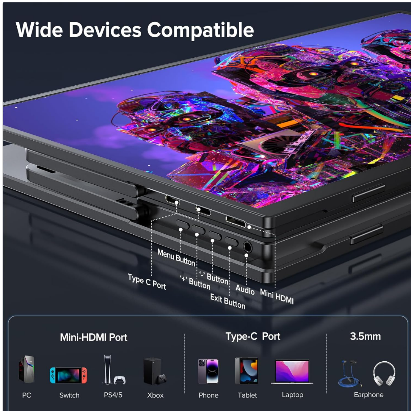
Figure 3.2.2: Connectivity ports overview.

This image provides a detailed view of the monitor's input/output ports, including two Type-C ports, one Mini HDMI port, and a 3.5mm audio jack, highlighting its broad device compatibility.