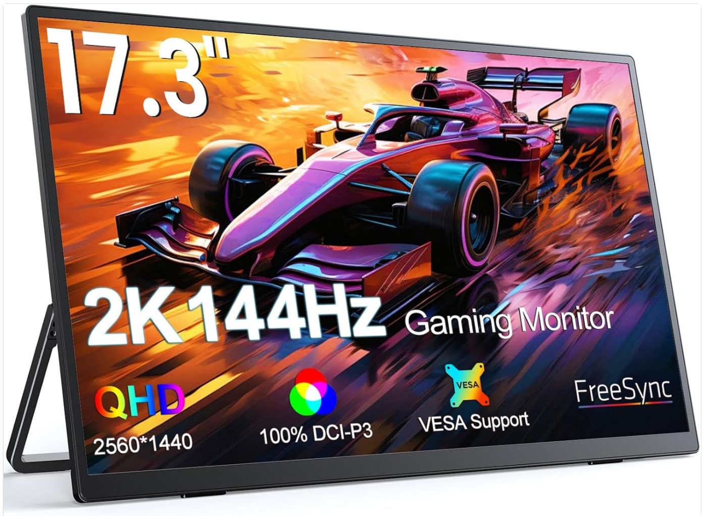
Figure 2.1: UPERFECT 17.3-inch 2K 144Hz Portable Monitor and included accessories.

This image displays the portable monitor along with its essential accessories, including the smart cover, various connection cables, and the power adapter, all neatly arranged.