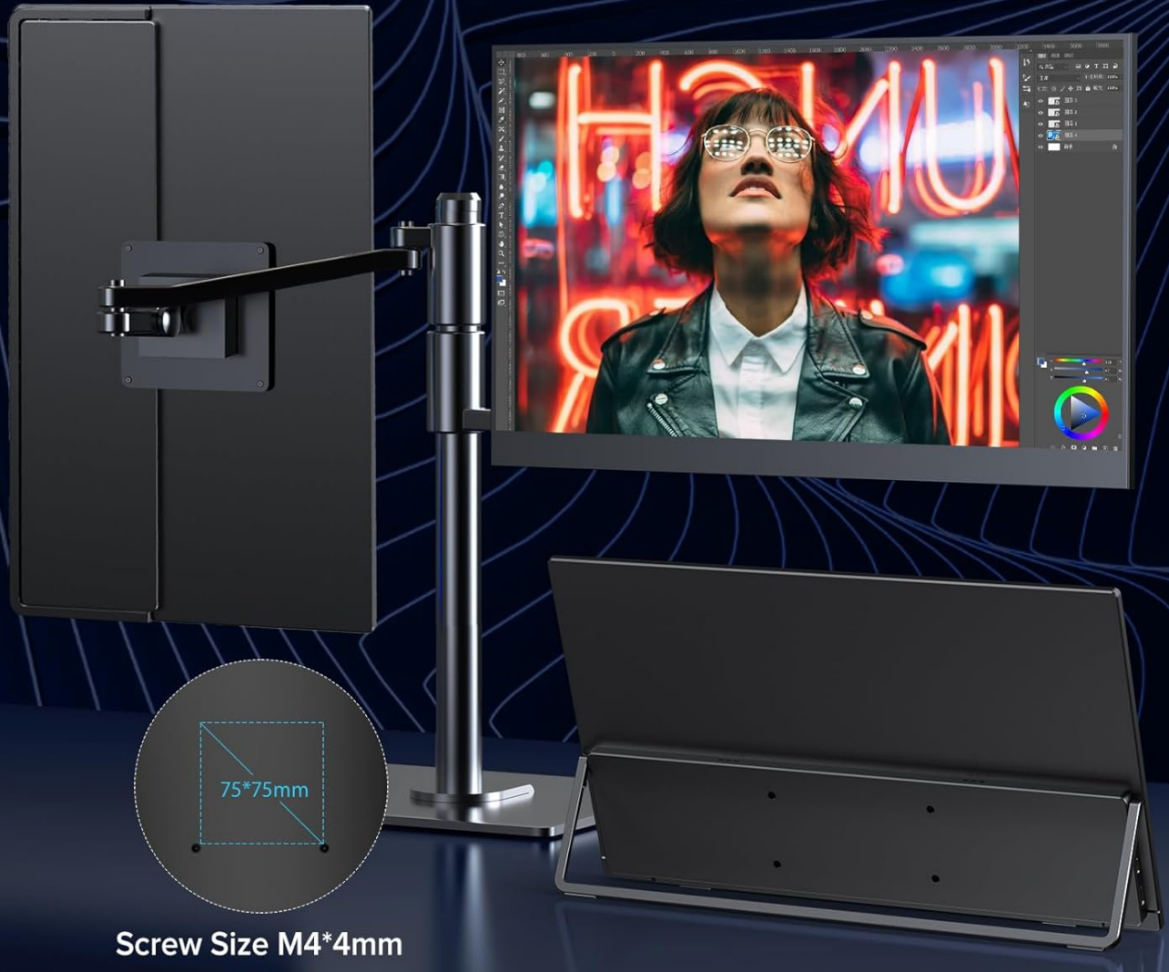
Figure 3.2.1: VESA compatibility and adjustable kickstand.

VESA M4*4mm for desk or wall mount and landscape or portrait mode