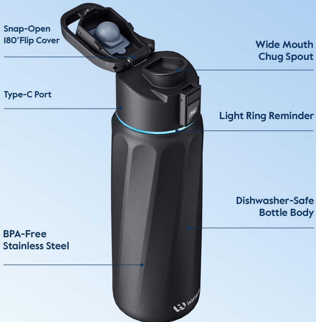
Image: A breakdown of the WATERH BOOST Smart Water Bottle's practical design features.