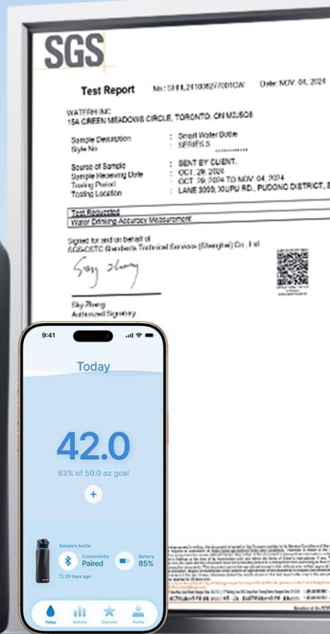
Image: Instructions for optimizing hydration tracking, including proper drinking angles and refill procedures, with SGS certification details. For the full SGS report, visit SGS Online .