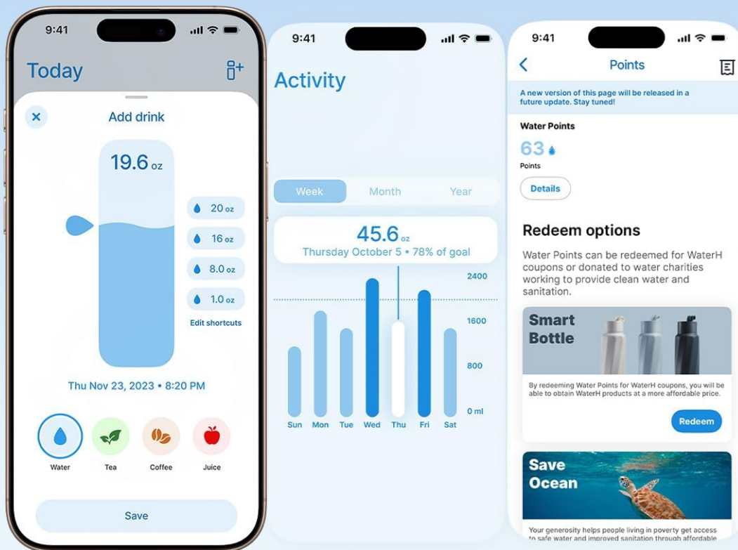
Image: The WATERH app's interface, illustrating features for recording, analyzing, and rewarding hydration habits.