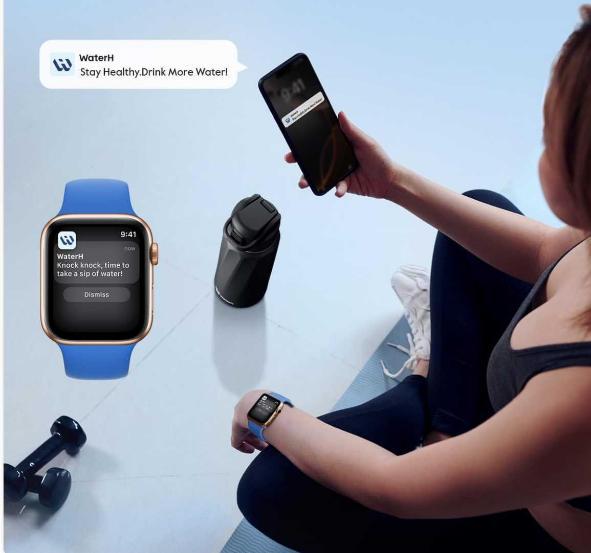
Image: Personalized hydration reminders displayed on a smartphone and smartwatch, integrated with the WATERH BOOST Smart Water Bottle.

Avoid Dehydration Based on Your Habits & Needs