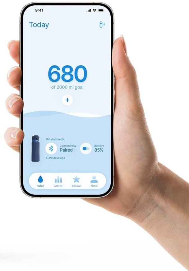
Image: The WATERH BOOST Smart Water Bottle alongside a smartphone displaying the hydration tracking app interface.