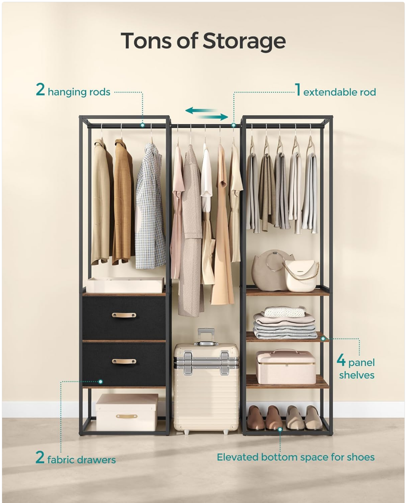
Image 5.1: An overview of the clothes rack demonstrating the use of hanging rods, panel shelves, and fabric drawers for comprehensive storage.