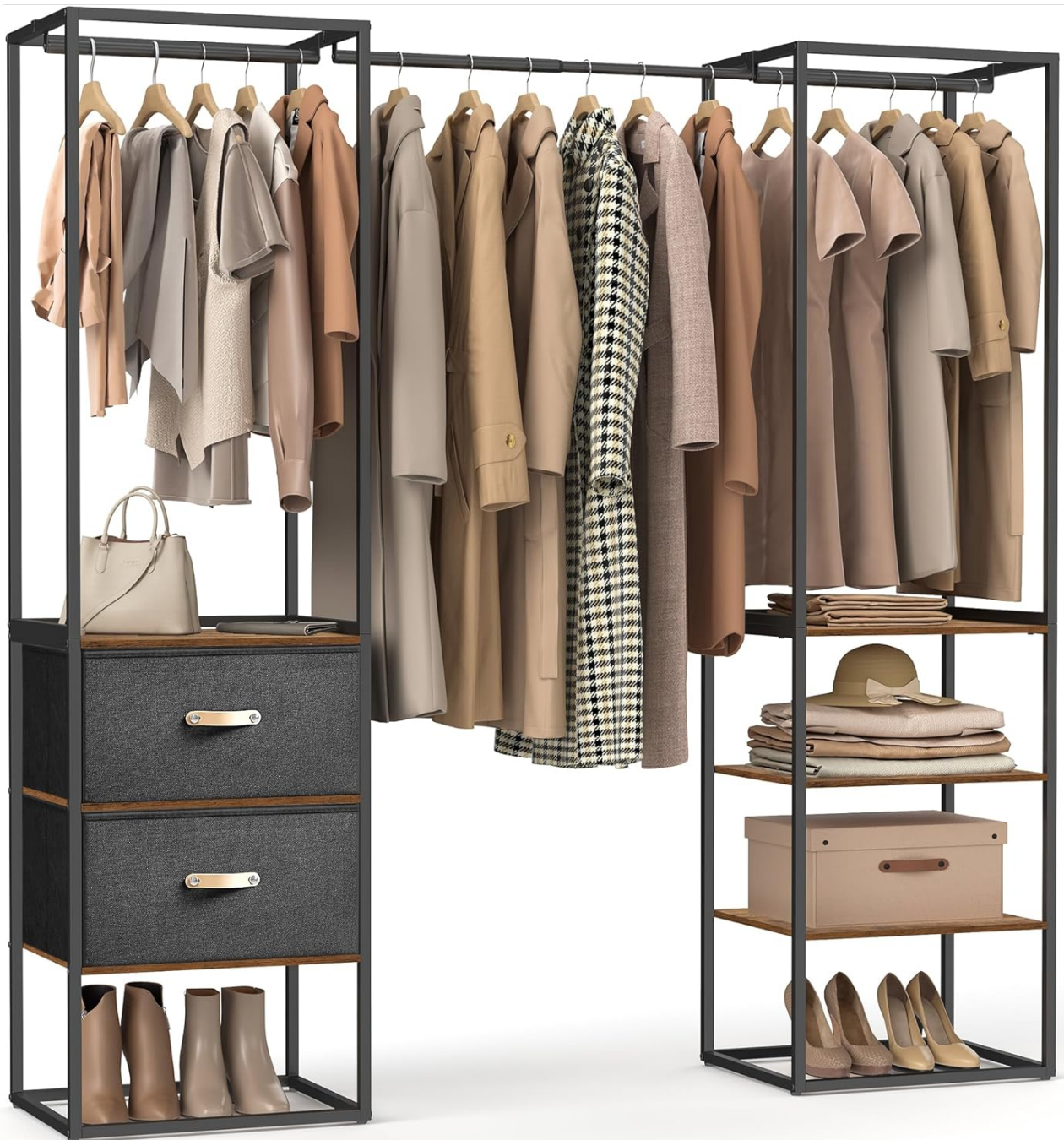
Image 1.1: The SONGMICS URGR003B01 Clothes Rack, showcasing its full assembly with various garments and storage items.