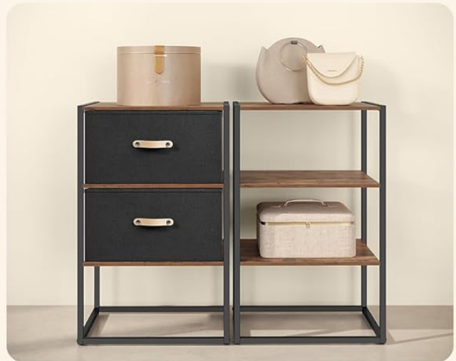
Storage cabinet + shelving unit

Image 5.4: An illustration of the customizable design, showing how the individual units can be configured in various ways.