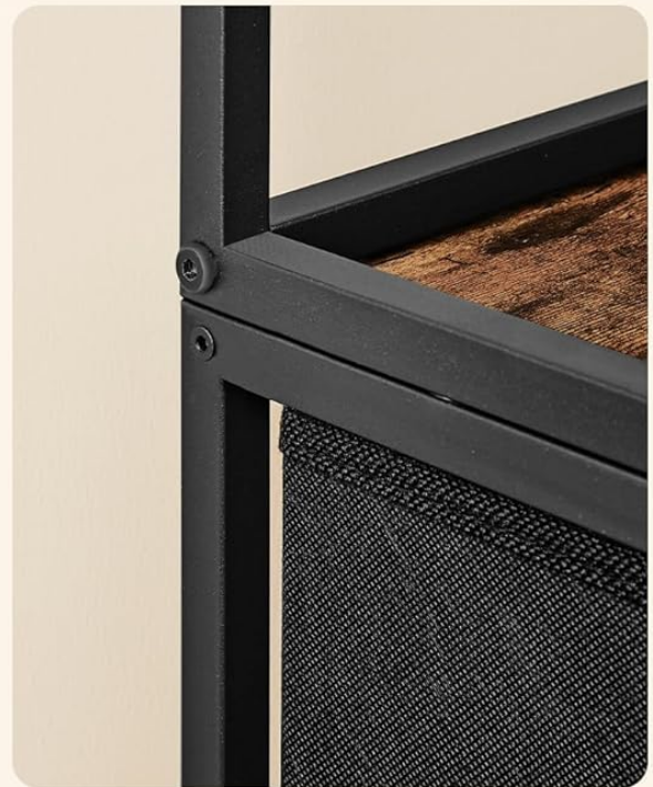
Quality MDF Panels and Metal Frame