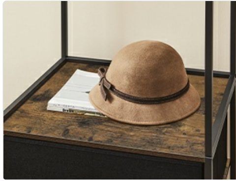
Image 5.2: Detail of a top shelf, illustrating its use for accessories like hats.