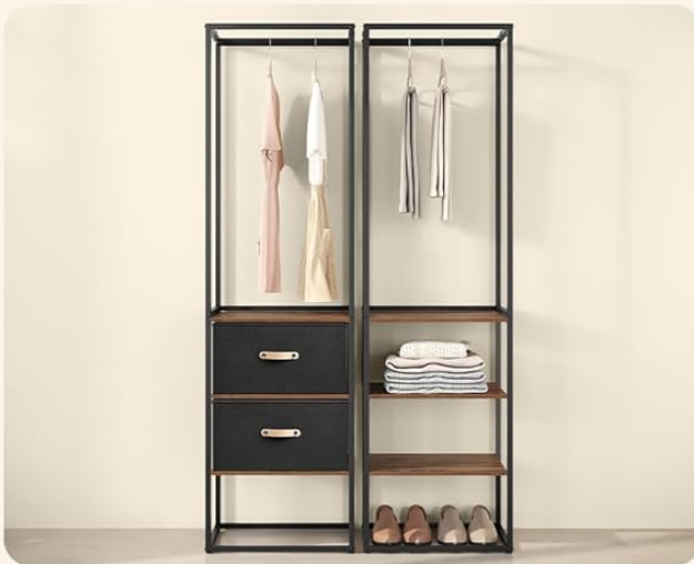
2 open wardrobes