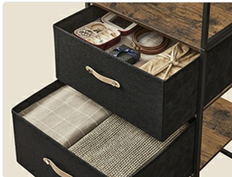
Image 5.3: A close-up of the fabric drawers, demonstrating their capacity for organizing smaller items.