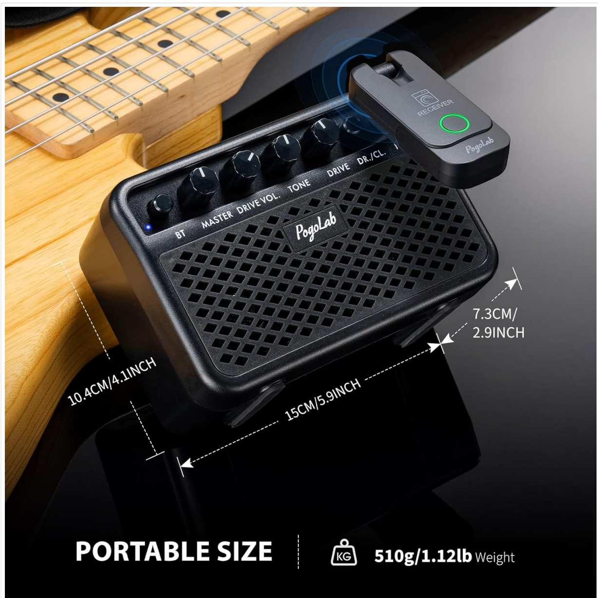
Image: POGOLAB Mini Guitar Amp highlighting its compact and portable dimensions.