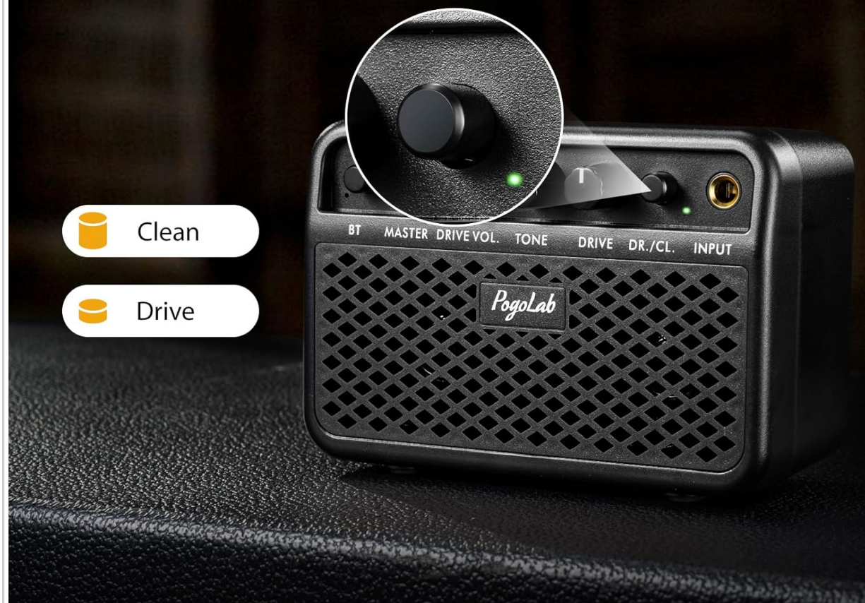
Image: POGOLAB Mini Guitar Amp with indicators for Clean and Drive channels.

The amplifier features two distinct sound channels: