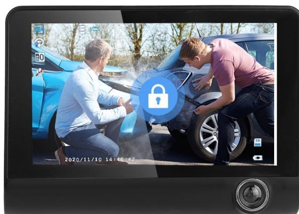
Image: A visual explanation of the G-Sensor's function, depicting a collision scenario where the dash cam automatically locks the footage to preserve evidence.

When a collision is detected by G-sensor, videos will be locked & won't be overwritten. Prevent disputes and provide you with witness evidence.