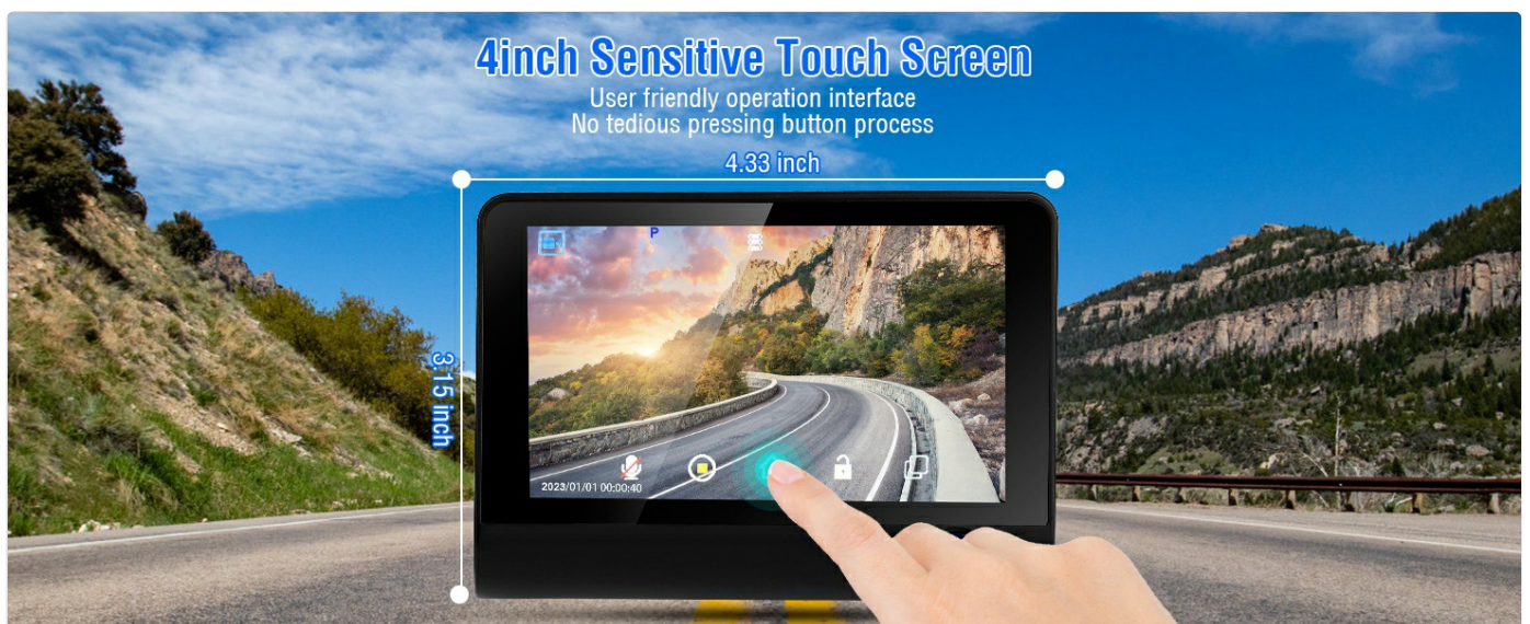
Image: A detailed view of the dash cam's 4-inch sensitive touch screen, emphasizing its ease of use and compact dimensions (4.33 inches wide, 3.15 inches high).