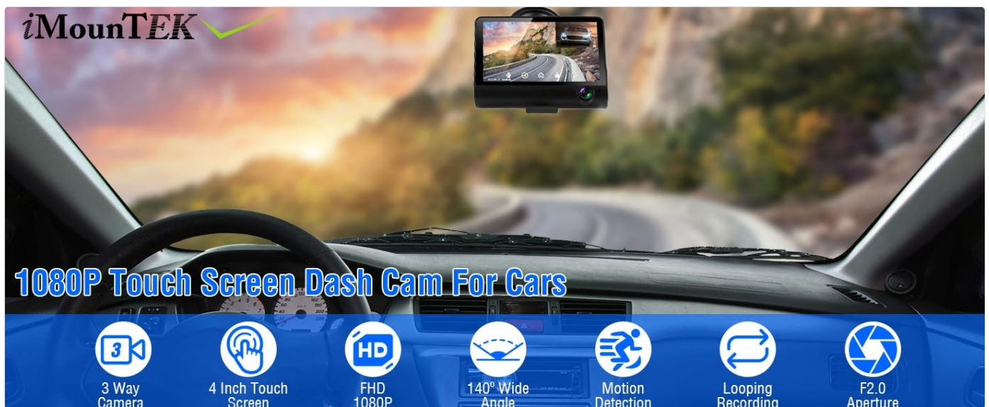
Image: The iMountek Dash Cam installed on a car's windshield, capturing the road ahead, demonstrating its primary function as a driving recorder.

This user manual provides detailed instructions for the installation, operation, and maintenance of your iMountek 4-inch Touch Screen 3 Channels Dash Cam Camera. Please read this manual thoroughly before using the product to ensure proper functionality and safety. Keep this manual for future reference.