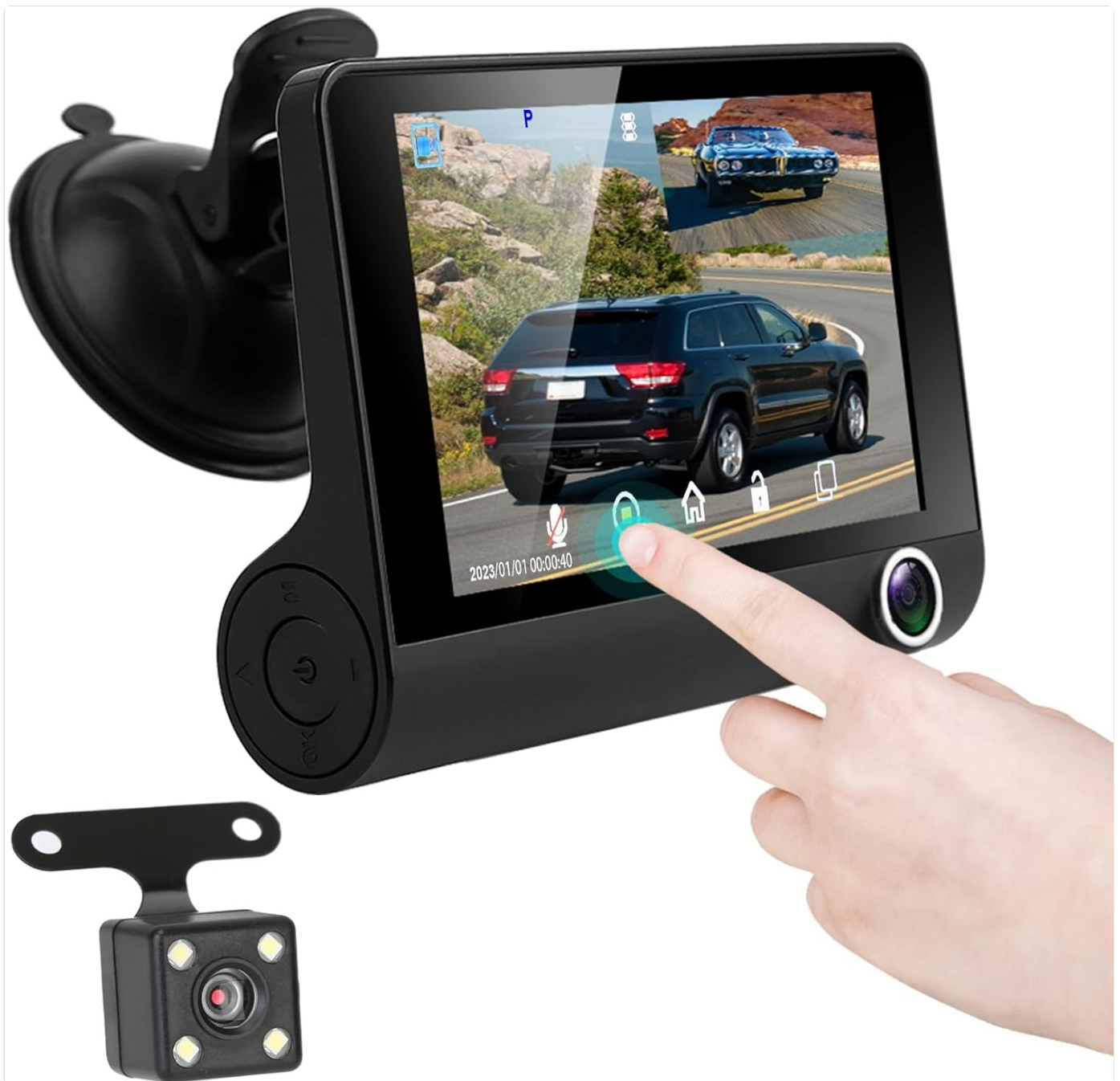
Image: The main dash cam unit with its touch screen interface, alongside the compact rear camera, illustrating the complete system.