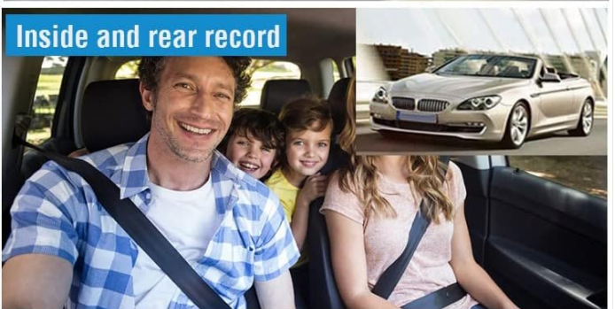
Image: The dash cam's screen displaying a split view, showing two camera feeds simultaneously, such as front and inside, or front and rear views.