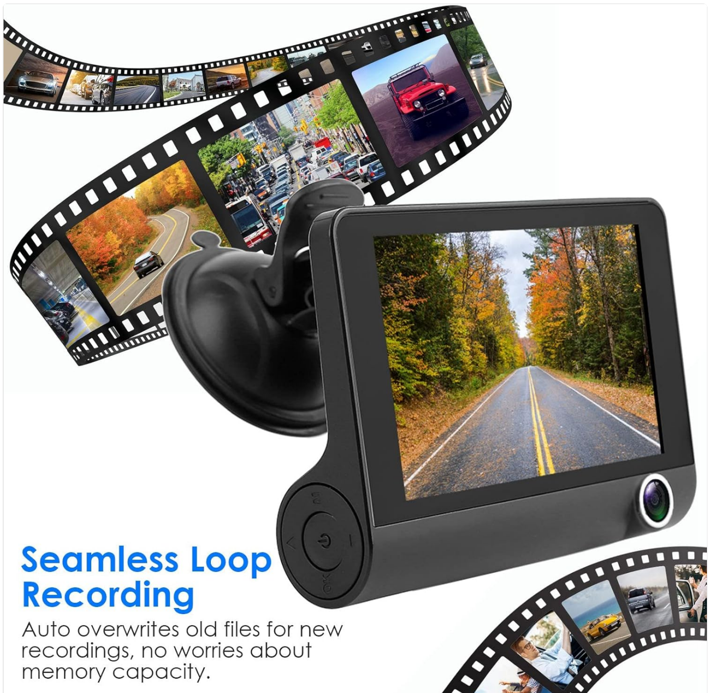
Image: A graphic demonstrating the seamless loop recording feature, where older files are automatically overwritten, with an emphasis on locked files during events.