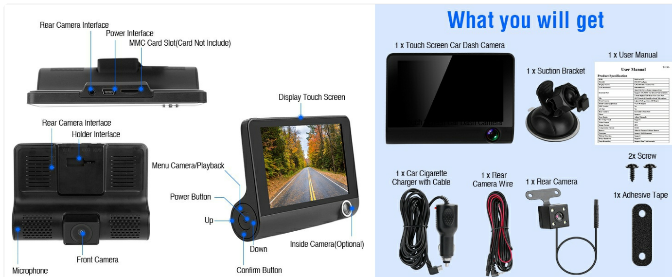
Image: A visual representation of the dash cam's structure and all included accessories, such as the main camera unit, rear camera, suction mount, and various cables.