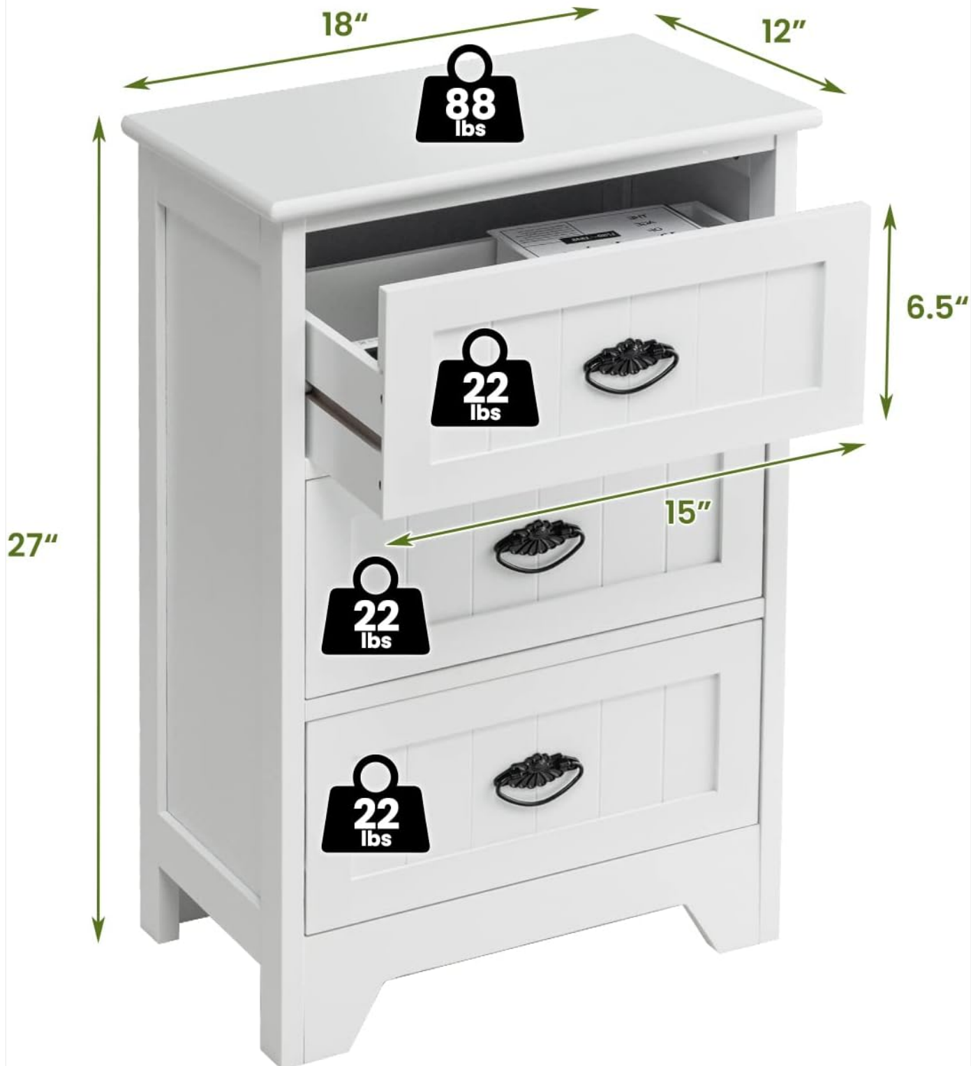
Image: Diagram illustrating the overall dimensions and weight capacities of the nightstand's tabletop and drawers.

Inner Dimensions of Drawer: 14" x 9.5" x 3.5" (L x W x H)