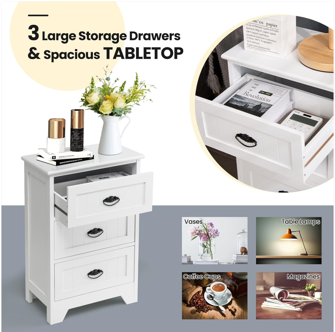
Image: The nightstand demonstrating its storage capacity with various items on the tabletop and inside the open drawers.