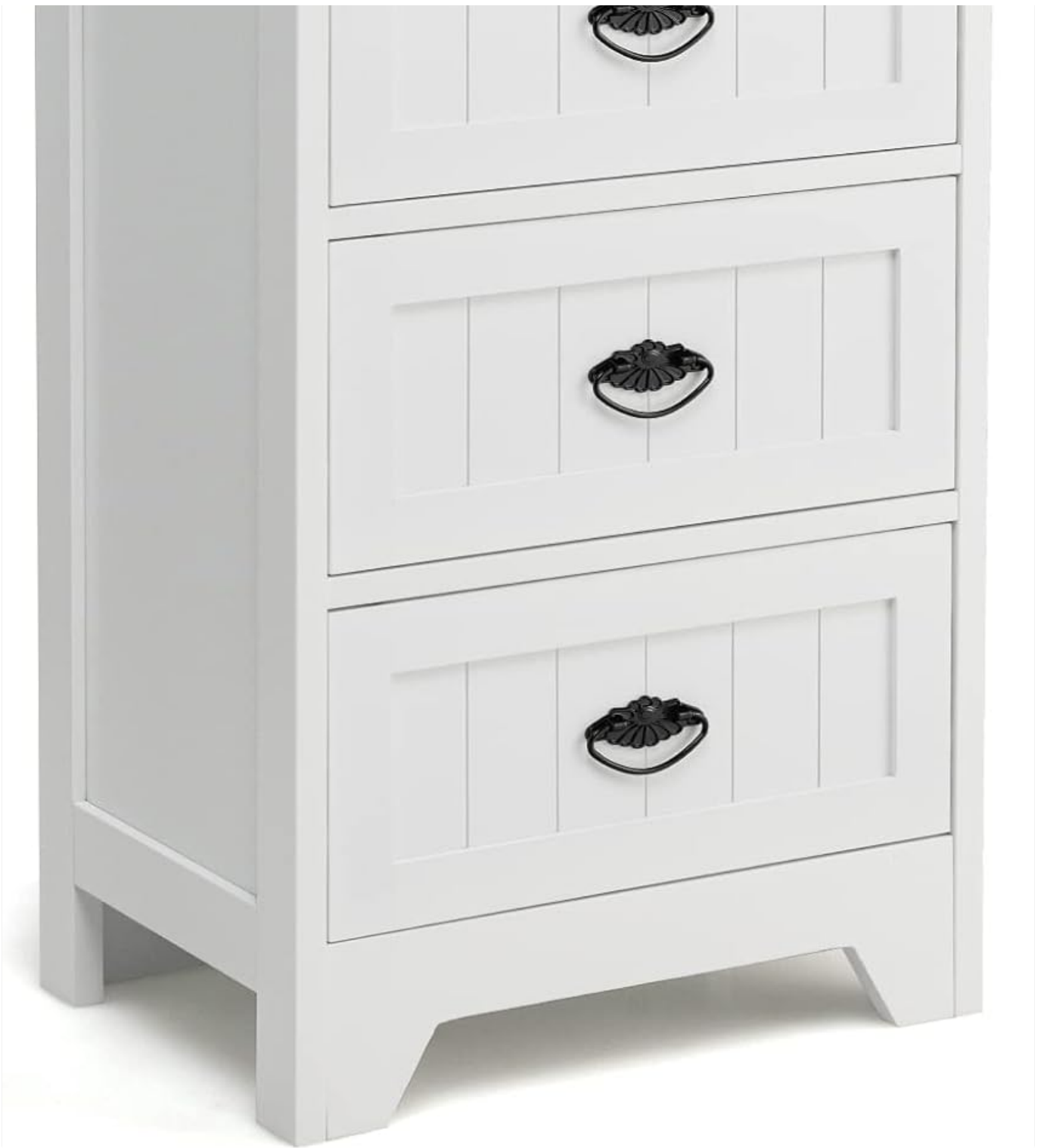
Image: The COSTWAY 3-Drawer End Table Nightstand in white, showcasing its three drawers and spacious top surface.