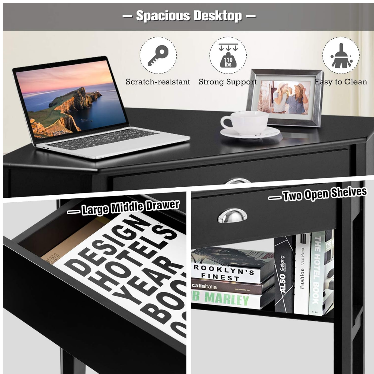
Image 5.3: Detailed view of the desk's features, including the scratch-resistant desktop, large drawer, and open storage shelves.