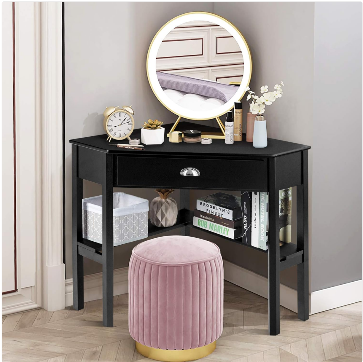
Image 5.2: The corner desk functioning as a makeup vanity, highlighting its versatility.