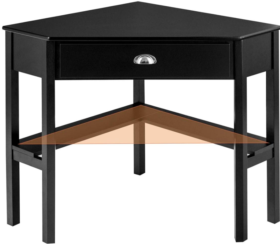
Image 4.2: Illustration of the desk's quality materials (P2 Grade MDF Board, Solid MDF Board) and stable triangular frame structure.