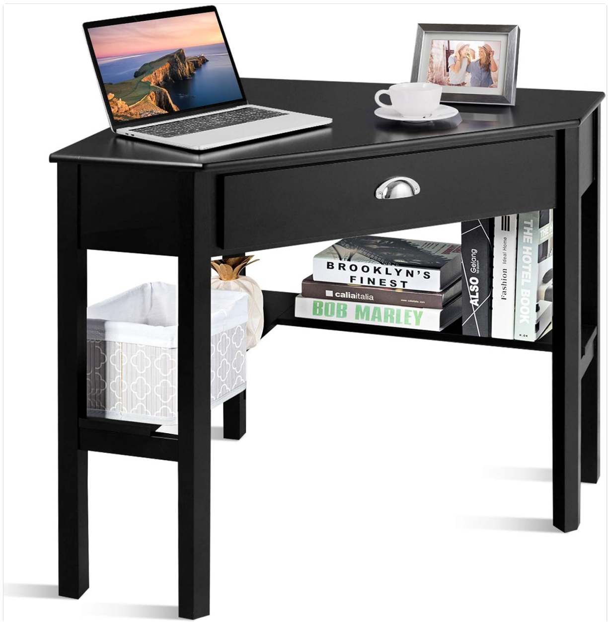
Image 5.1: The corner desk configured for office use, showcasing the spacious desktop and accessible storage shelves.