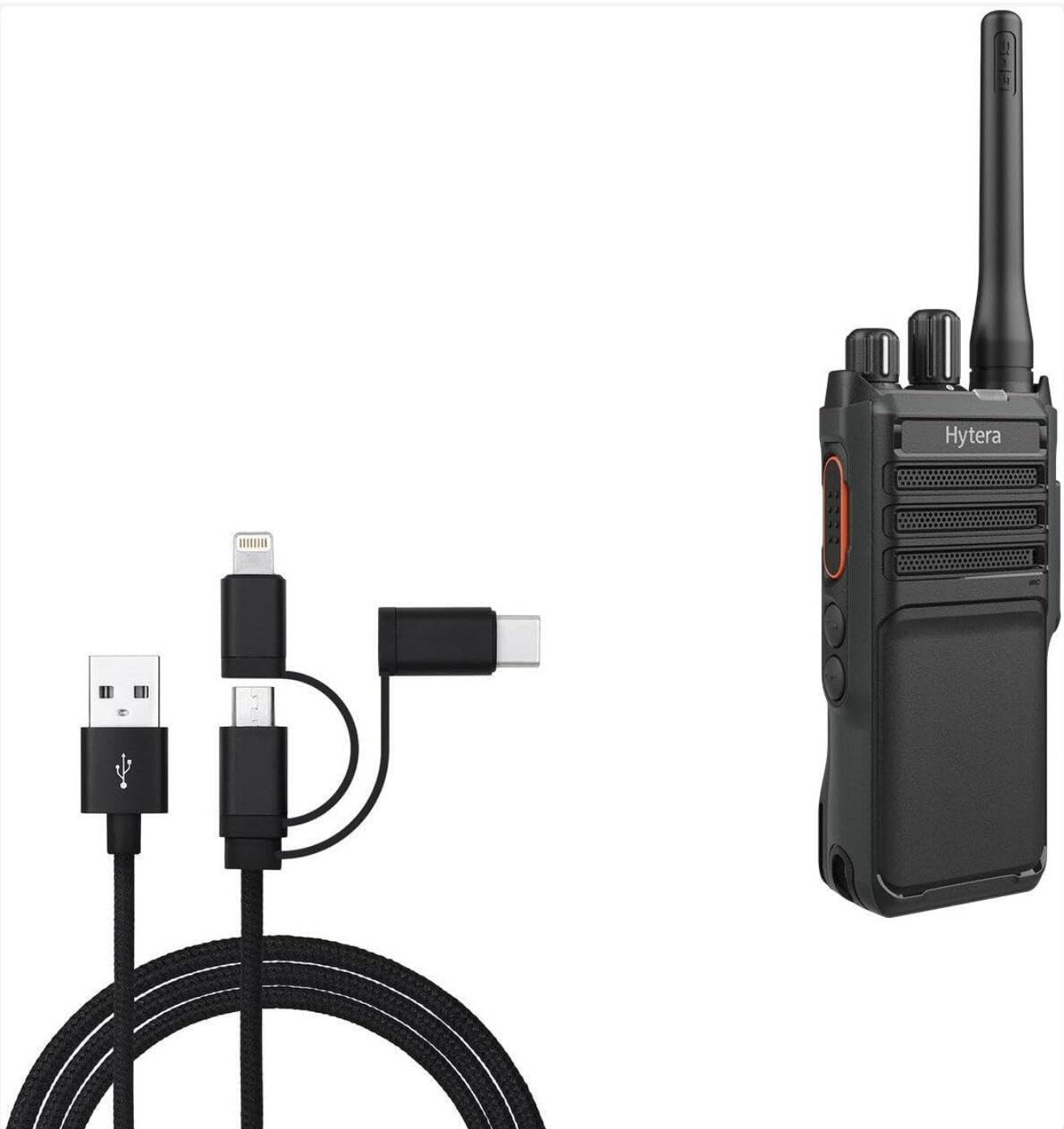
Image: The BoxWave AllCharge 3-in-1 Cable displaying its multiple connector types.