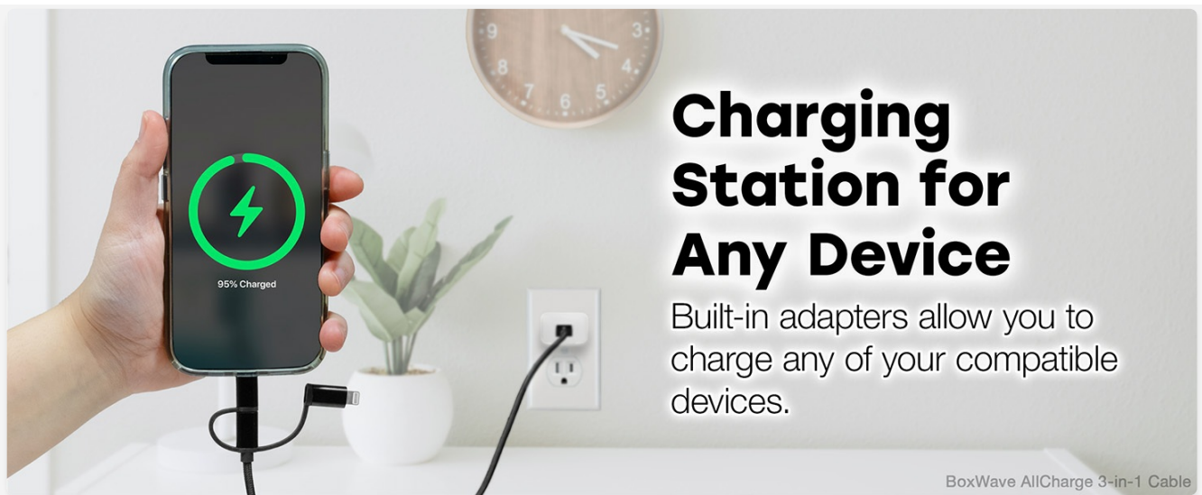
Image: The cable connected to a smartphone and a power source, illustrating its use as a charging station.