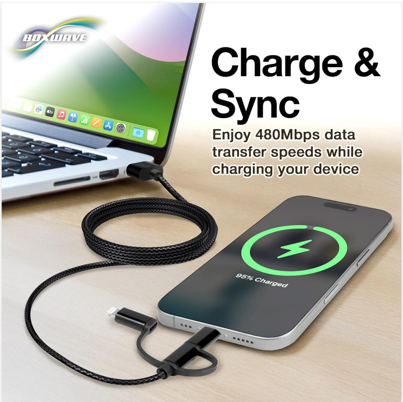
Image: The cable facilitating both charging and data synchronization between a laptop and a smartphone.