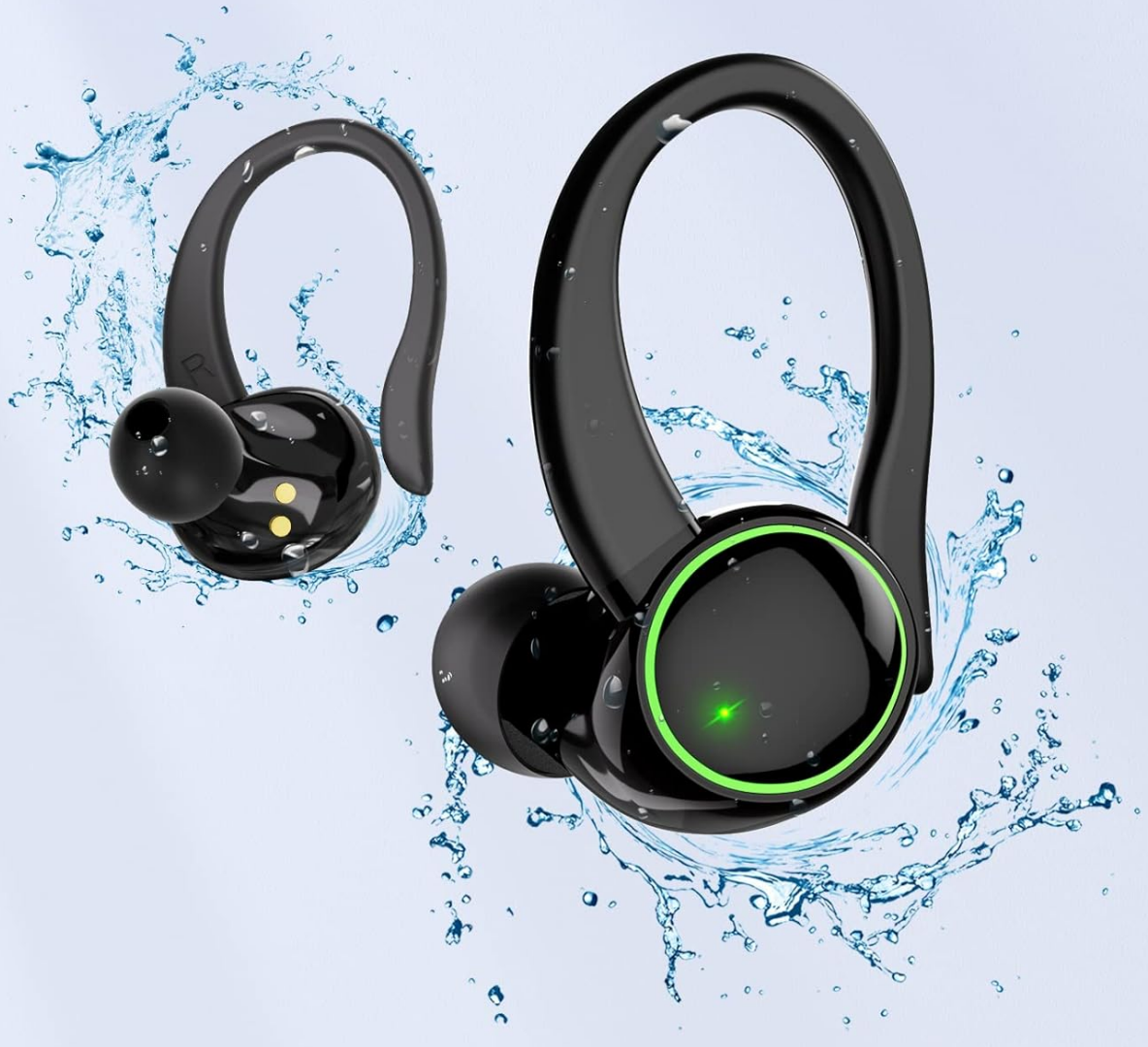
Image: The earbuds are shown with water splashing on them, illustrating their IP7 water and sweat resistance, suitable for workouts.

Water won't ruin your workout with IP7 waterproof