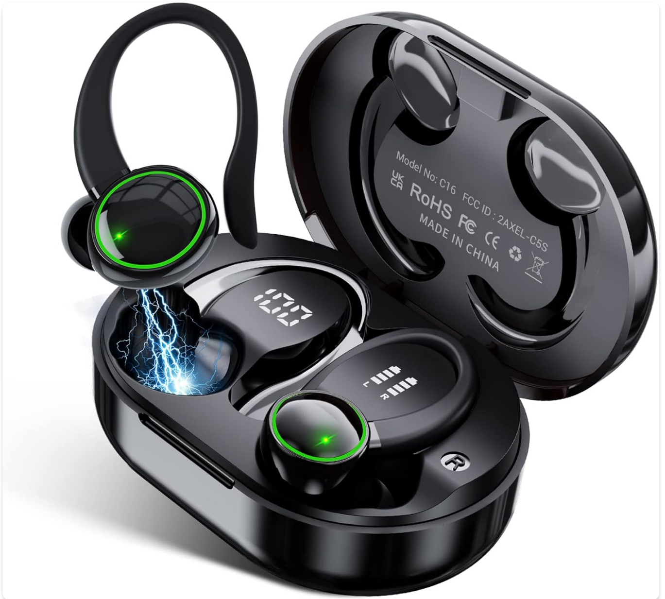
Image: The FK Trading C16 Wireless Earbuds, showcasing both earbuds with earhooks and their open charging case. The earbuds are black with green LED accents, and the charging case features an LED display.