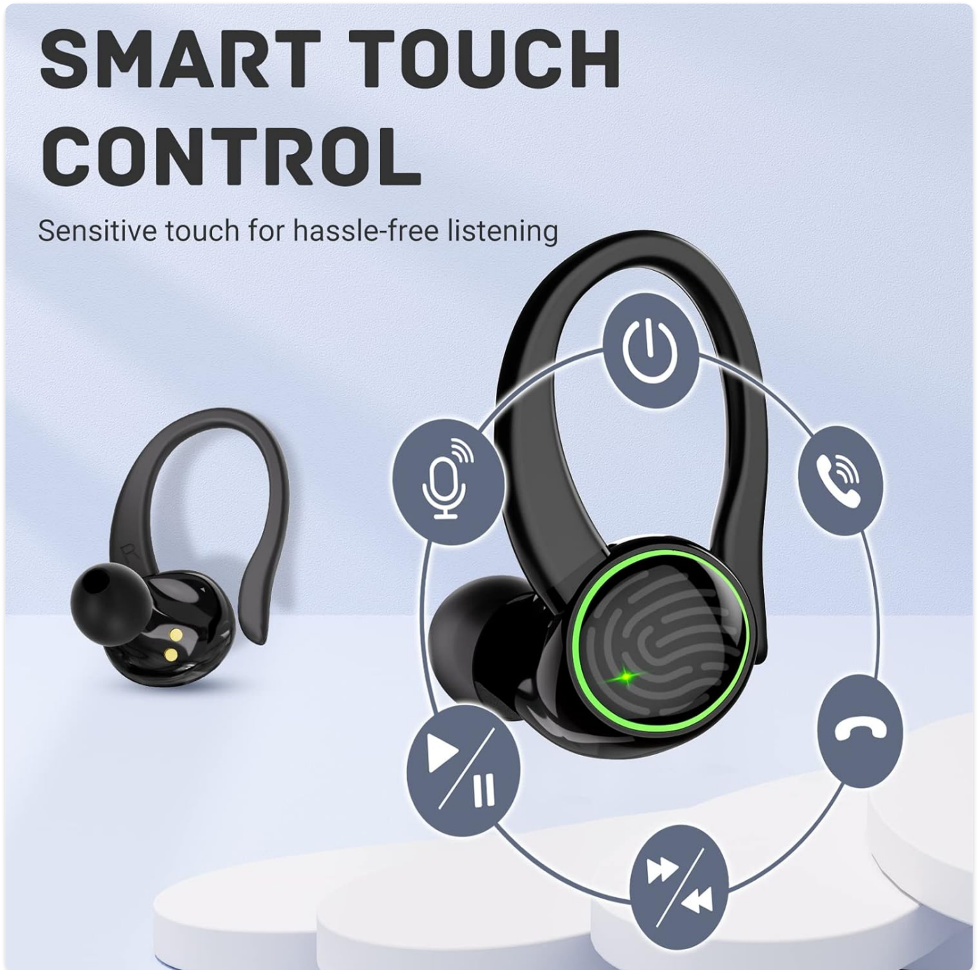
Image: A diagram illustrating the various functions controlled by touch on the earbud, including power on/off, call management, volume control, track skipping, and voice assistant activation.

The C16 earbuds feature sensitive touch controls on the outer surface of each earbud.