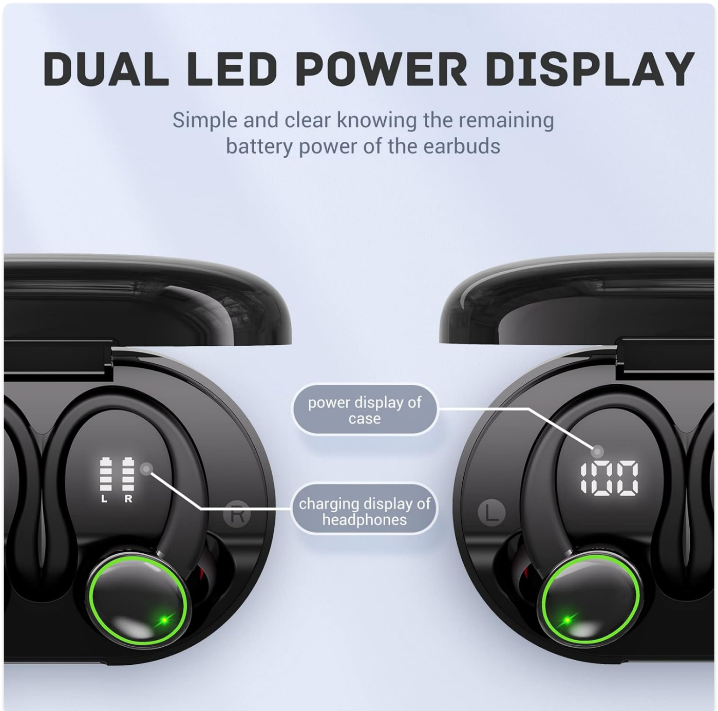
Image: A close-up of the charging case's dual LED display, showing separate battery indicators for the left and right earbuds, and a percentage for the charging case itself.