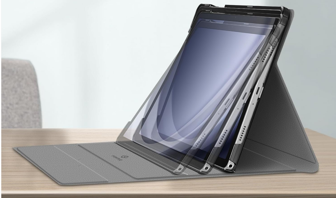
Image: Multiple Viewing Angles. This image illustrates the three adjustable viewing angles provided by the case's stand feature, along with anti-slip grooves for stability.