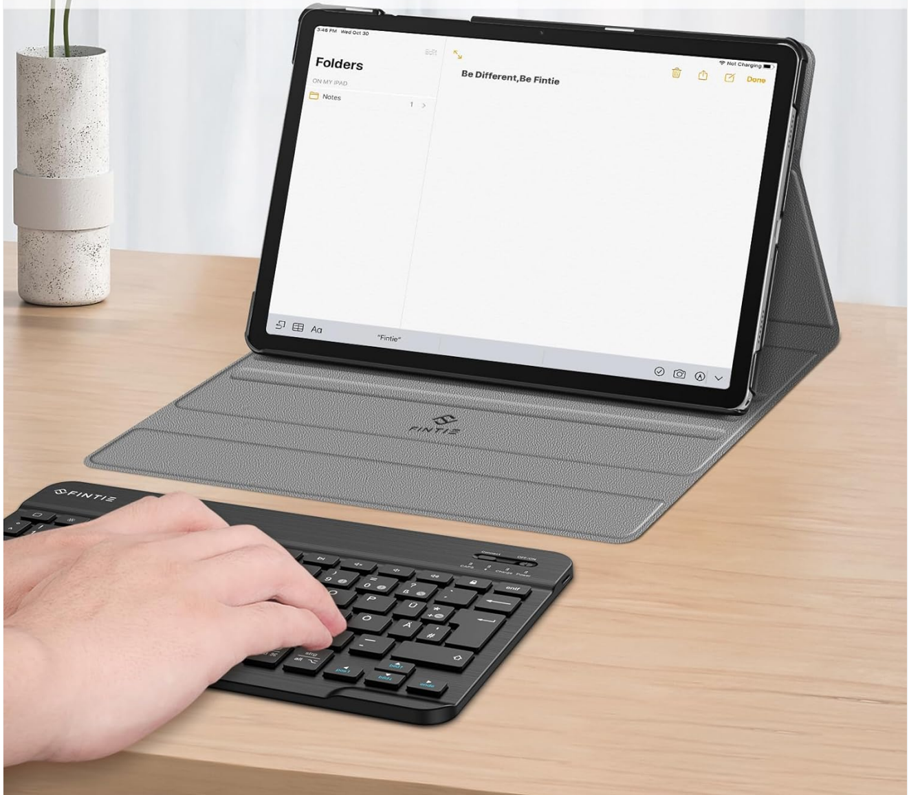
Image: Bluetooth Transmission Distance 10M. This image depicts the tablet and keyboard in use, highlighting the effective Bluetooth transmission range of up to 10 meters.