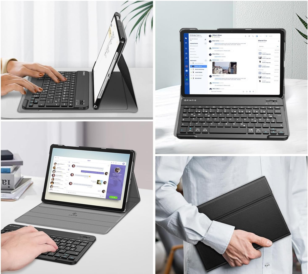
Image: Turn Your Tablet into An Ultraportable Laptop. This collage showcases different ways the Fintie keyboard case can be used, illustrating its versatility for work and leisure.