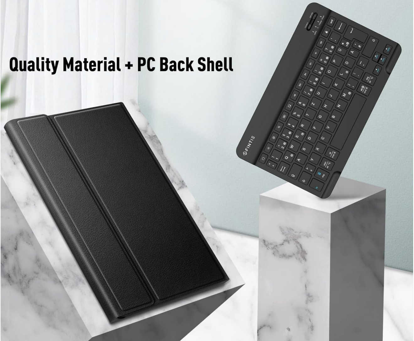
Image: High End ABS Material Keyboard. This image provides a detailed view of the keyboard, emphasizing its construction from high-quality ABS material.