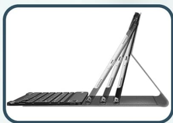
3 Viewing angles

It turns into a convenient stand, gives you a best viewing angle.