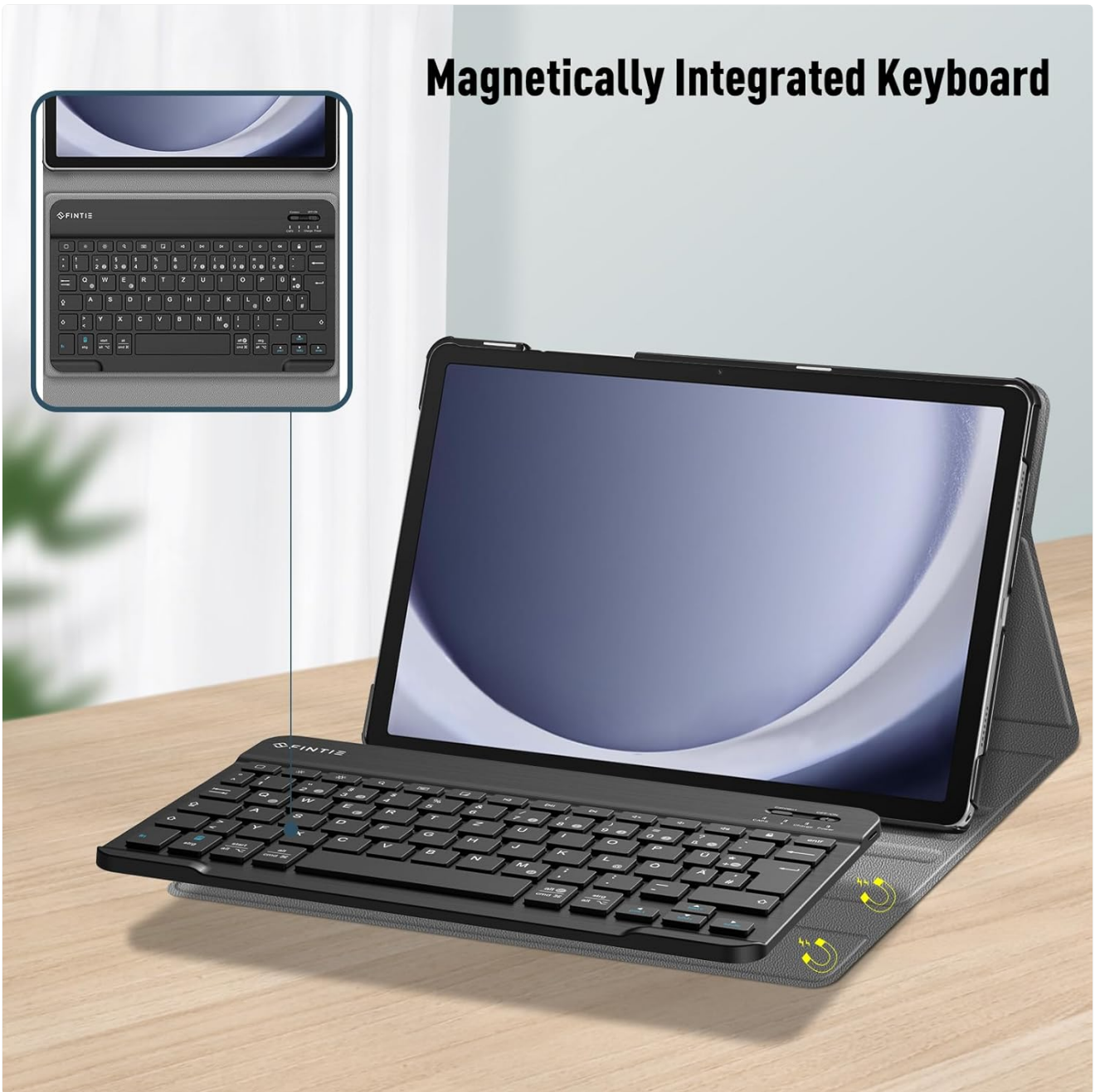
Image: Magnetically Integrated Keyboard. This image demonstrates how the keyboard can be magnetically attached to the case for use or easily removed for flexible positioning.