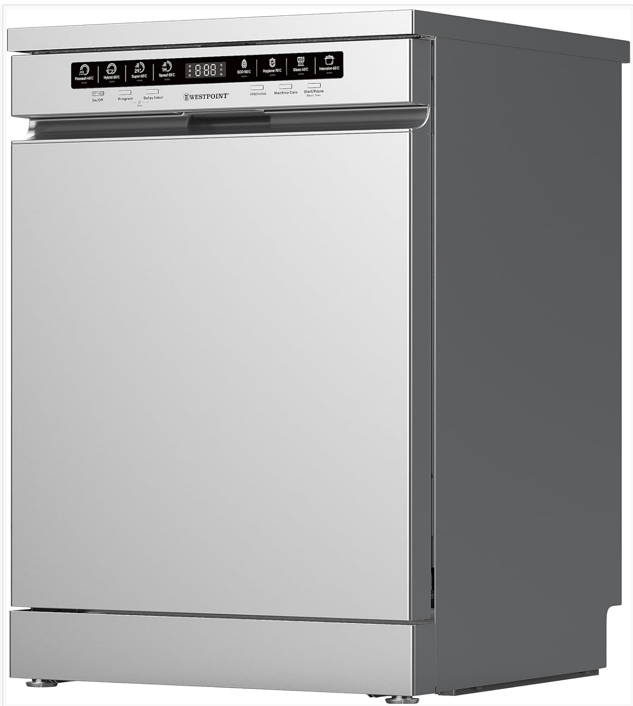
Angled view of the Westpoint WYS-1323I dishwasher, highlighting its compact yet spacious design.