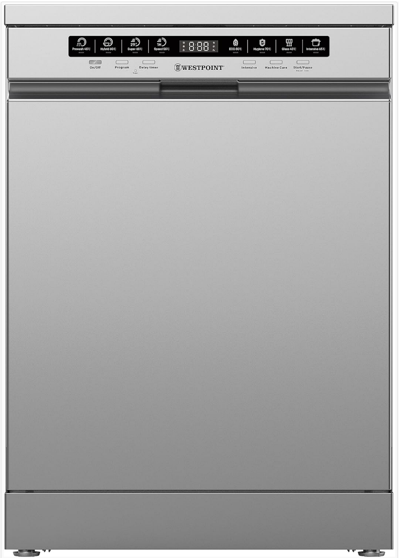
Front view of the Westpoint WYS-13231 dishwasher, showcasing its sleek stainless steel finish and integrated control panel.