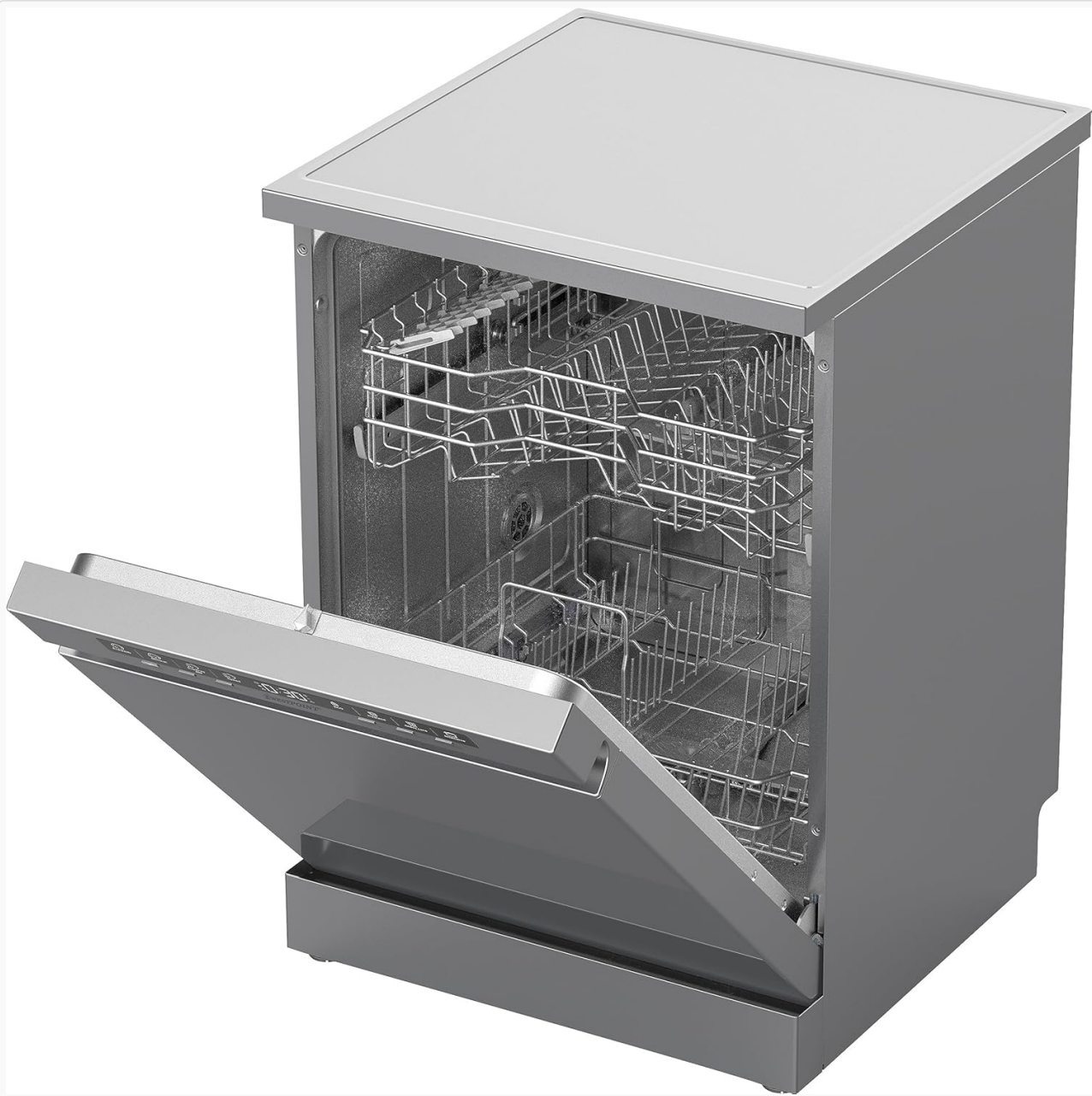
Interior view of the dishwasher showing the upper and lower racks, designed for efficient loading of various dishware.