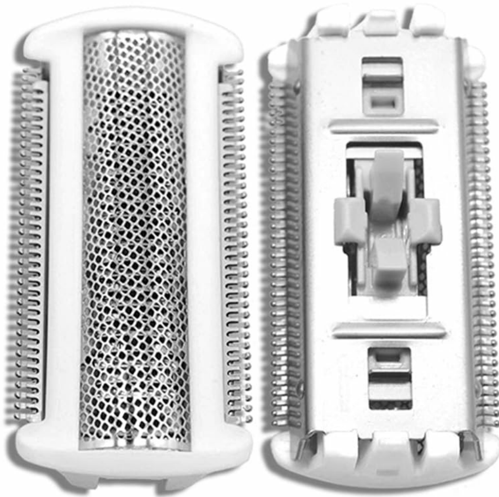
Image: A pair of maxylead replacement shaver foil heads, displaying their front and back components.