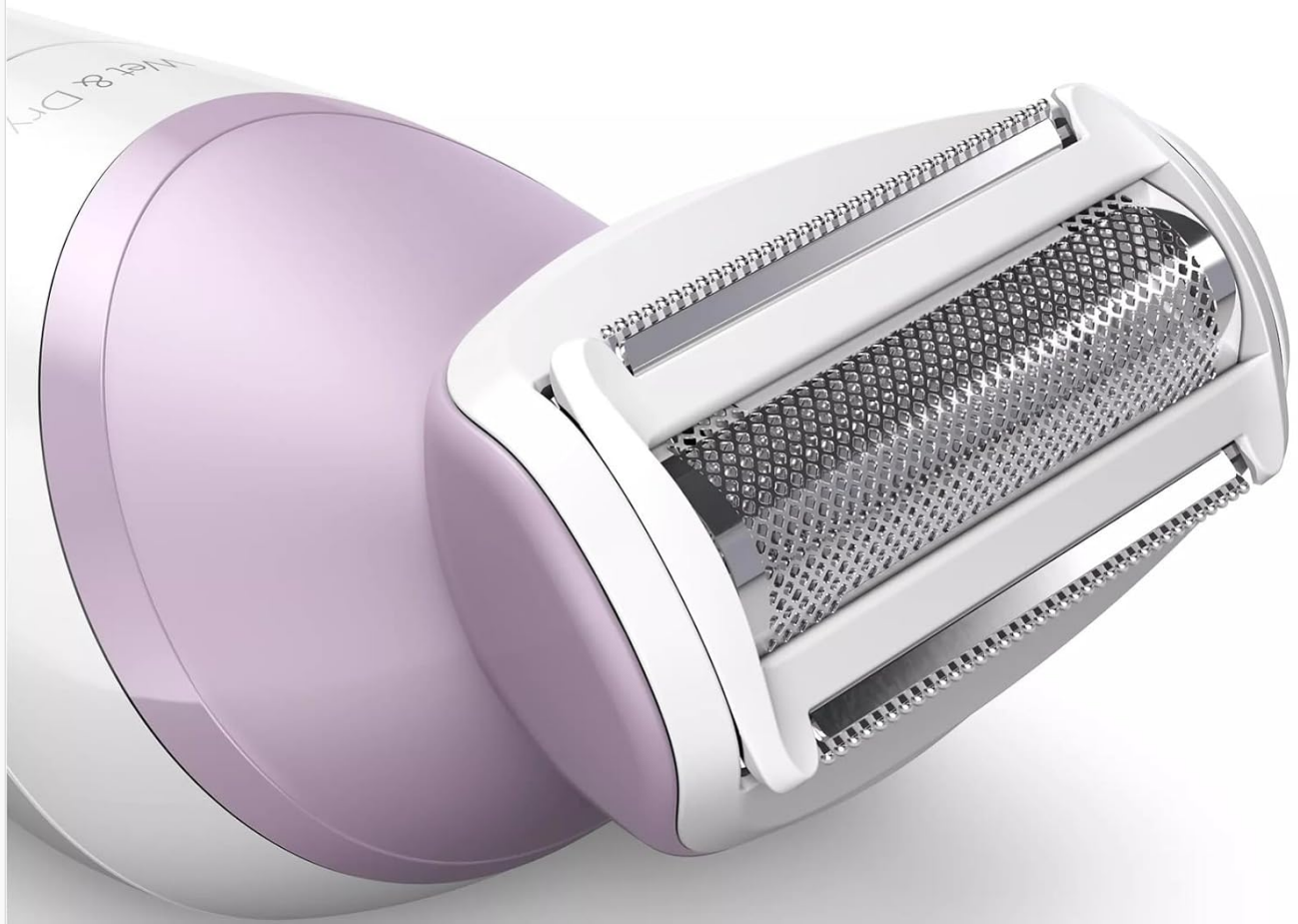
Image: The maxylead replacement head shown attached to a Philips Beauty Lady Shaver, highlighting its integrated design.