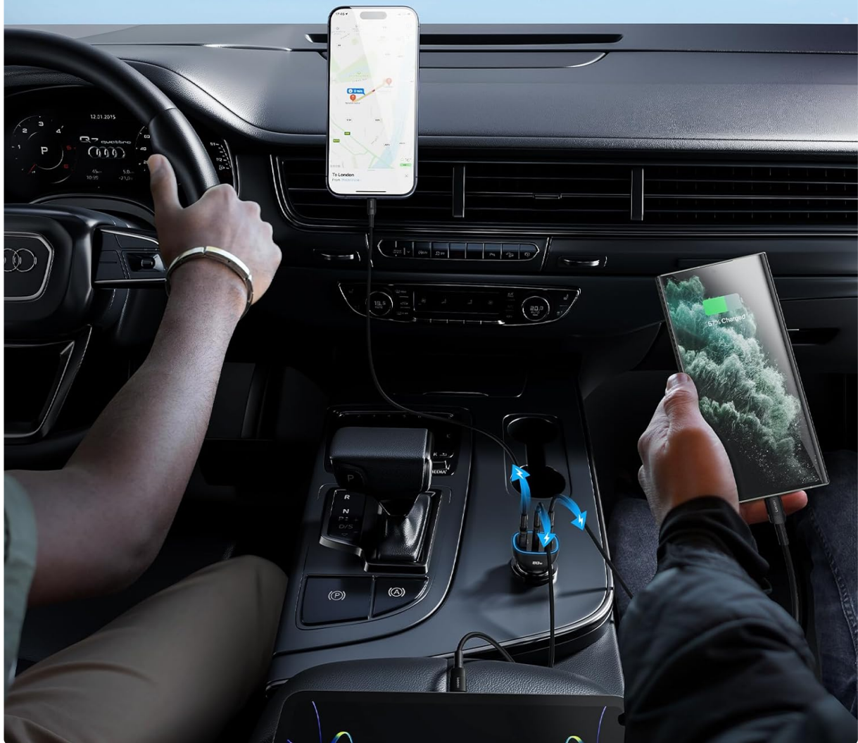
Image: The toocki 80W USB C Car Charger plugged into a car's power outlet, demonstrating its compact, thumb-sized design and the illuminated LED ring, which helps locate it in the dark.