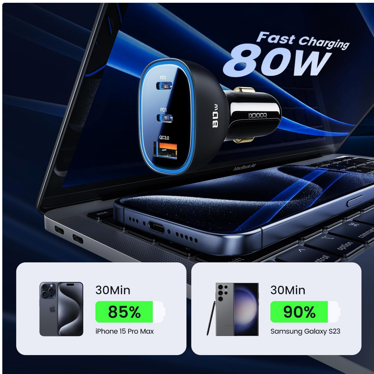
Image: The toocki 80W USB C Car Charger showcasing its fast charging capabilities, indicating an iPhone 15 Pro Max charging to 85% in 30 minutes and a Samsung Galaxy S23 to 90% in 30 minutes.