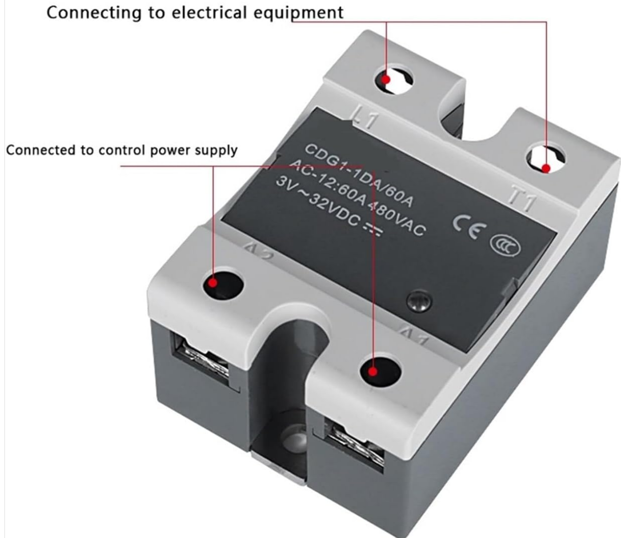
Figure 3.2: Angled view highlighting the "No contact, no spark" feature and connection points for control and load circuits.