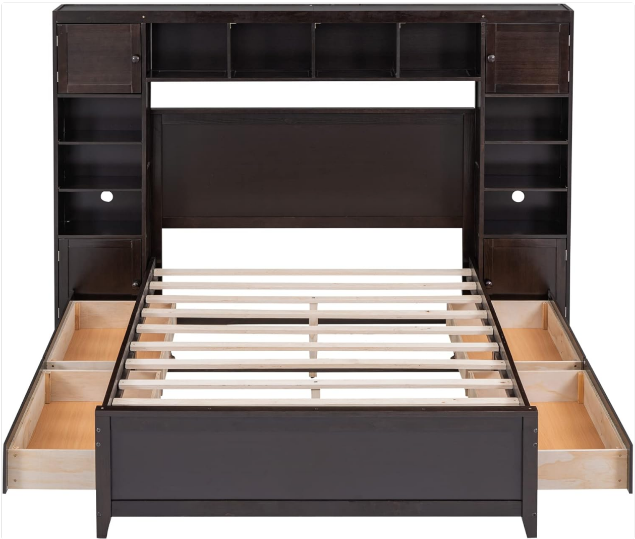
Image: The bed with two under-bed drawers fully extended, showing their storage capacity.