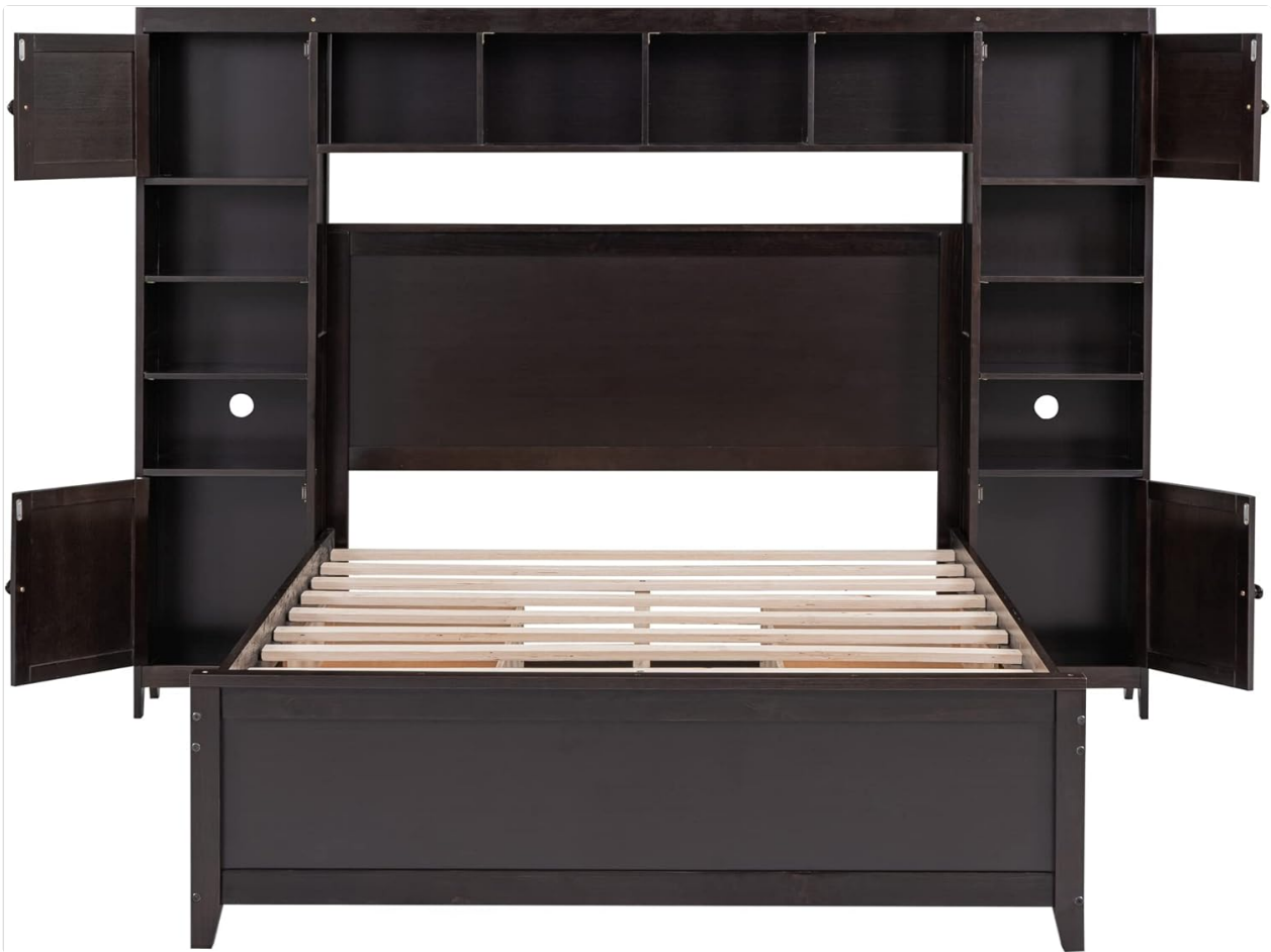
Image: A front view of the bed, showcasing the headboard with all cabinet doors open, revealing the internal shelving.