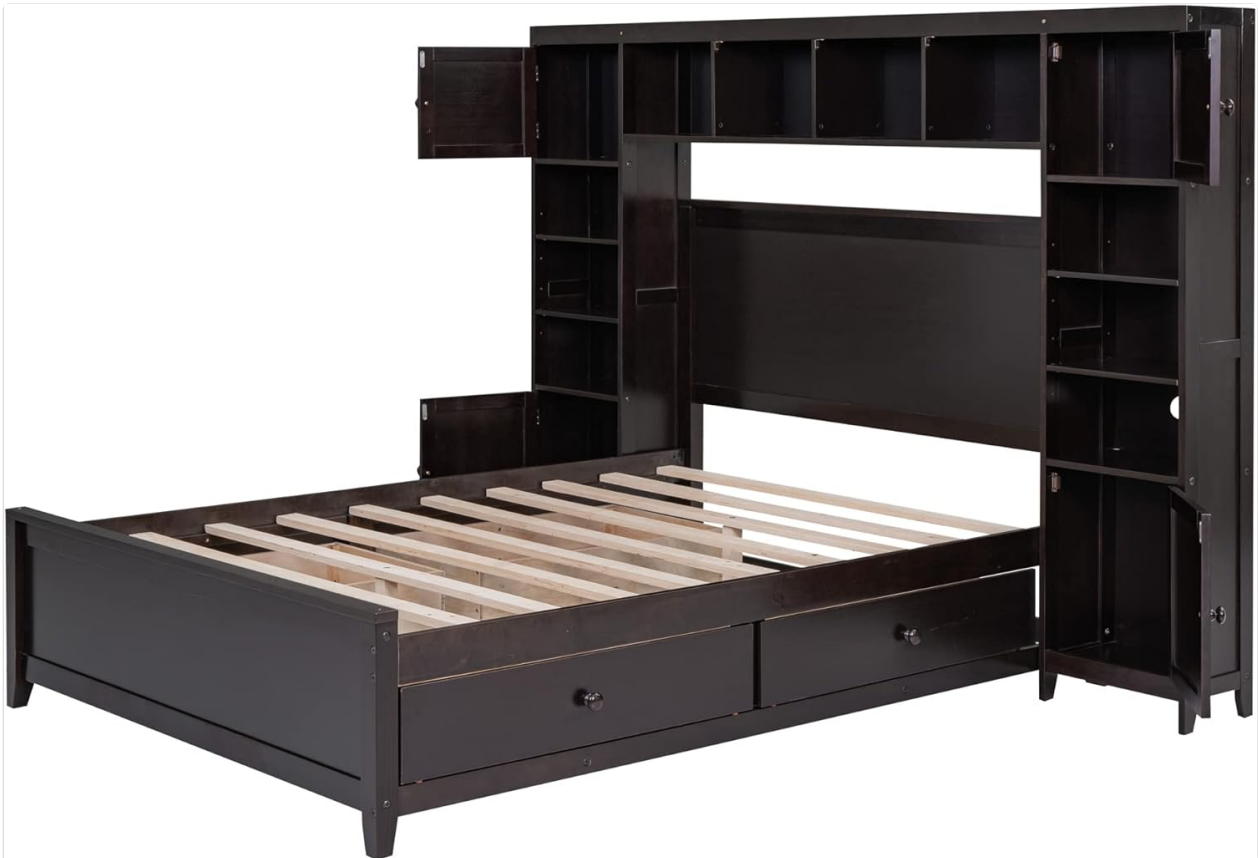
Image: The bed frame with the headboard and its integrated open cabinets and shelves, illustrating the structure before drawers are fully installed.