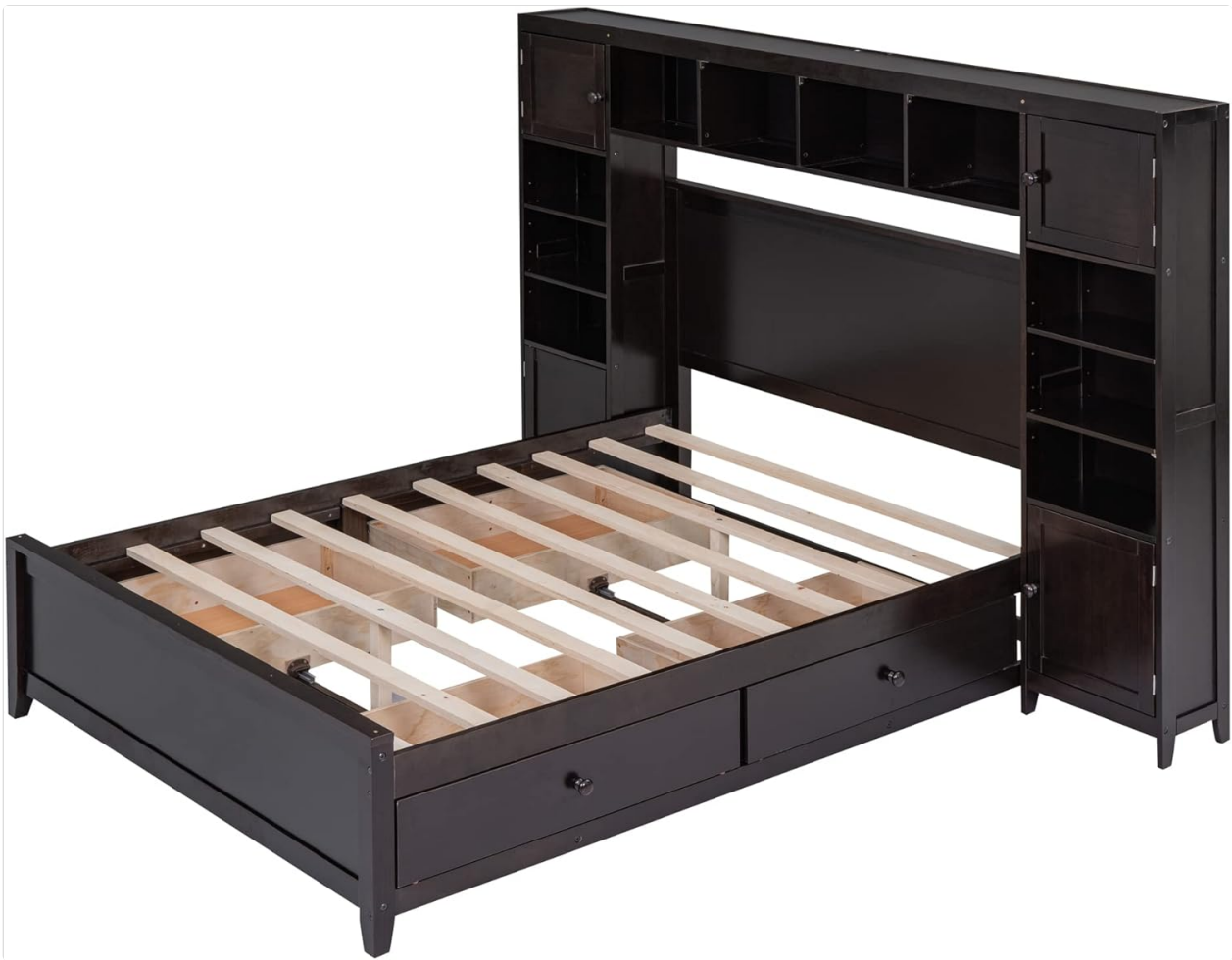
Image: The Flieks bed with all headboard cabinet doors closed, showing the neat appearance of the integrated storage.