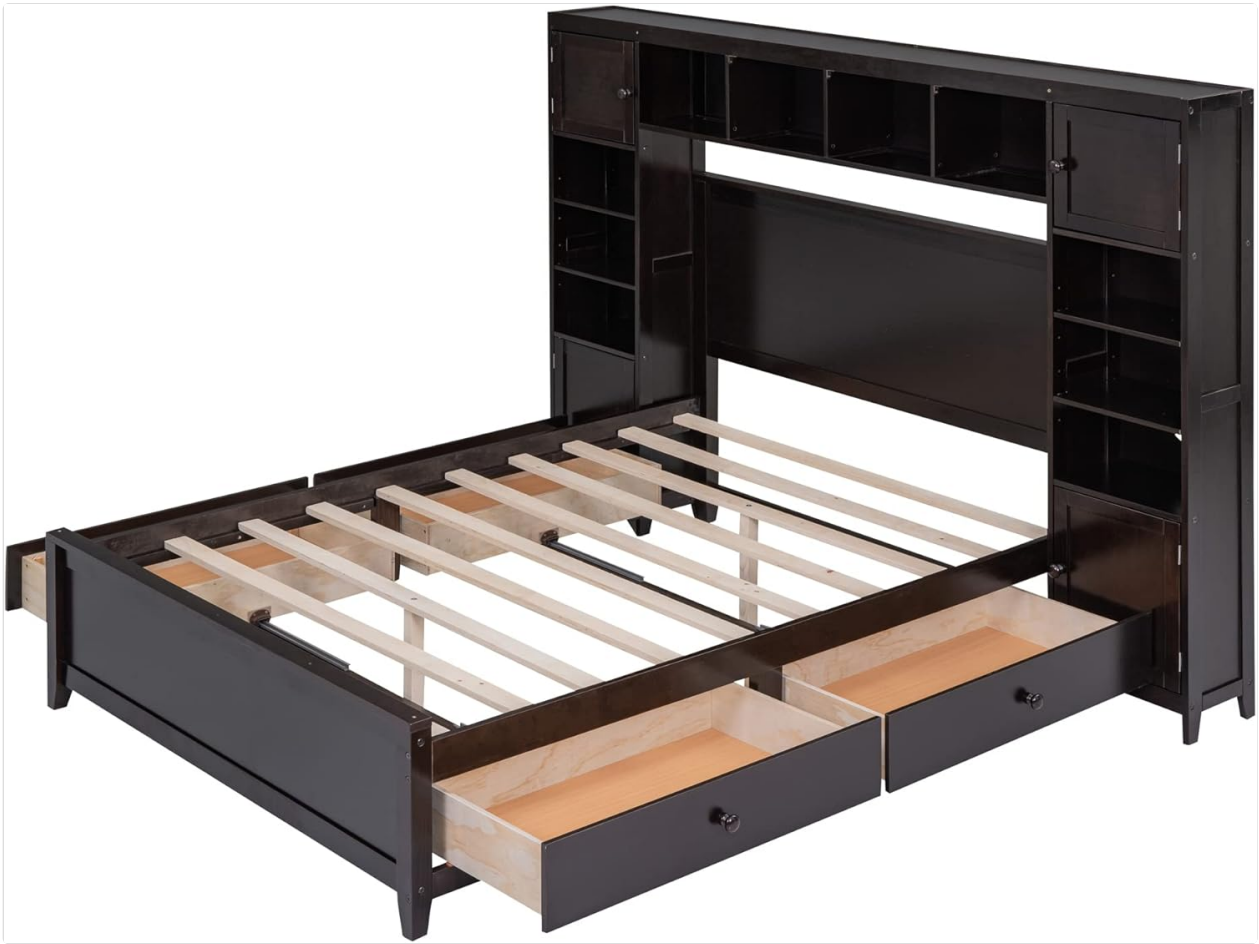
Image: An angled view of the bed, highlighting the two under-bed drawers pulled out for access.