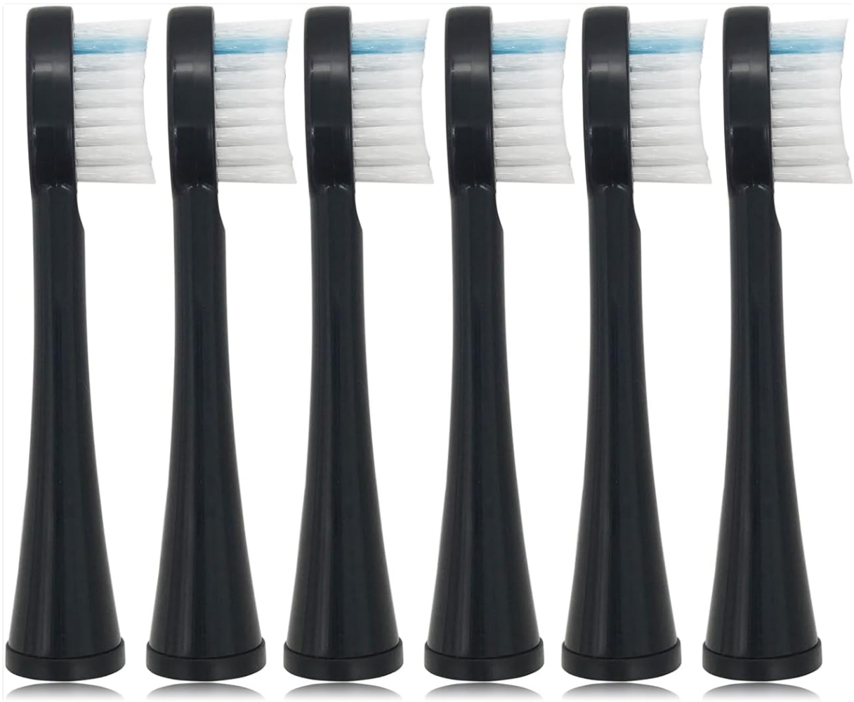
Image: Six black PDEEY SF-03W replacement brush heads with white and blue bristles, viewed from the front. Each head is designed for optimal oral hygiene.