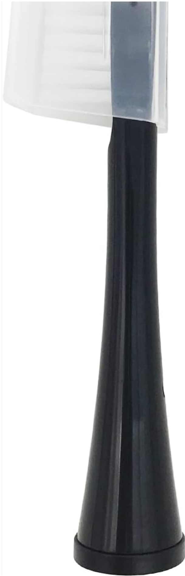
Image: A single black PDEEY SF-03W replacement brush head with its clear protective cover, shown from a side angle.