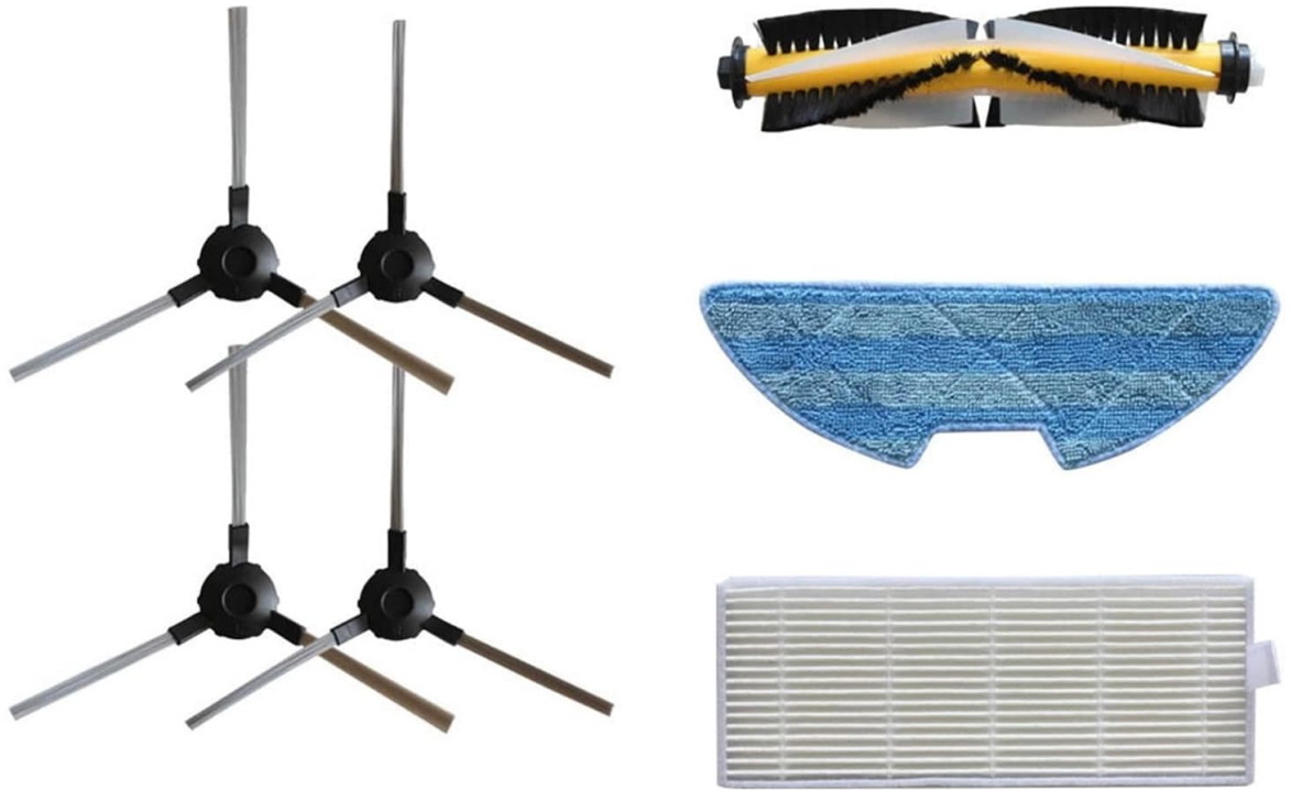
Image: Detailed view of individual components, including the main brush, which is a yellow and black roller brush.