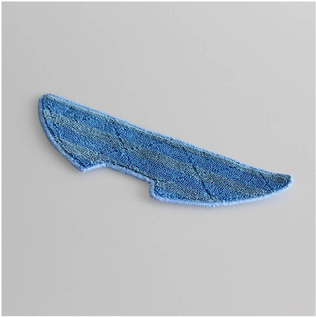
Image: A blue microfiber mop cloth, designed for wet cleaning floors.