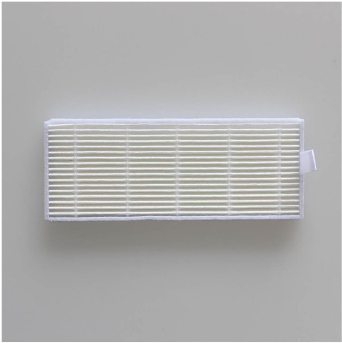
Image: A rectangular white HEPA filter, designed to capture fine dust particles.