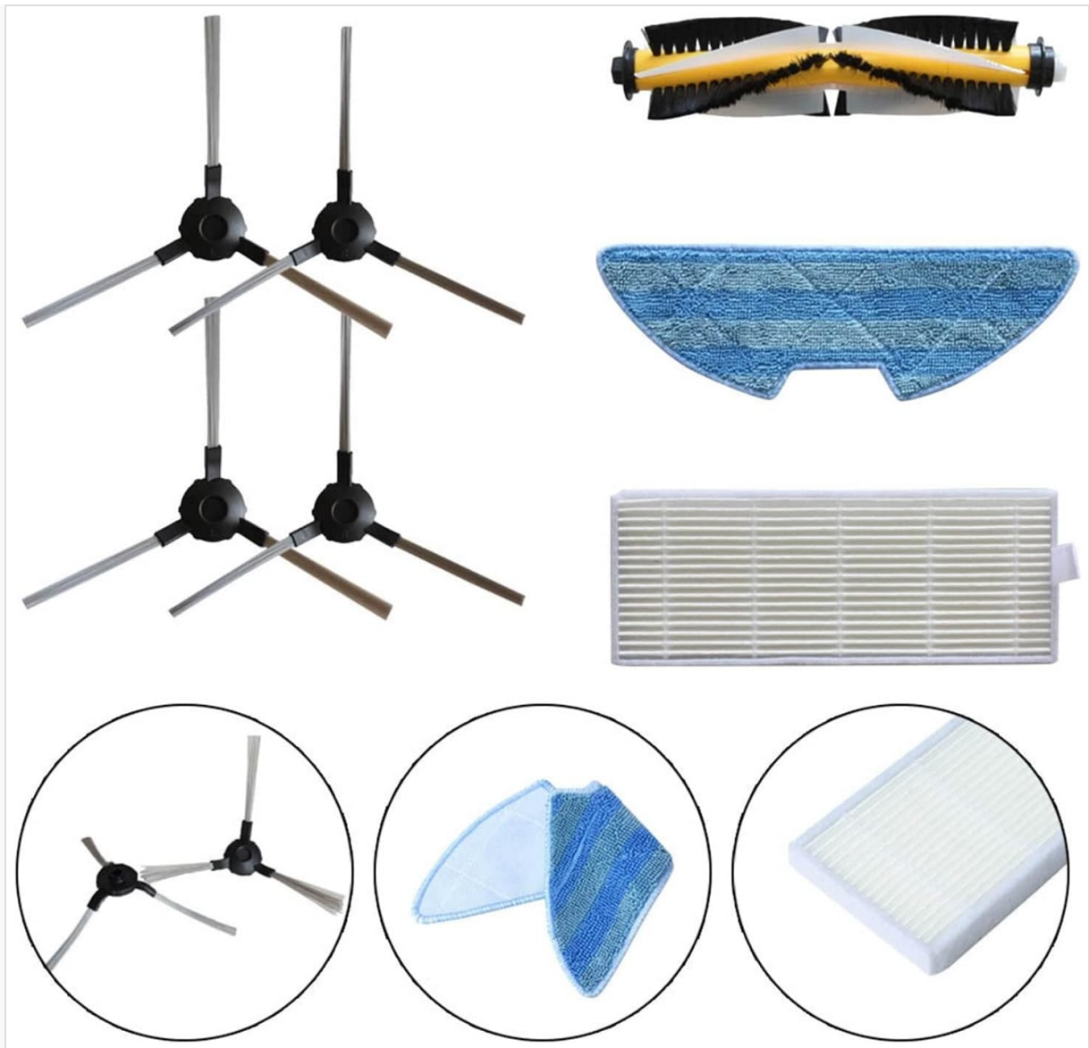
Image: Overview of the EtlIN Vacuum Cleaner Parts Accessories Set, showing the main brush, four side brushes, a filter, and a mop cloth.