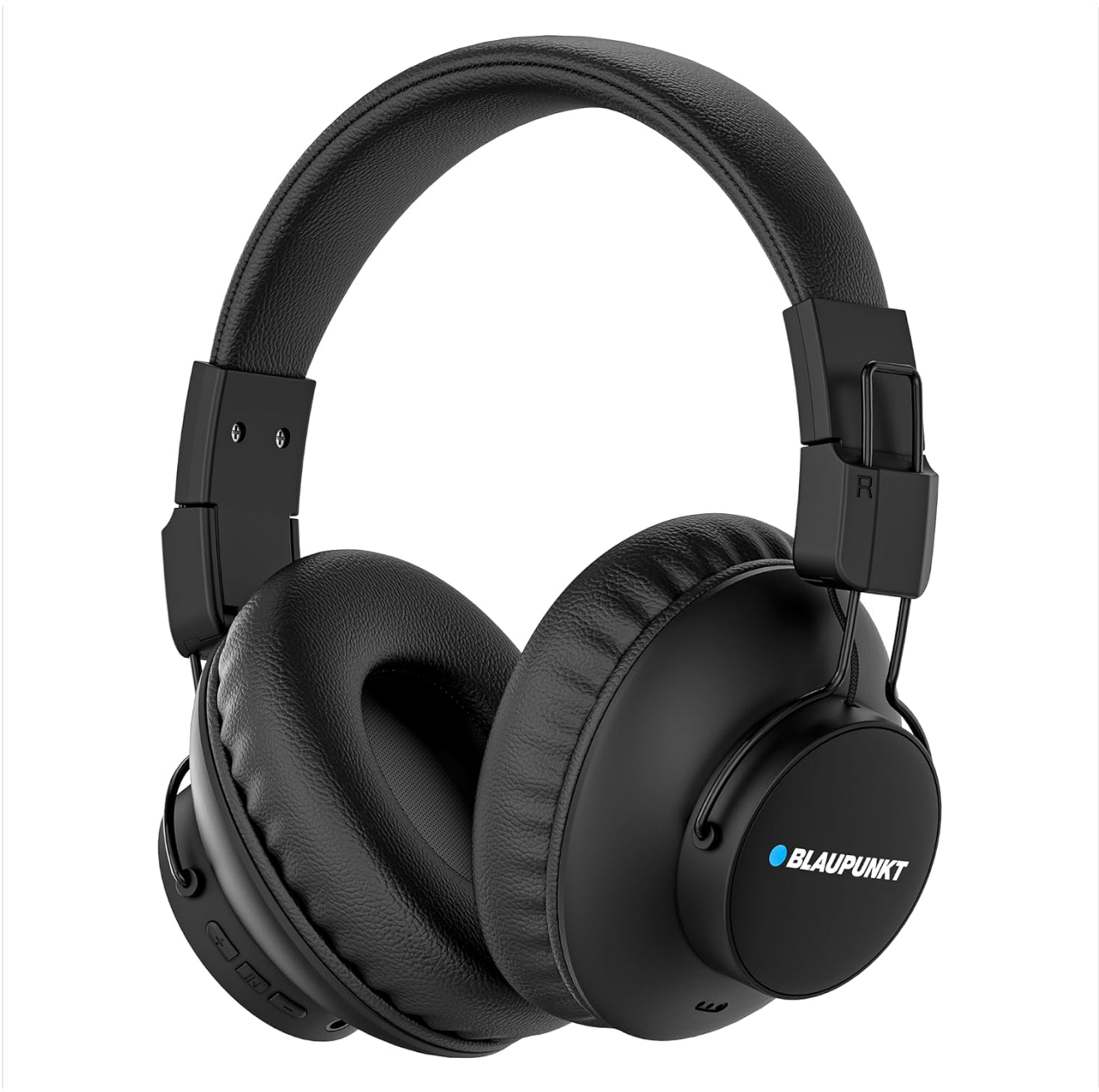
Image: Front view of the Blaupunkt BH41 Wireless Over-Ear Headphones in Metallic Black. The headphones feature large earcups, a padded headband, and the Blaupunkt logo on the side of the earcup.

Familiarize yourself with the components and controls of your Blaupunkt BH41 headphones.