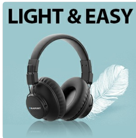
Image: The Blaupunkt BH41 headphones depicted alongside a feather, symbolizing their lightweight design for comfortable extended wear.