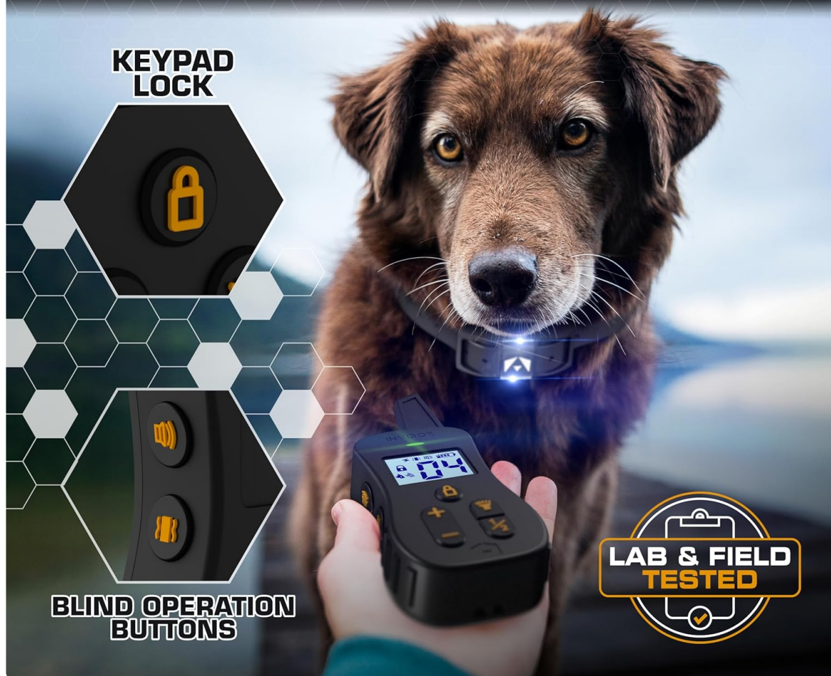
Image: Detail of the remote control showing the keypad lock feature and tactile buttons for blind operation, ensuring precise control.