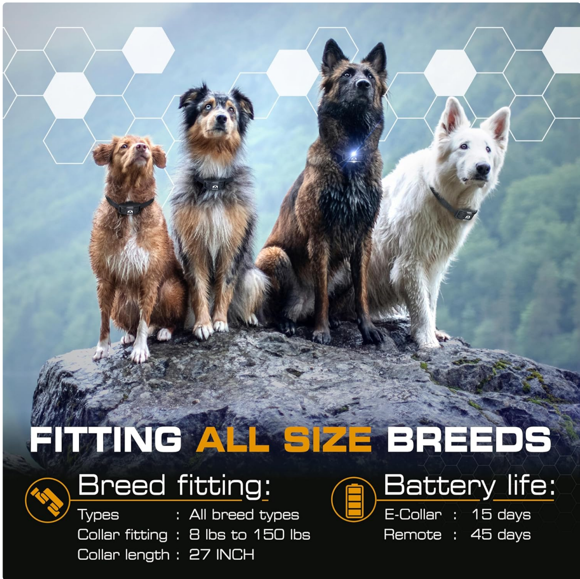
Image: The collar is designed to fit all dog sizes, from 8 lbs to 150 lbs, as shown on various breeds.