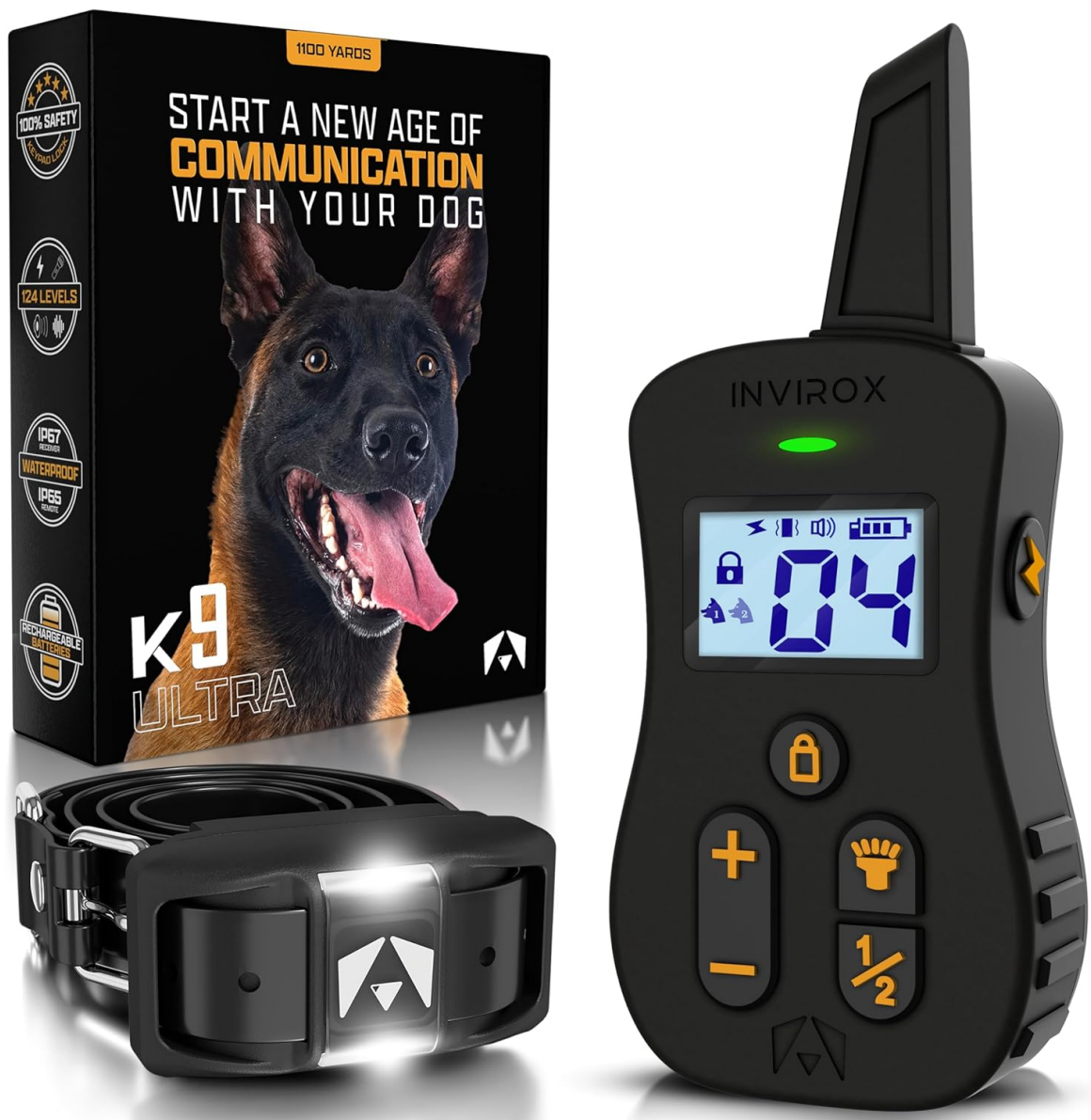
Image: The complete INVIROX Ultra K9 package, including the remote, collar, and various accessories.