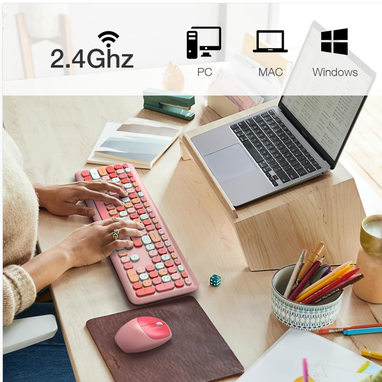
Image: MOFII Wireless Keyboard and Mouse Combo connected to a laptop and desktop computer, demonstrating multi-device compatibility.