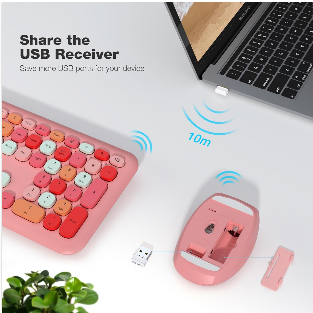
Image: The underside of the MOFI wireless mouse, illustrating the battery compartment and the storage slot for the USB nano receiver.