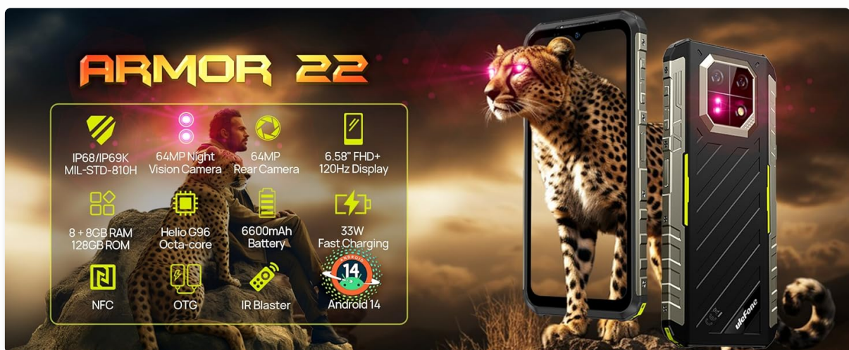
Image 1.1: Ulefone Armor 22 highlighting key features like camera, display, battery, and durability ratings.

The Ulefone Armor 22 is a rugged smartphone designed for durability and high performance in challenging environments. It features a 64MP dual camera system, a large 6600mAh battery, a 6.58-inch FHD+ 120Hz display, and runs on Android 14 with a MediaTek Helio G96 Octa-Core chipset. This device is built to withstand water, dust, and drops, meeting IP68/IP69K and MIL-STD-810H standards.