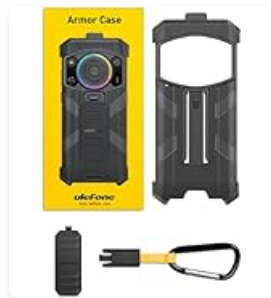
Image 9.2: The Armor Case, offering additional protection and utility with a back clip and carabiner attachment.

Your browser does not support the video tag.