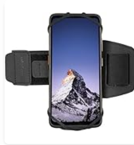
Image 9.1: The Armor Mount accessory, designed for secure phone placement in cars or on bikes.

Enhance your Ulefone Armor 22 experience with a range of compatible accessories, sold separately. These include the Armor Mount for vehicles and bikes, and the multifunctional Armor Case with a back clip and carabiner.