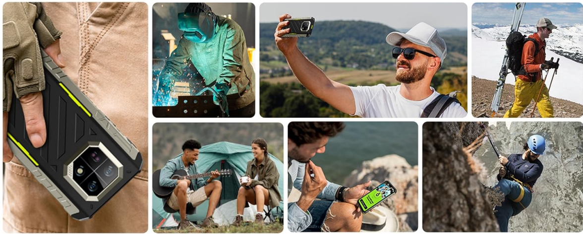
Image 4.1: The 64MP Night Vision Camera with dual IR LEDs, capable of capturing clear images in low-light conditions.

The Armor 22 features a powerful dual camera system, including a 64MP Sony IMX686 wide-angle lens for detailed photos and a 64MP night vision camera for clear images in complete darkness. It also includes an 8MP front camera for selfies and video calls.