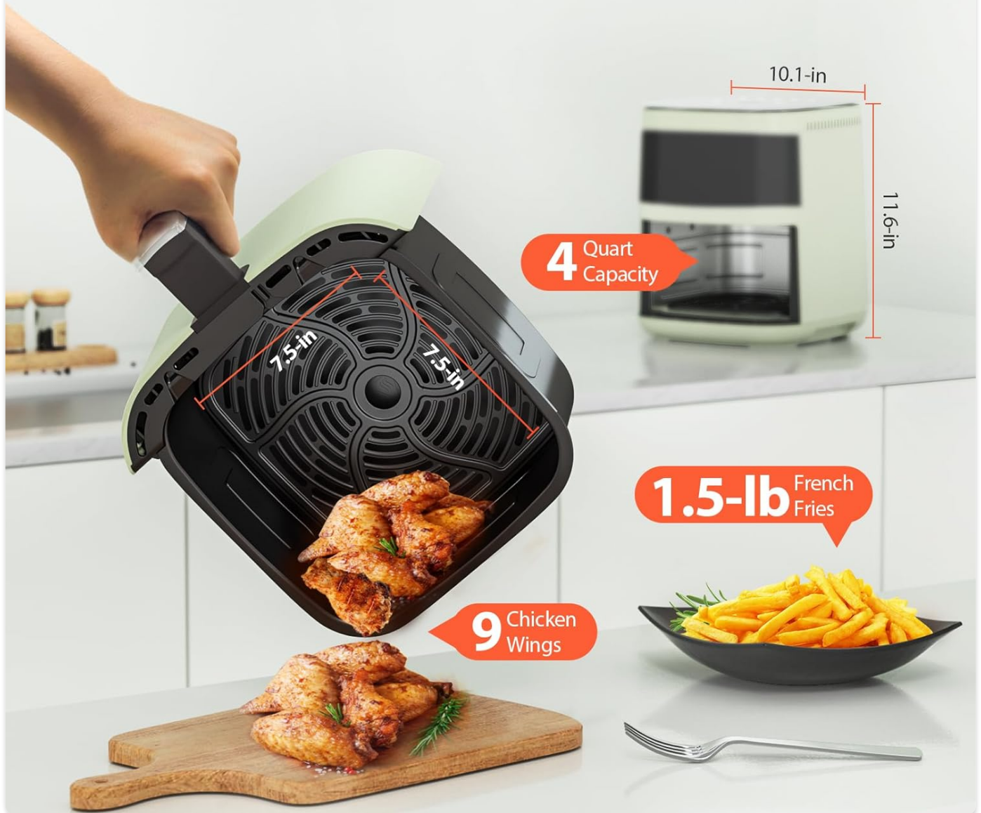
Figure 6: The air fryer's compact design makes it suitable for smaller countertops while offering a generous 4-quart cooking capacity.