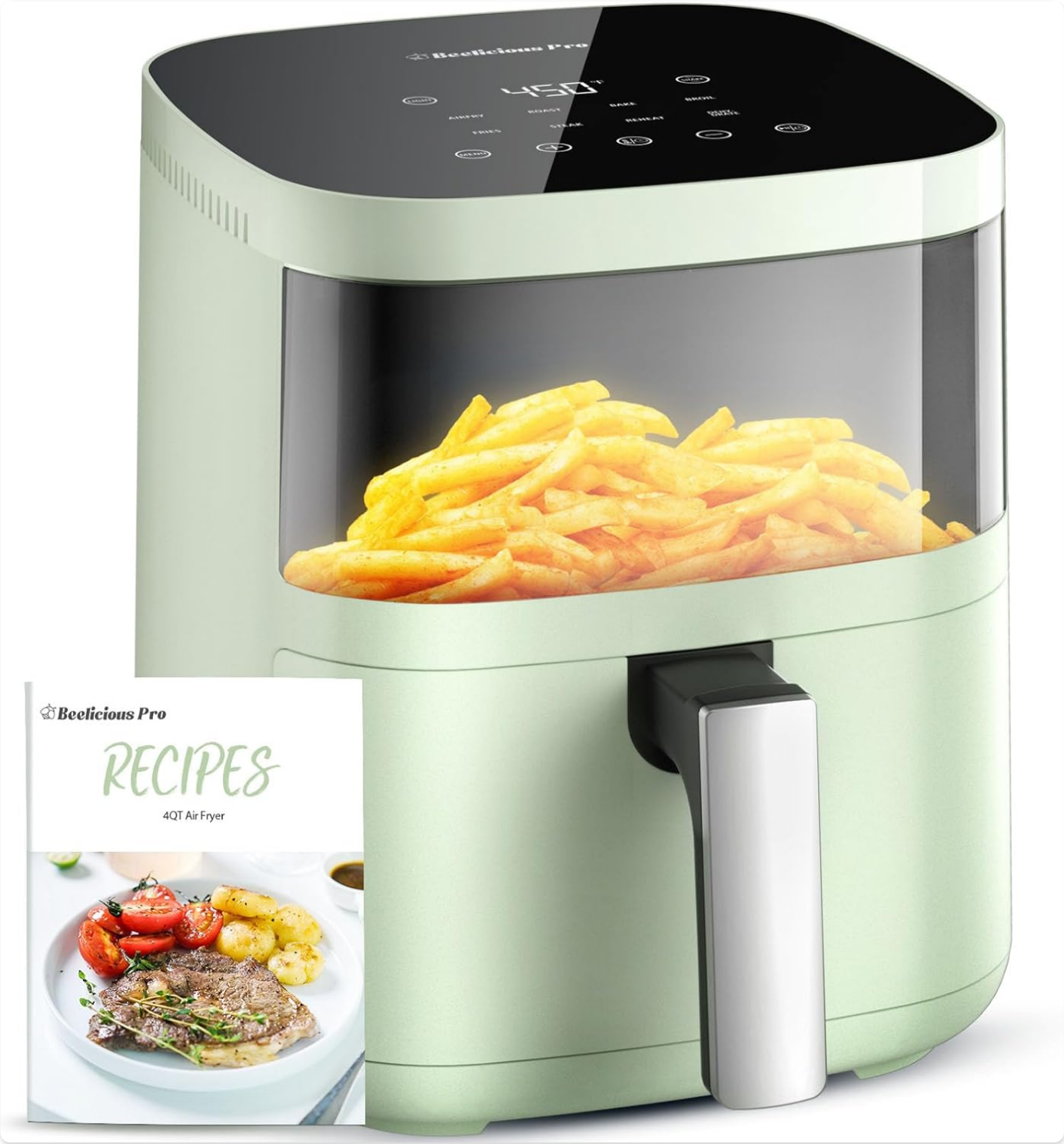
Figure 1: Beelicious 4QT Air Fryer with its compact design and included recipe book.

The Beelicious 8-In-One Smart Compact 4QT Air Fryer is designed for efficient and healthy cooking. It features a digital touch control panel, a convenient viewing window with an internal light, and a nonstick, dishwasher-safe basket.