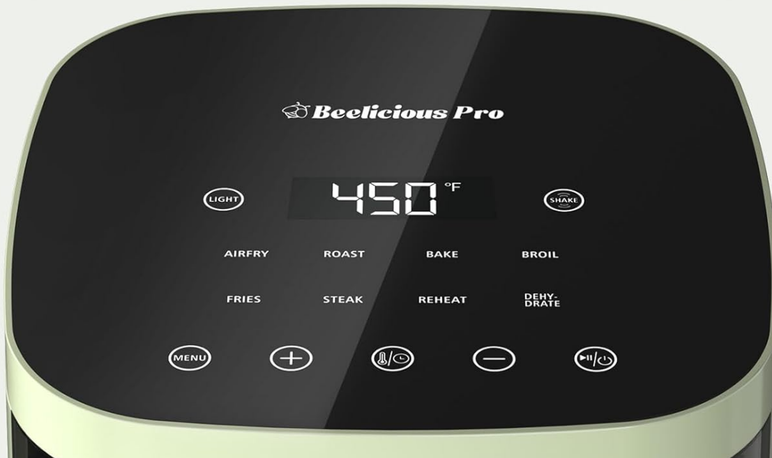
Figure 3: The digital control panel offers 8 preset cooking modes and manual temperature/time adjustments.