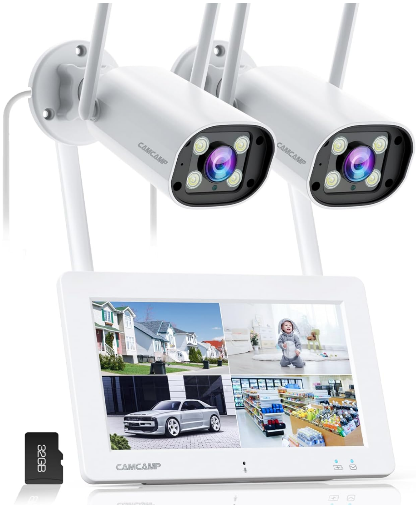
Image: The main product image, illustrating the security system's components and hinting at motion detection capabilities.