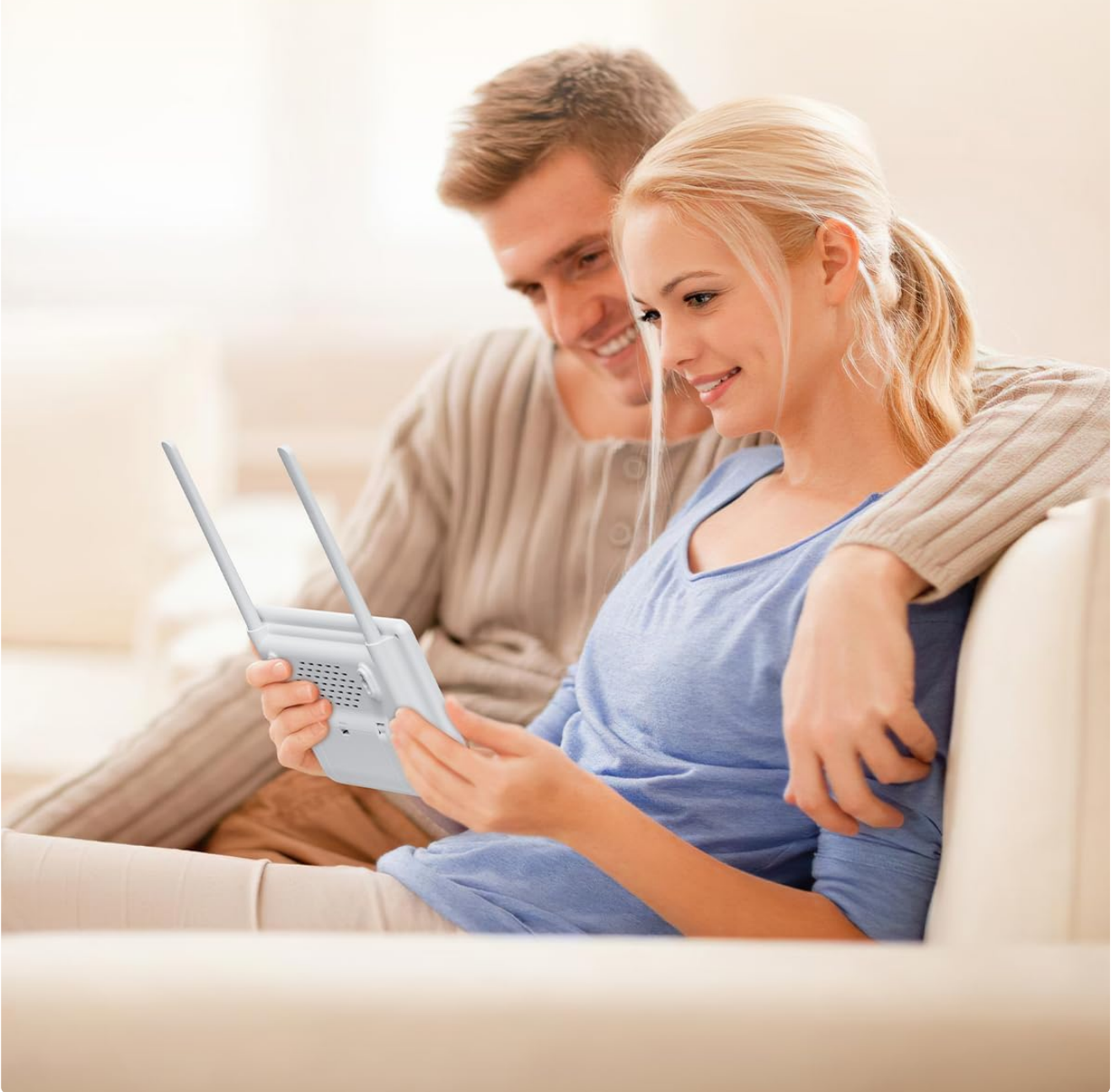
Image: A person comfortably viewing the portable touchscreen monitor.

Built-in 5000mAh Battery & Expandable Up to 4 Cameras