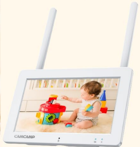
Image: The monitor showcasing different split-screen viewing configurations.