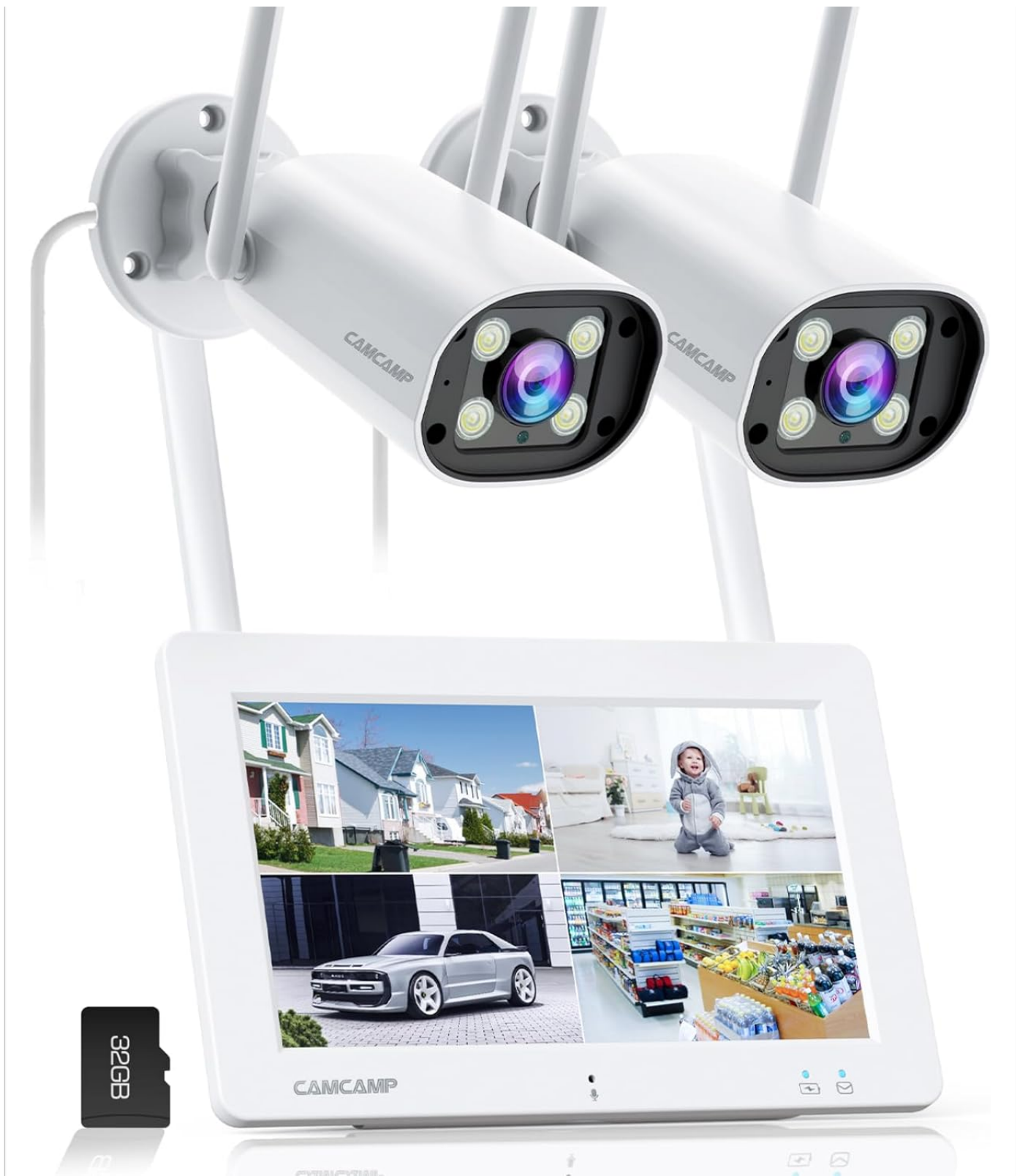
Image: The main product image, showcasing the durable outdoor cameras.