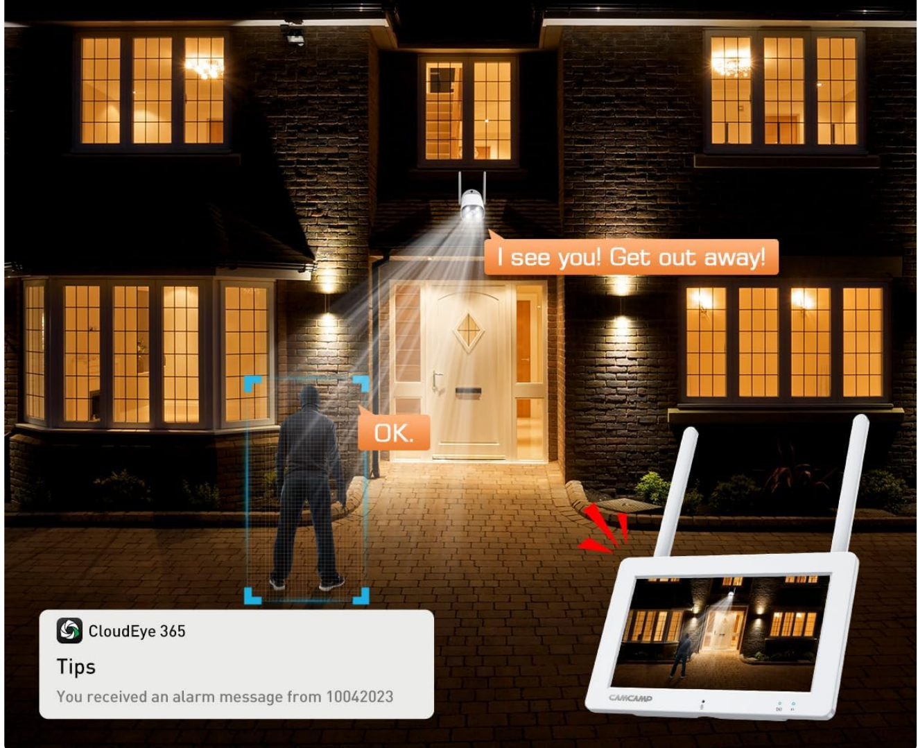
Image: A visual representation of the two-way audio feature in action, showing communication between users and subjects.