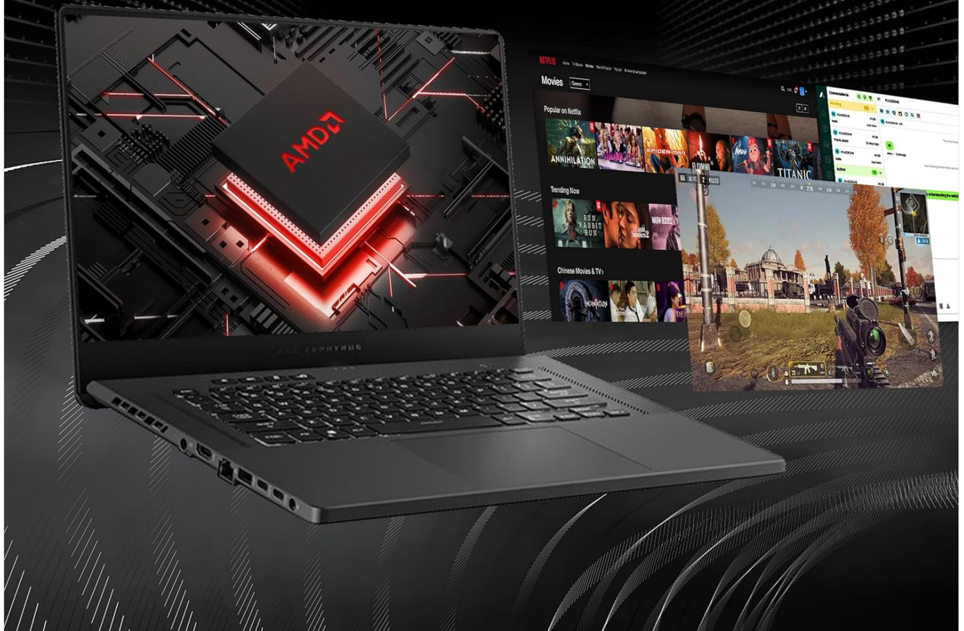
Figure 3.3: The AMD CPU, built using cutting-edge 6nm technology, designed for heavy-duty workloads and high performance.

Built using cutting-edge 6nm technology, this high performance CPU is ready to tackle heavy duty workloads.