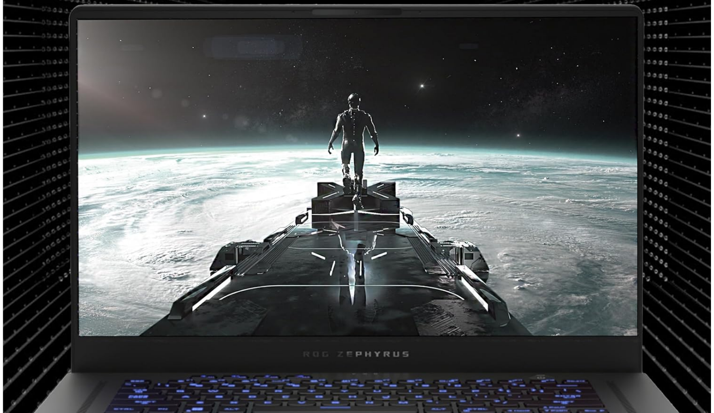
Figure 3.1: Key display features of the ROG Zephyrus, highlighting its high refresh rate, color accuracy, and adaptive synchronization capabilities.