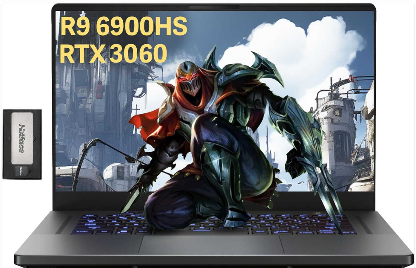
Figure 1.1: The ASUS ROG Zephyrus Gaming Laptop, showcasing its powerful AMD Ryzen 9 6900HS processor and NVIDIA GeForce RTX 3060 graphics capabilities.