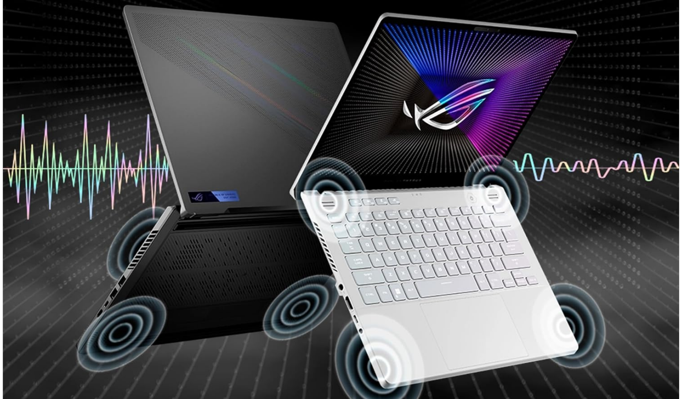
Figure 3.5: Illustration of the laptop's advanced audio system, featuring multiple speakers, AI-powered noise cancellation, and immersive Dolby Atmos sound.