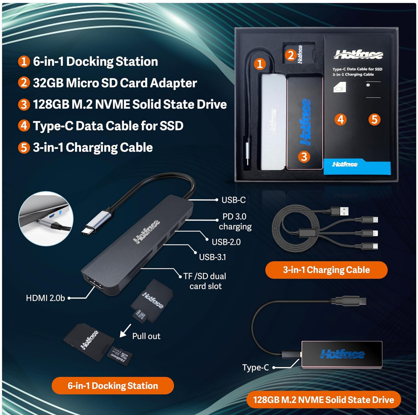
Figure 2.2: An alternative docking station set, which may include a 6-in-1 docking station and a 128GB M.2 NVME Solid State Drive, along with cables and adapter.