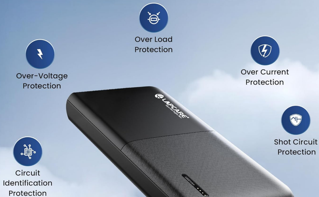
Image: Diagram illustrating the multi-layer chipset protection, including over-voltage, over-current, over-load, short circuit, and circuit identification protection.