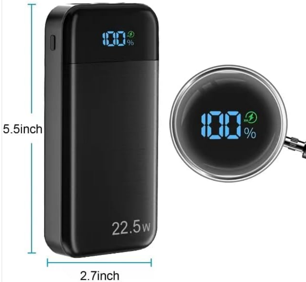
Image Description: A visual representation of the power bank's smart LED display showing "100%" battery level, alongside its dimensions: approximately 5.5 inches in length and 2.7 inches in width.