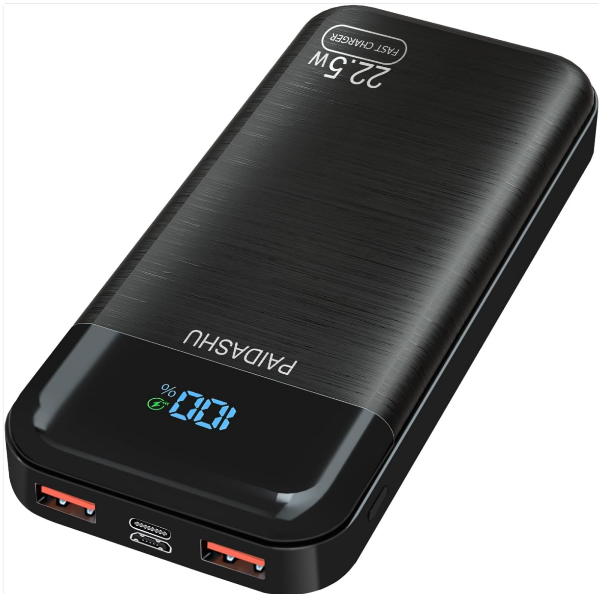
Image Description: A top-down view of the PAIDASHU 27000mAh 22.5W Power Bank, showcasing its sleek black design with a brushed texture and an illuminated LCD display showing "100%". The power bank features multiple charging ports at one end.