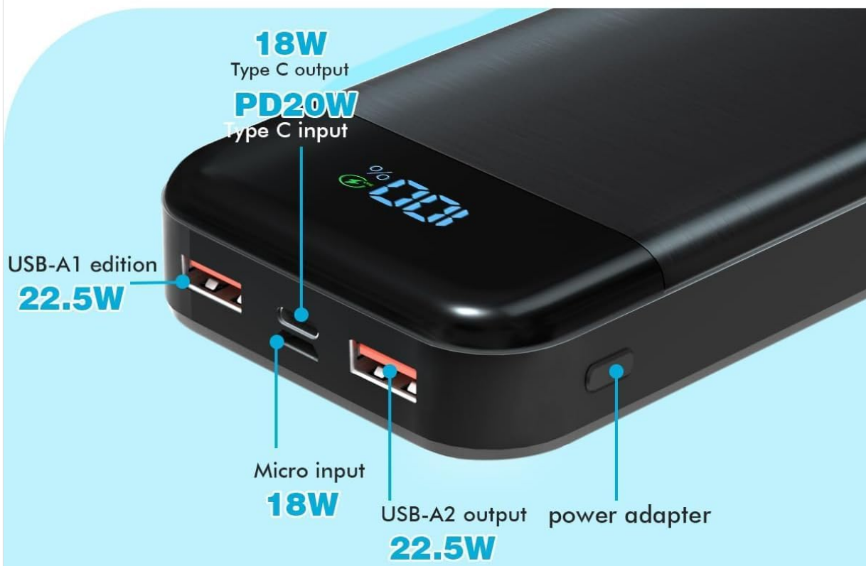
Image Description: An infographic displaying icons for various compatible devices including smartphones, iPads, laptops, sporting facilities, cameras, UAVs, earphones, and other USB-C equipment. Below, a close-up of the power bank's ports is shown, detailing the 18W Micro input, 18W Type C output, PD20W Type C input, 22.5W USB-A1 output, and 22.5W USB-A2 output.